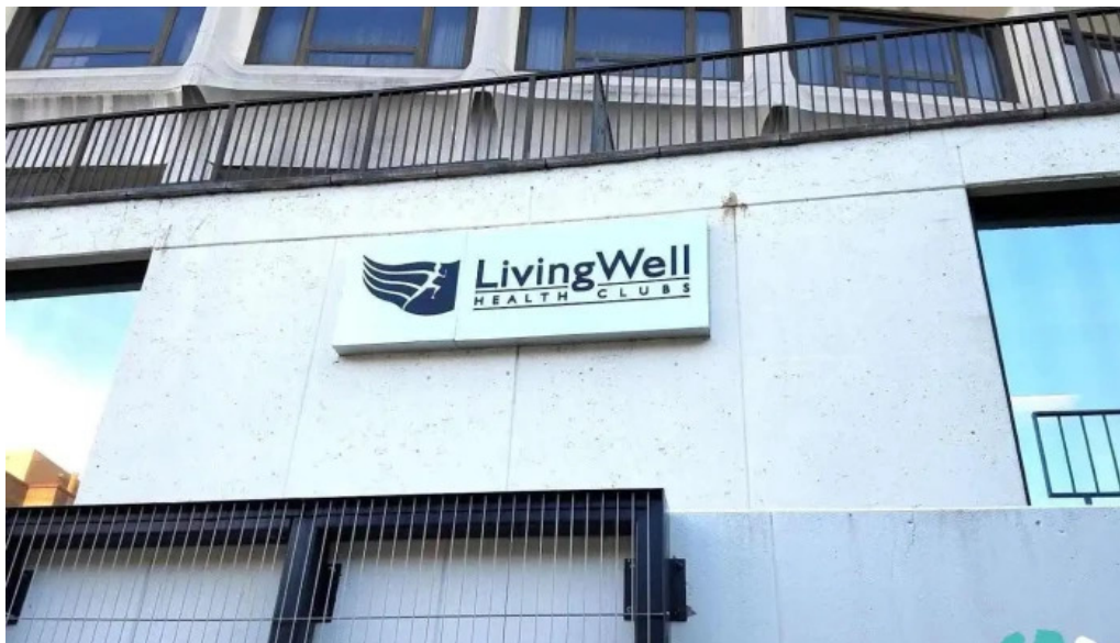
Livingwell health club ada washington