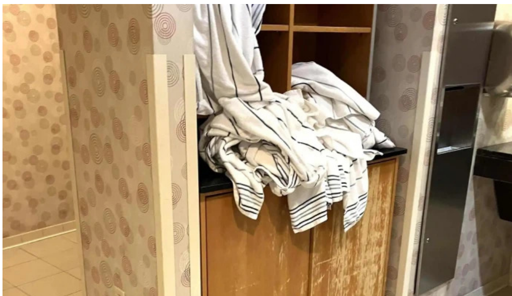
Livingwell health club ada gym