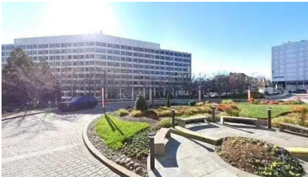
Livingwell health club ada street view 360deg