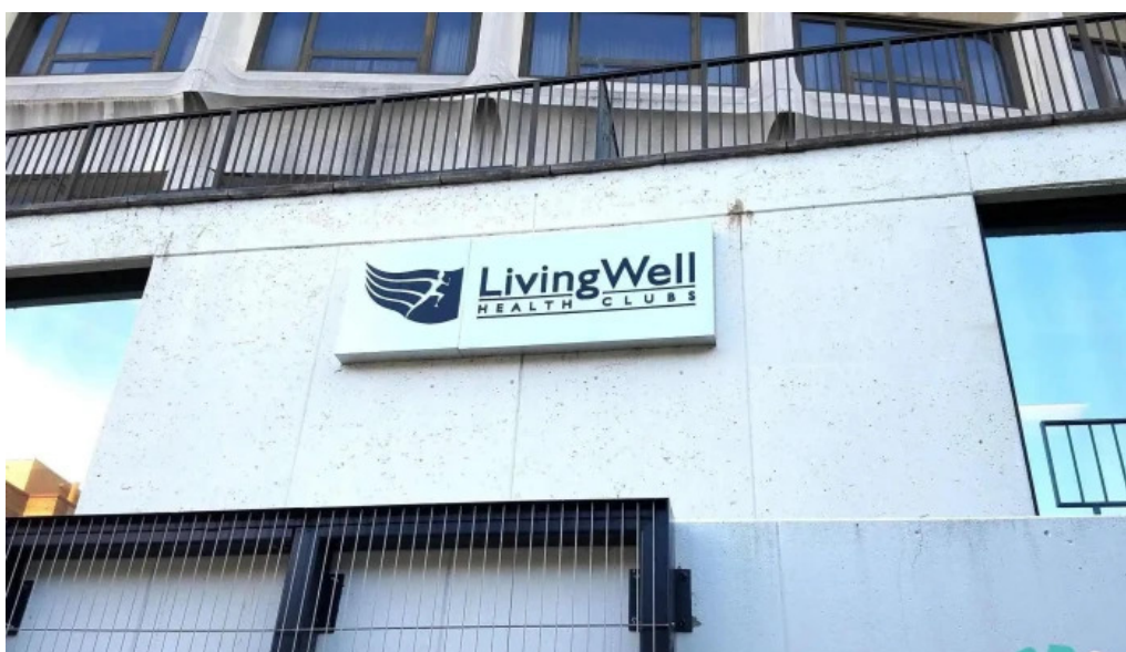
Livingwell health club ada all