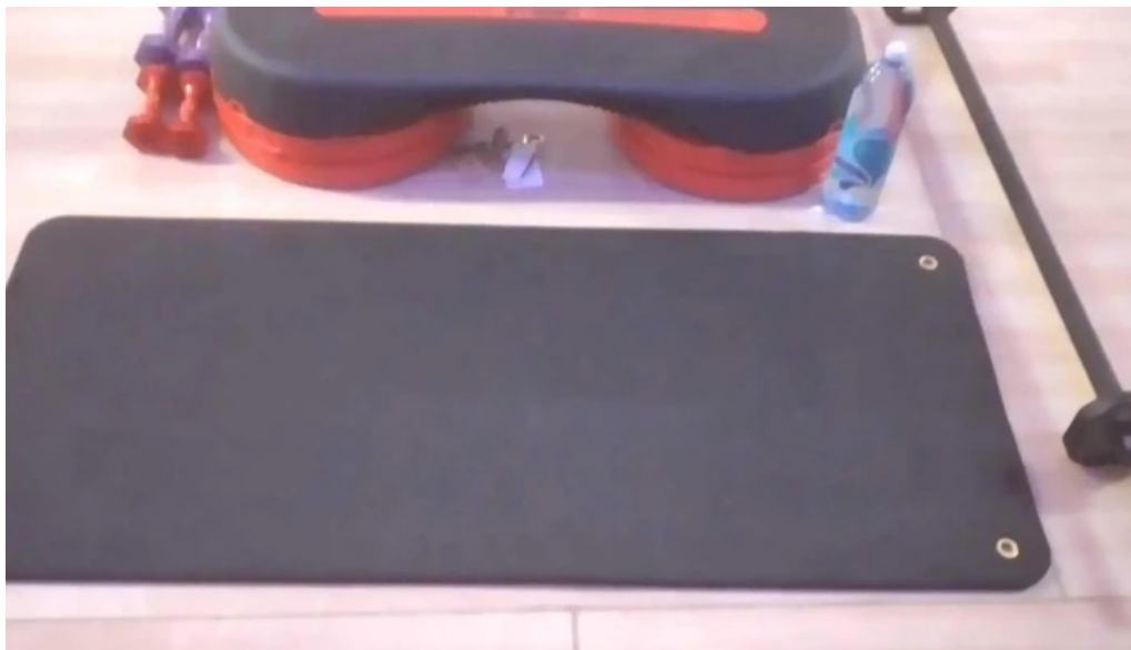
Onelife fitness fort totten promotion