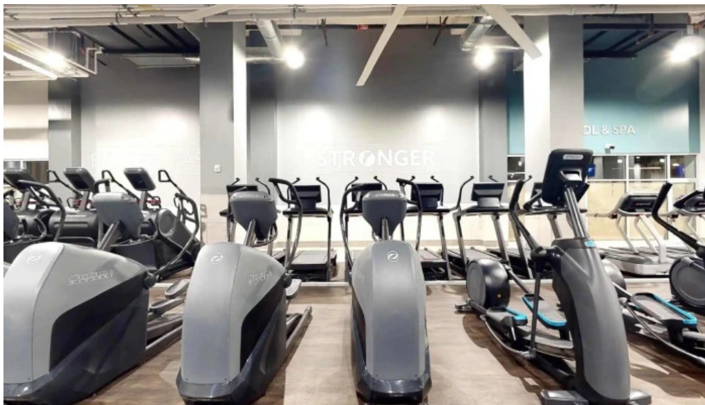
Onelife fitness fort totten street view 360deg