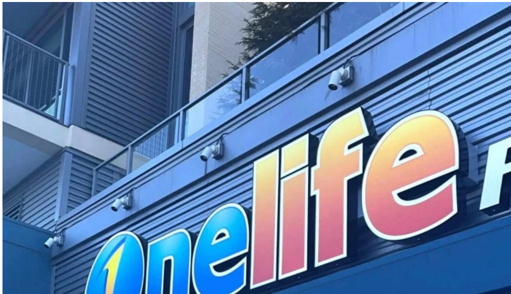
Onelife fitness fort totten location