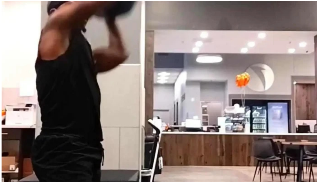
Onelife fitness fort totten videos