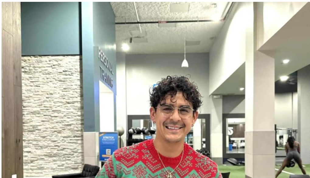
Onelife fitness fort totten catalog