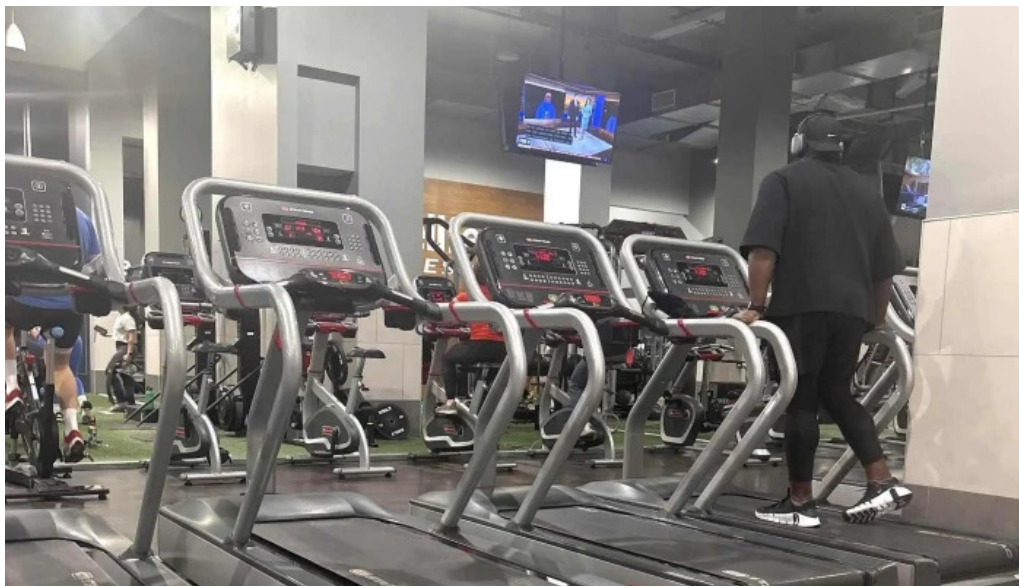
Onelife fitness fort totten washington