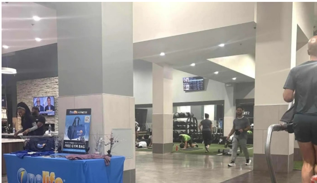
Onelife fitness fort totten gym