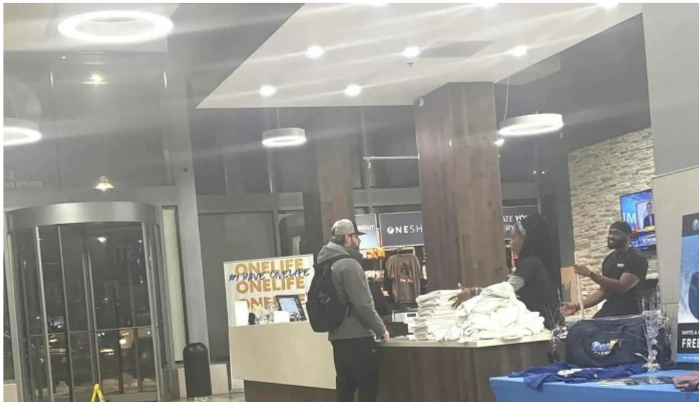
Onelife fitness fort totten score