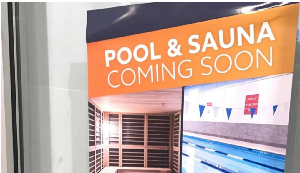
Onelife fitness fort totten comments