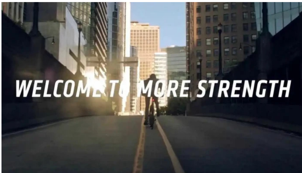
Orangetheory fitness videos