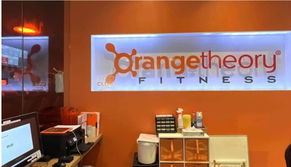
Orangetheory fitness washington