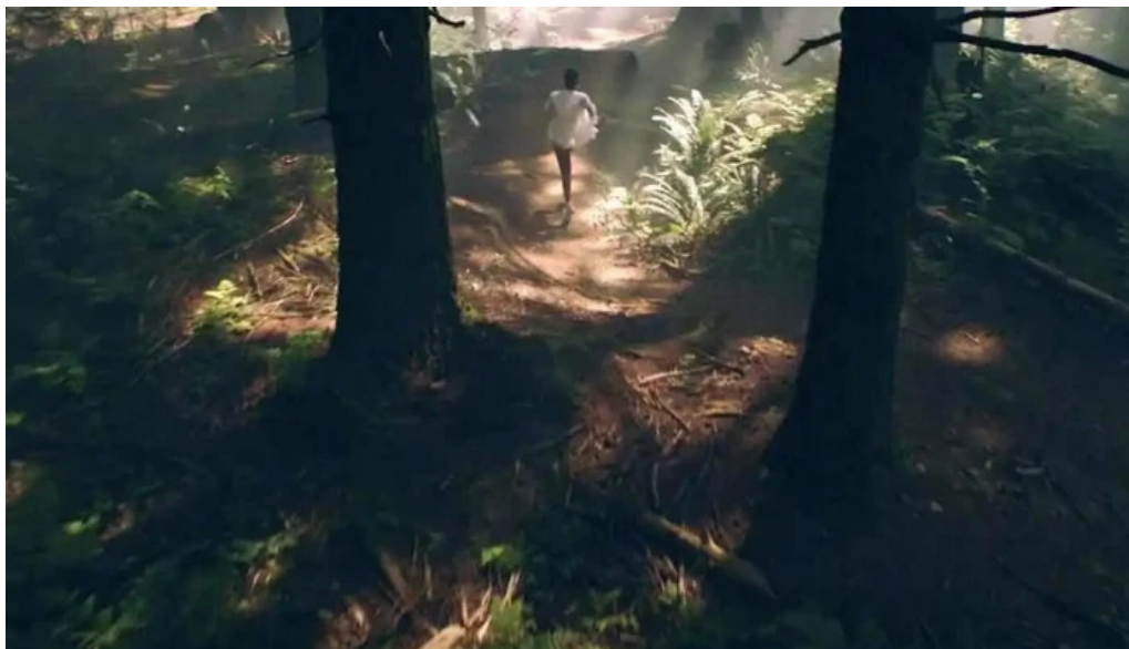
Orangetheory fitness by owner