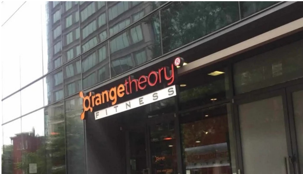
Orangetheory fitness gym