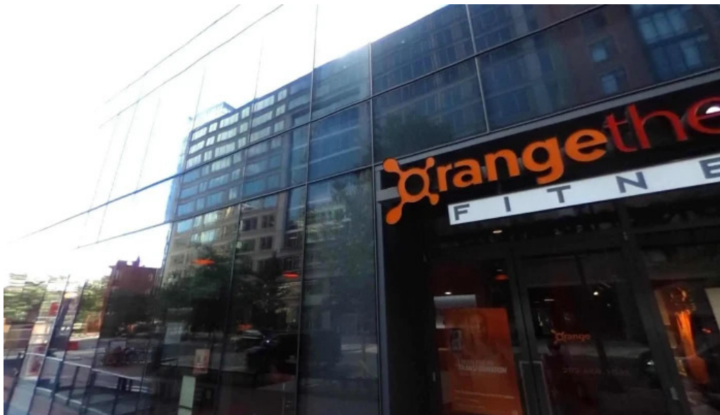
Orangetheory fitness street view 360deg