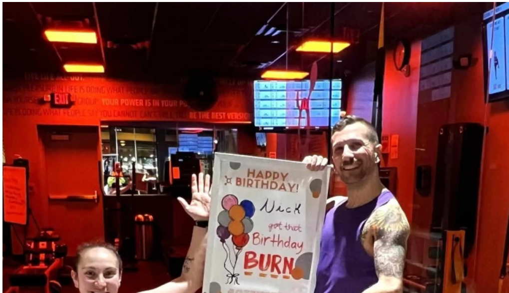
Orangetheory fitness gym