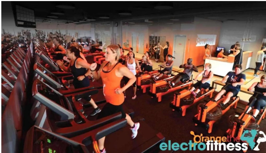
Orangetheory fitness all