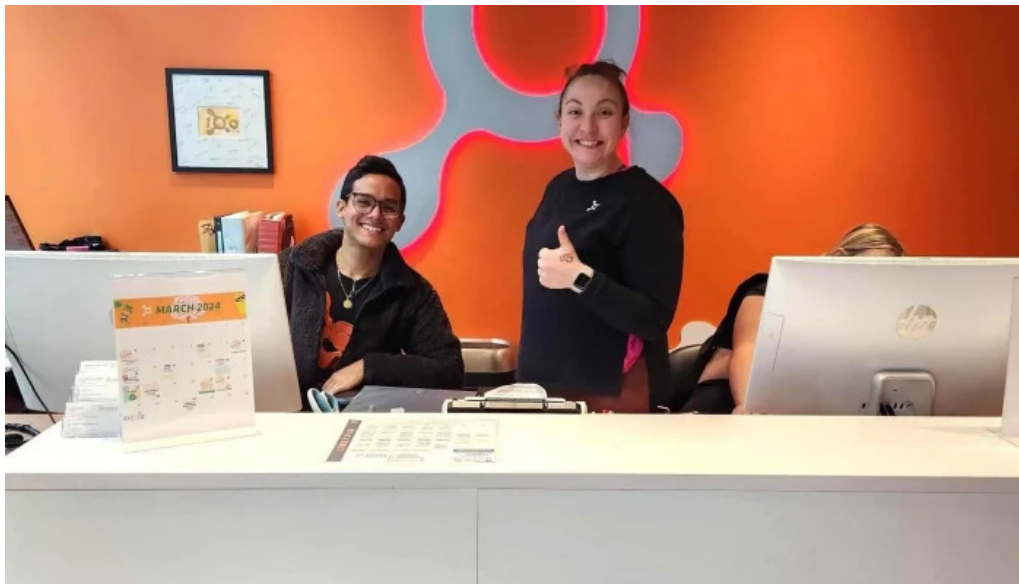
Orangetheory fitness washington