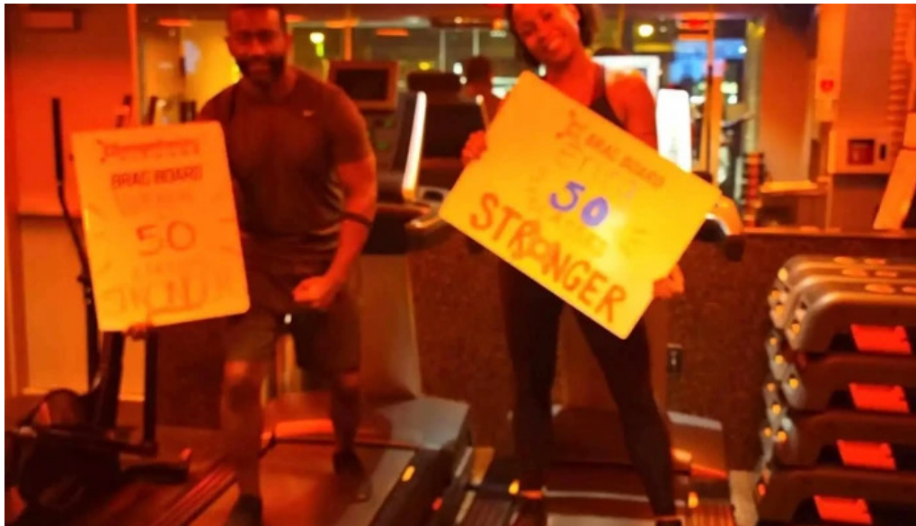
Orangetheory fitness number