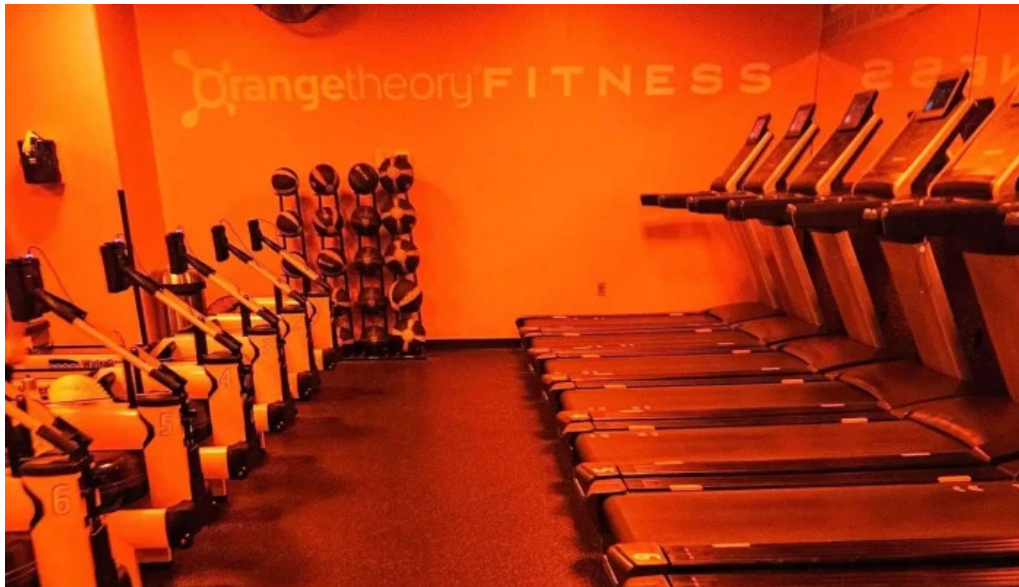
Orangetheory fitness photos