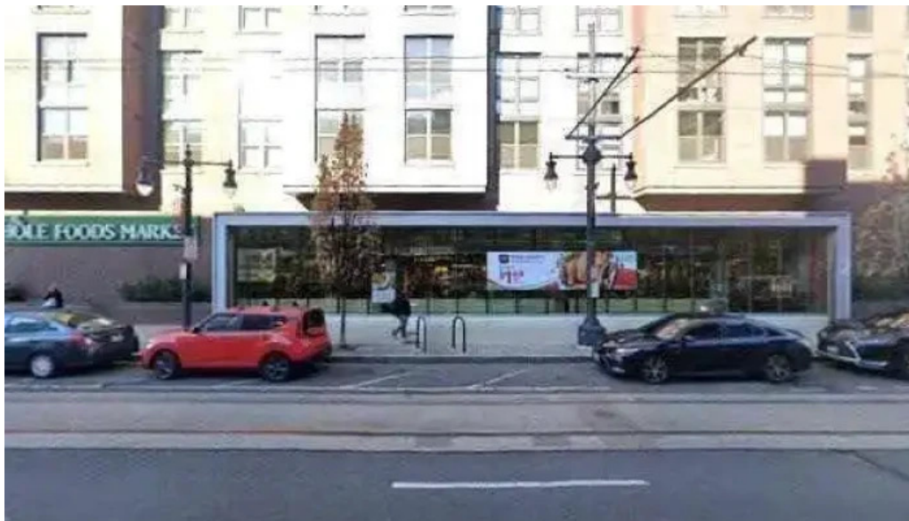
Orangetheory fitness street view 360deg