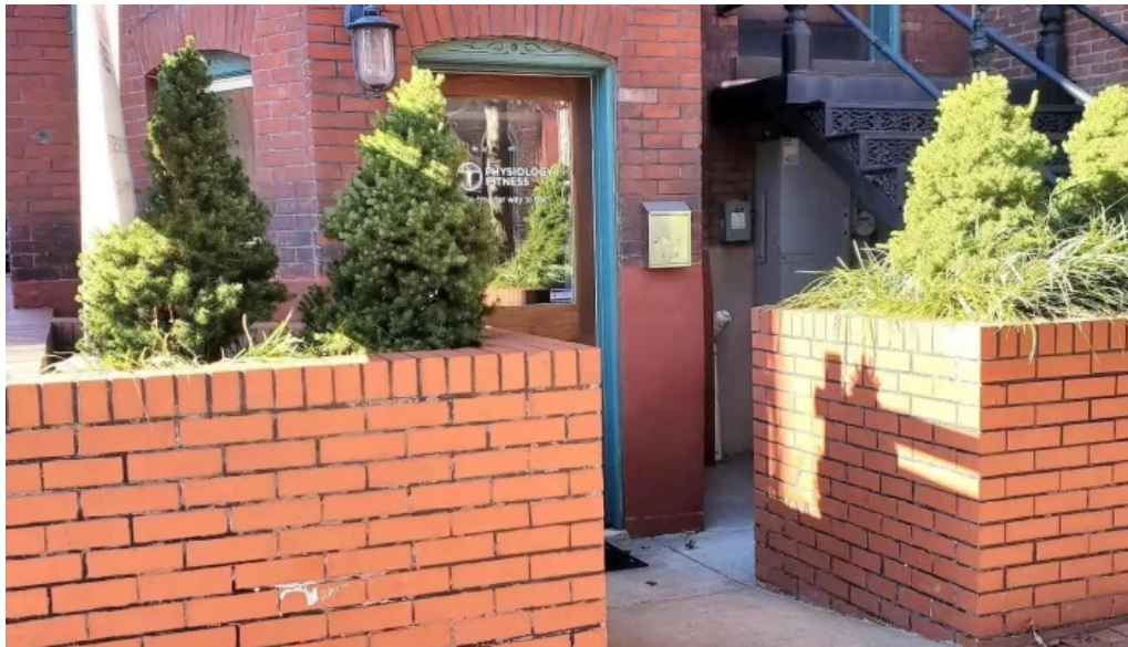
Physiology fitness all