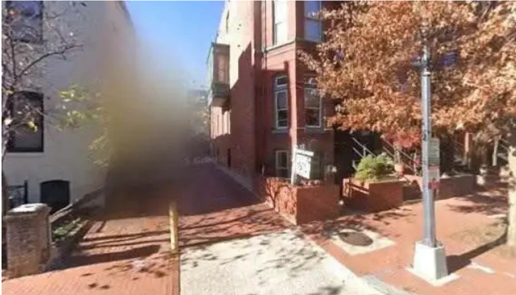
Physiology fitness street view 360deg