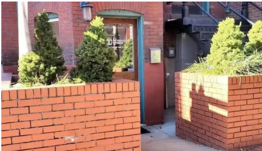
Physiology fitness washington