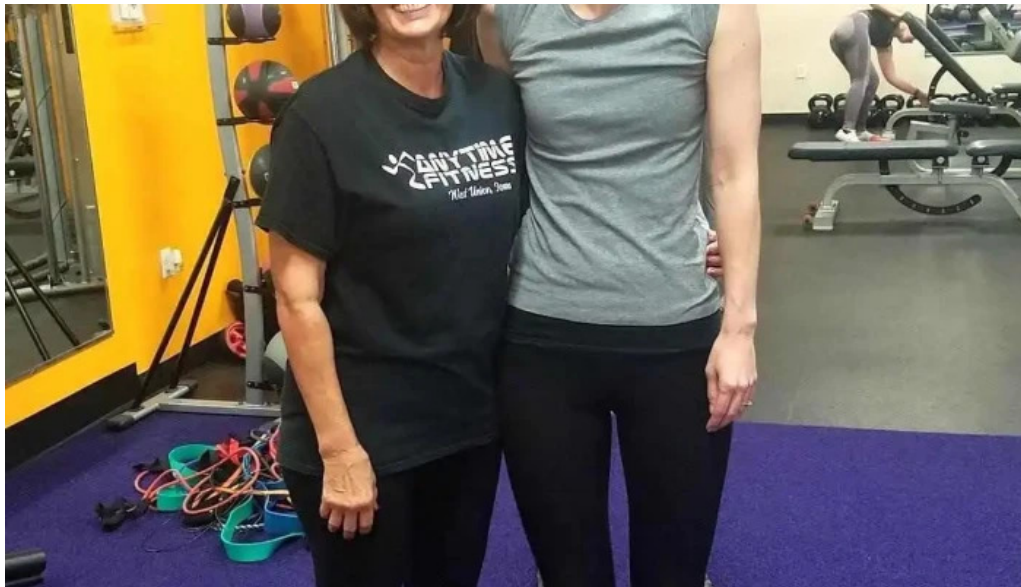
Anytime fitness gym