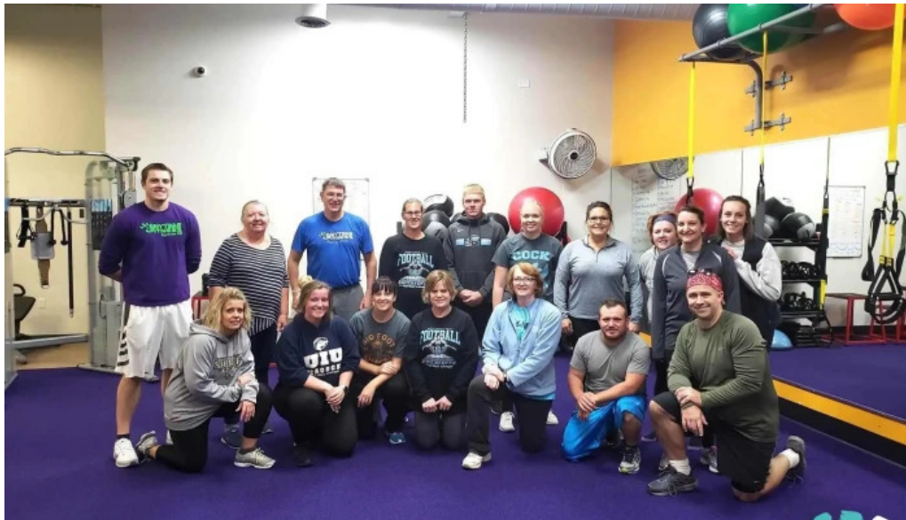
Anytime fitness all