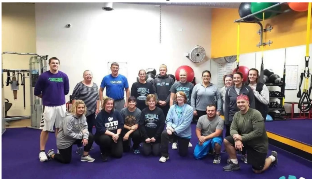
Anytime fitness west union