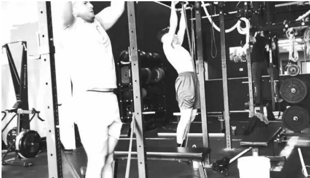
Champlain valley community fitness latest