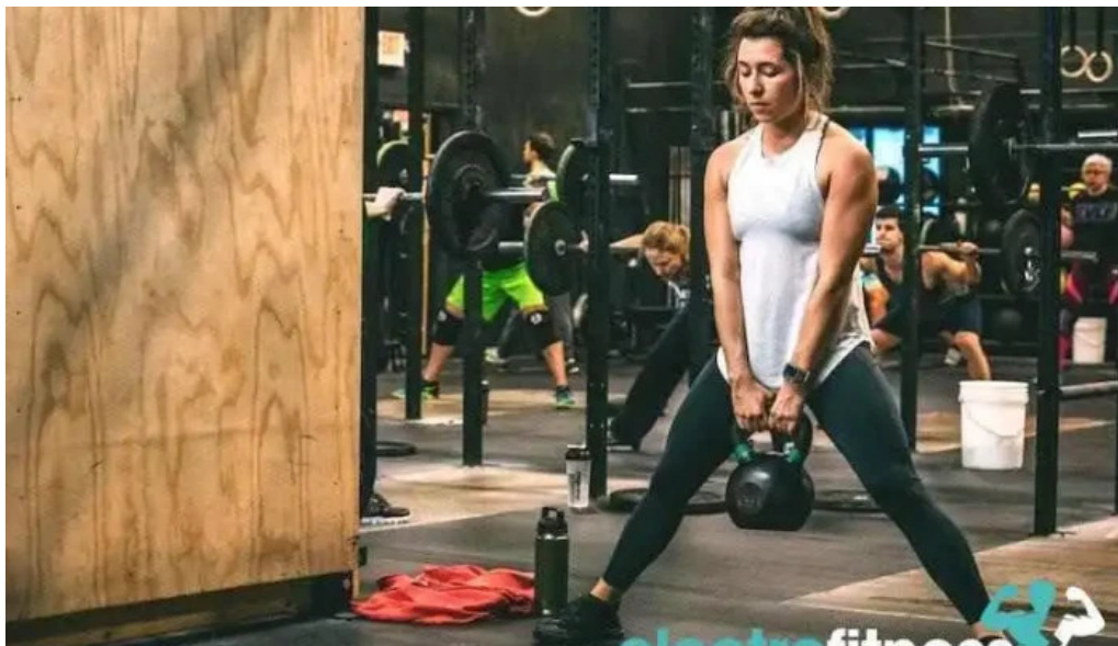
Champlain valley community fitness all