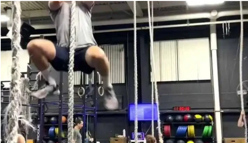
Champlain valley community fitness videos