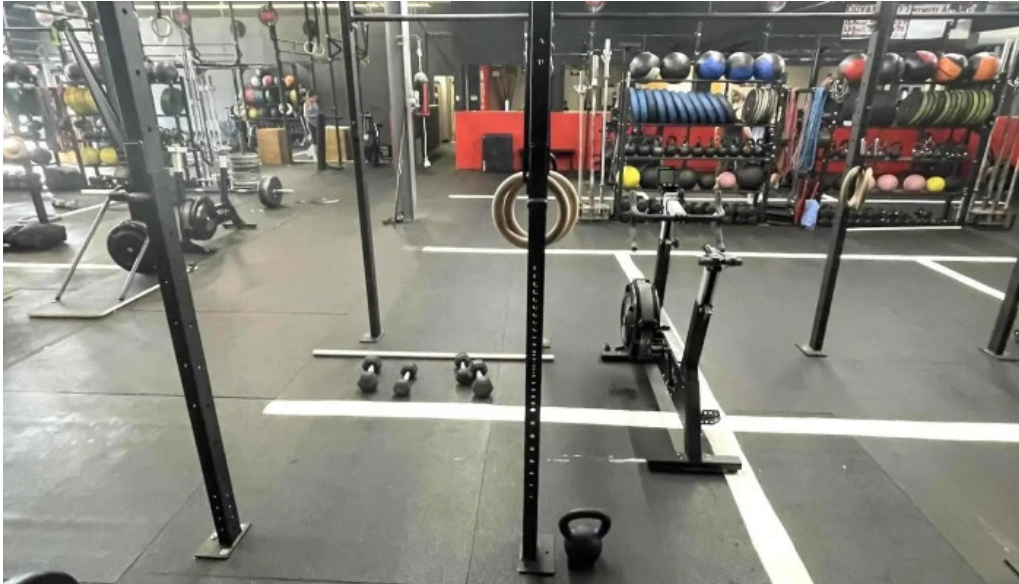
Champlain valley community fitness williston