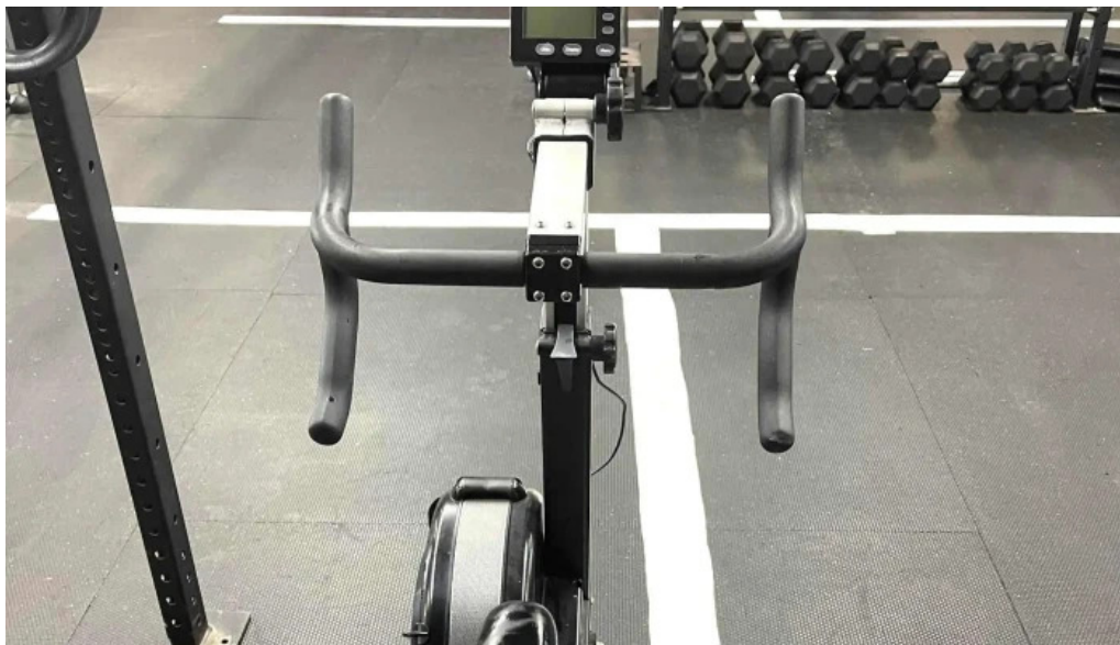
Champlain valley community fitness phone