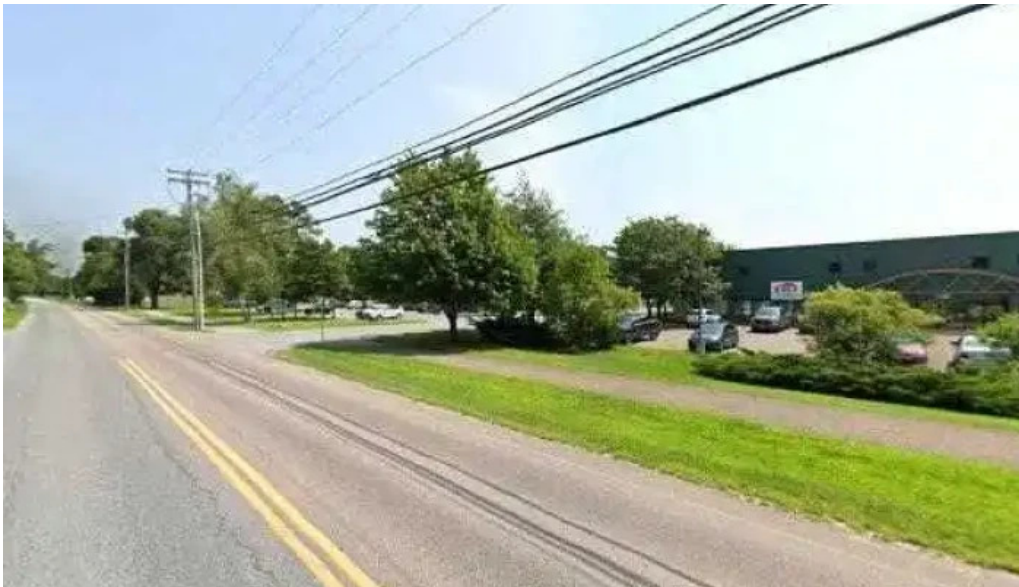
Champlain valley community fitness street view 360deg