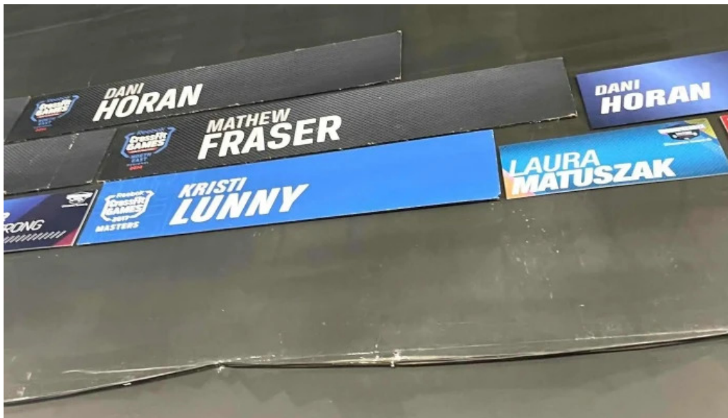
Champlain valley community fitness gym