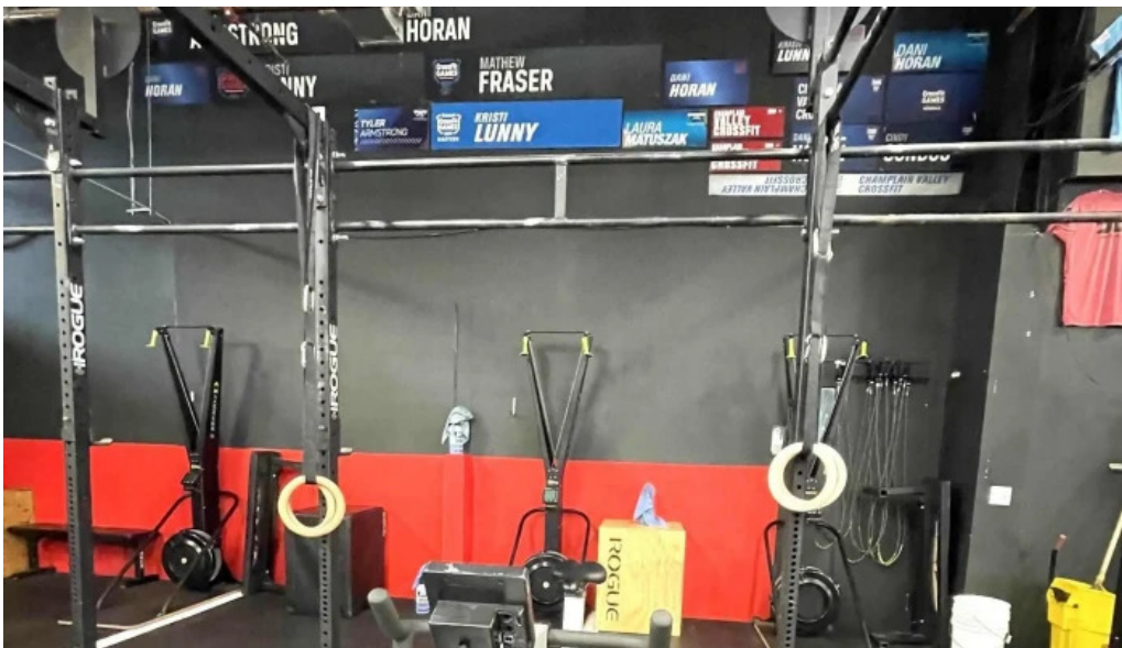
Champlain valley community fitness prices