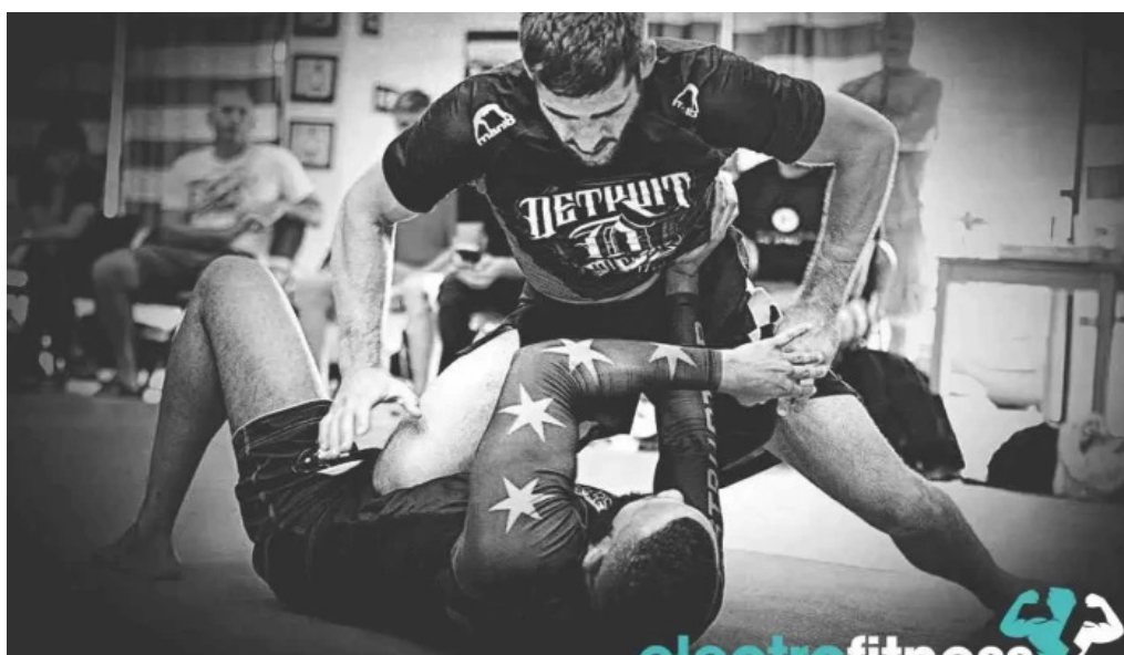
Veda combat jiu jitsu academy by owner