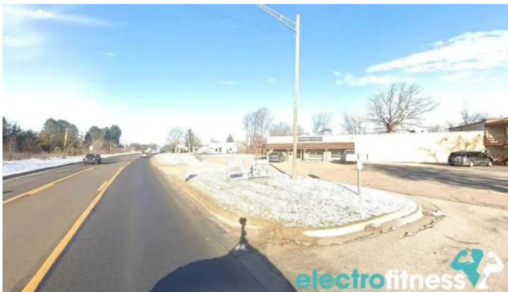
Veda combat jiu jitsu academy almont