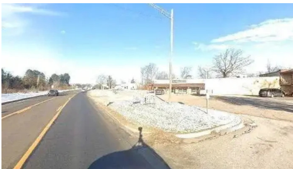
Veda combat jiu jitsu academy all