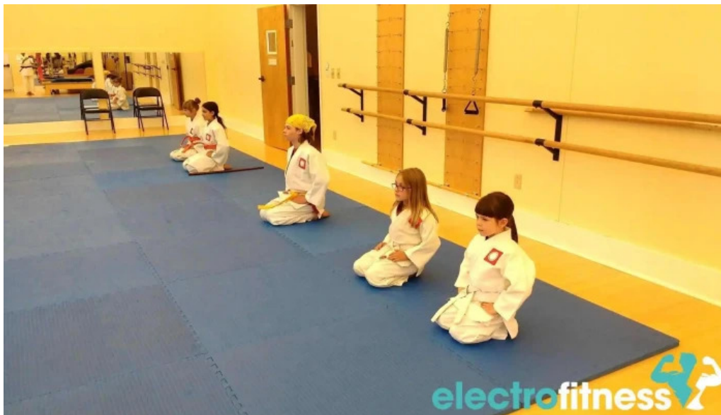
Aikido yoshokai vermont martial art