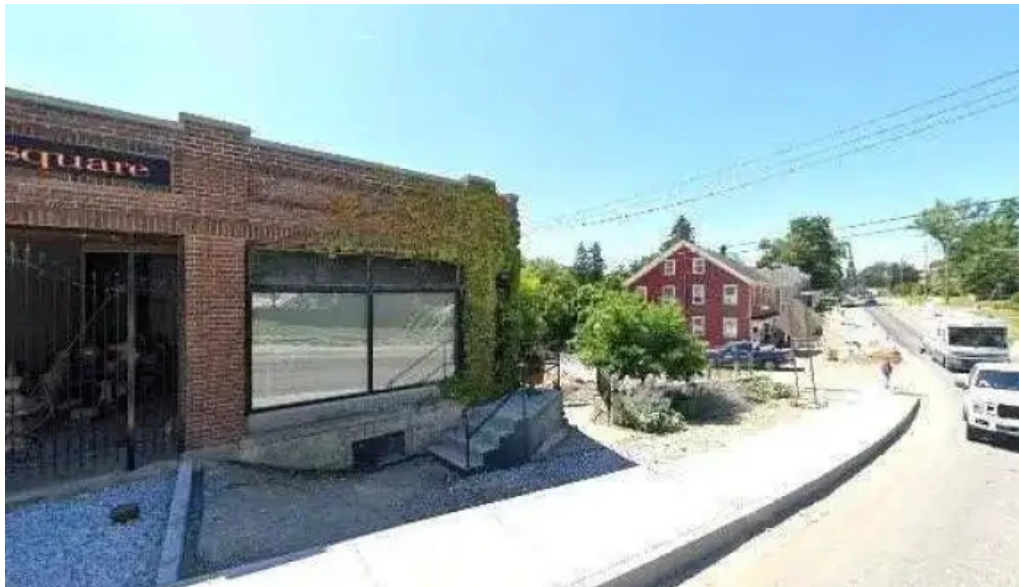
Aikido yoshokai vermont street view 360deg