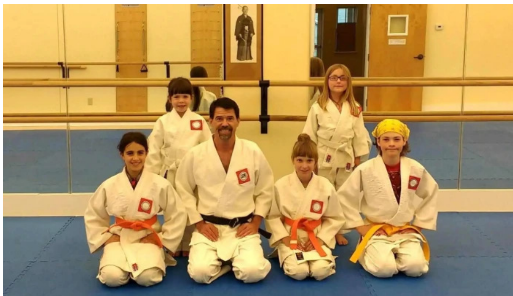
Aikido yoshokai vermont community