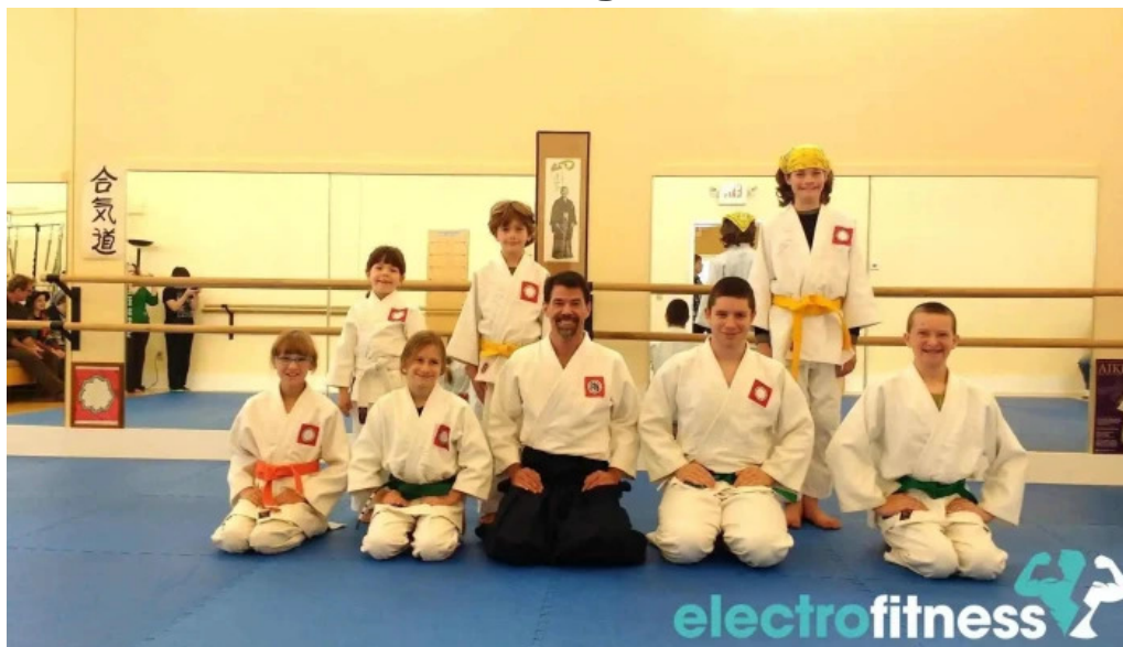
Aikido yoshokai vermont brandon