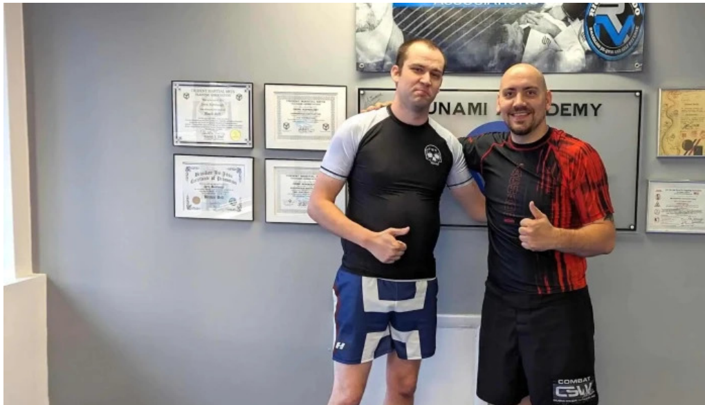
Tsunami academy of martial arts martial arts school