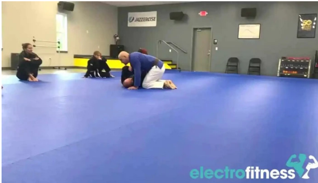
Tsunami academy of martial arts videos