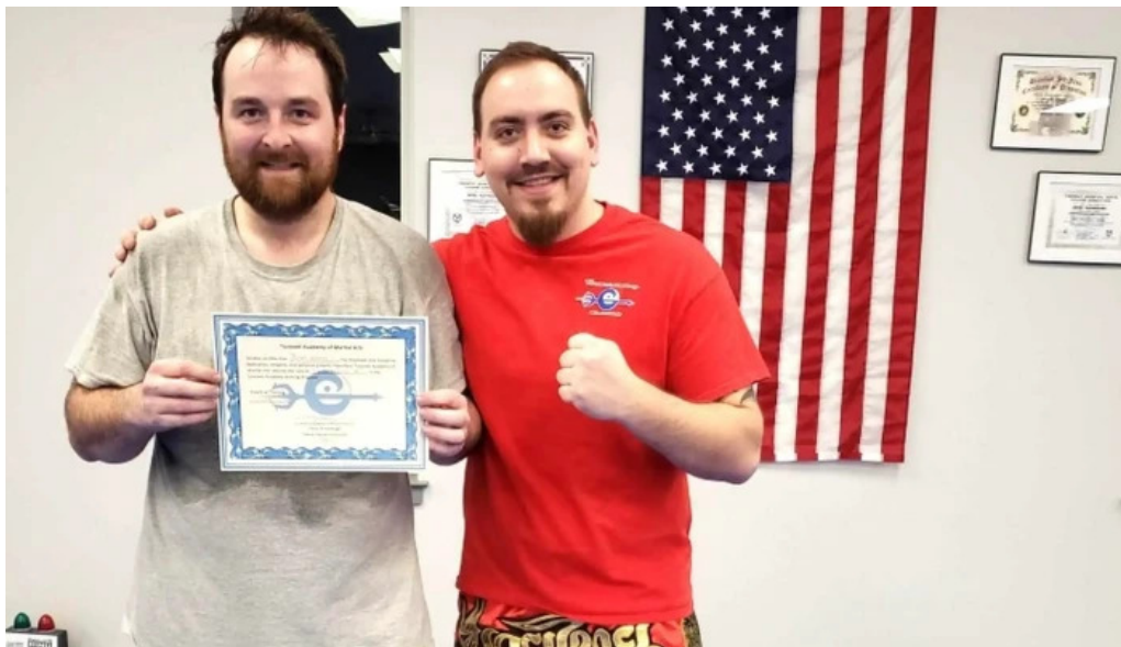
Tsunami academy of martial arts gettysburg