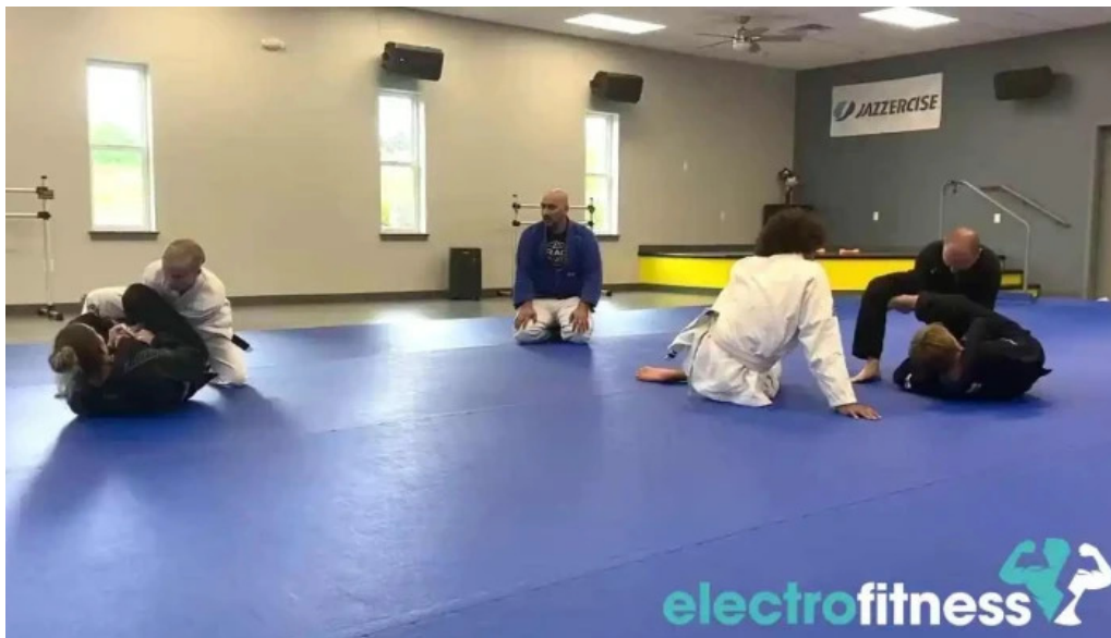
Tsunami academy of martial arts martial art