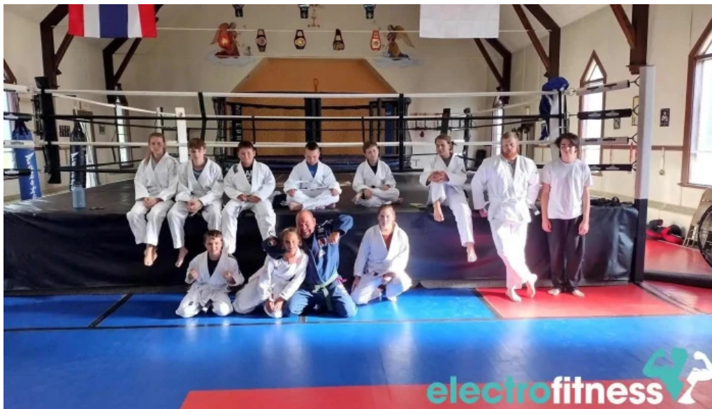
Granite city mma llc community