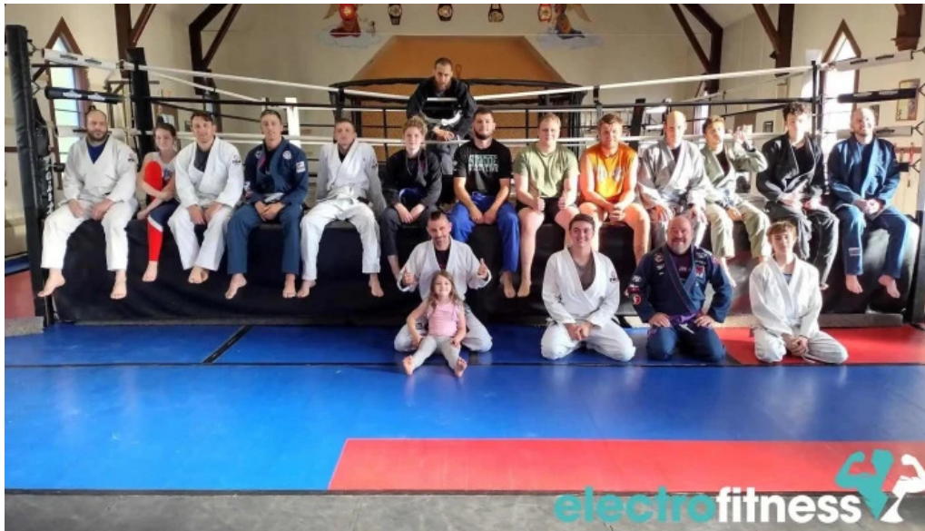
Granite city mma llc martial art