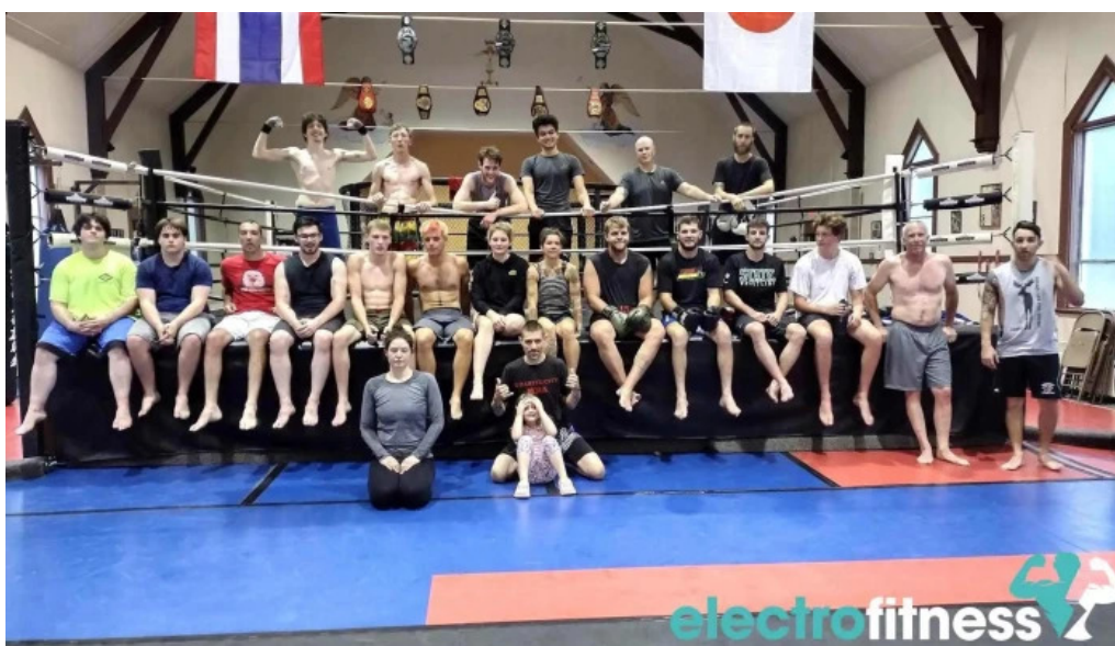
Granite city mma llc all