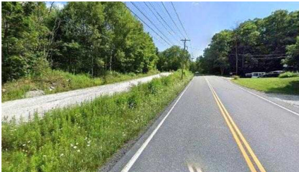
Granite city mma llc street view 360deg