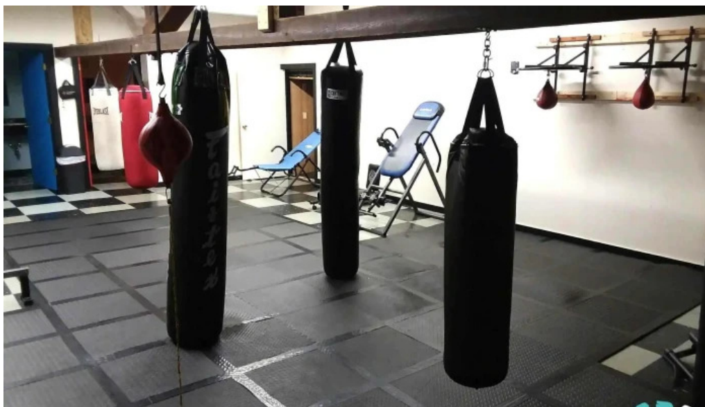
Granite city mma llc by owner