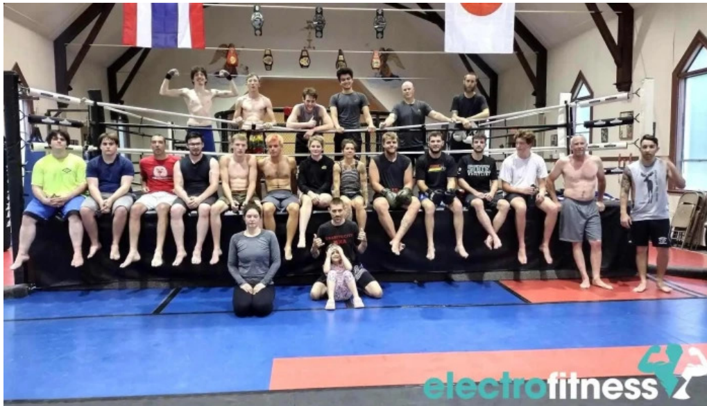
Granite city mma llc graniteville