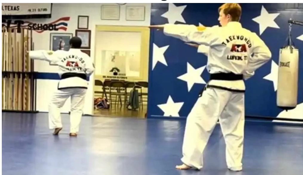
Sr master olfords ata martial arts martial art