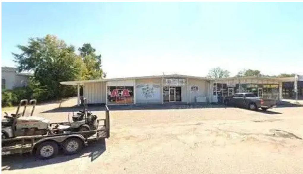
Sr master olfords ata martial arts all