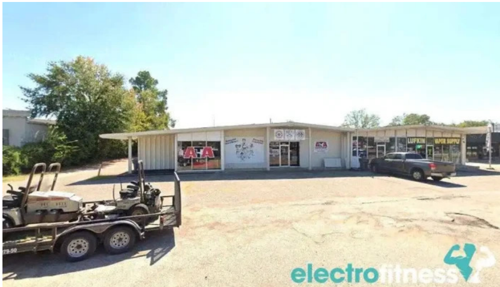
Sr master olford s ata martial arts lufkin