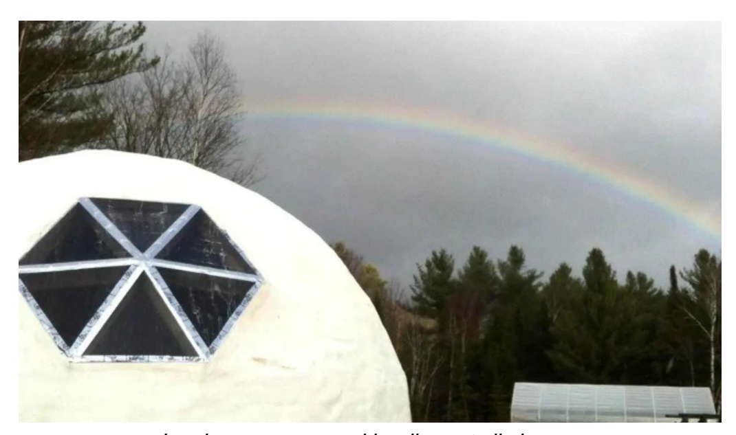
Inspire massage and healing arts Ilc by owner