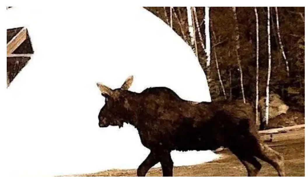
Inspire massage and healing arts Ilc all