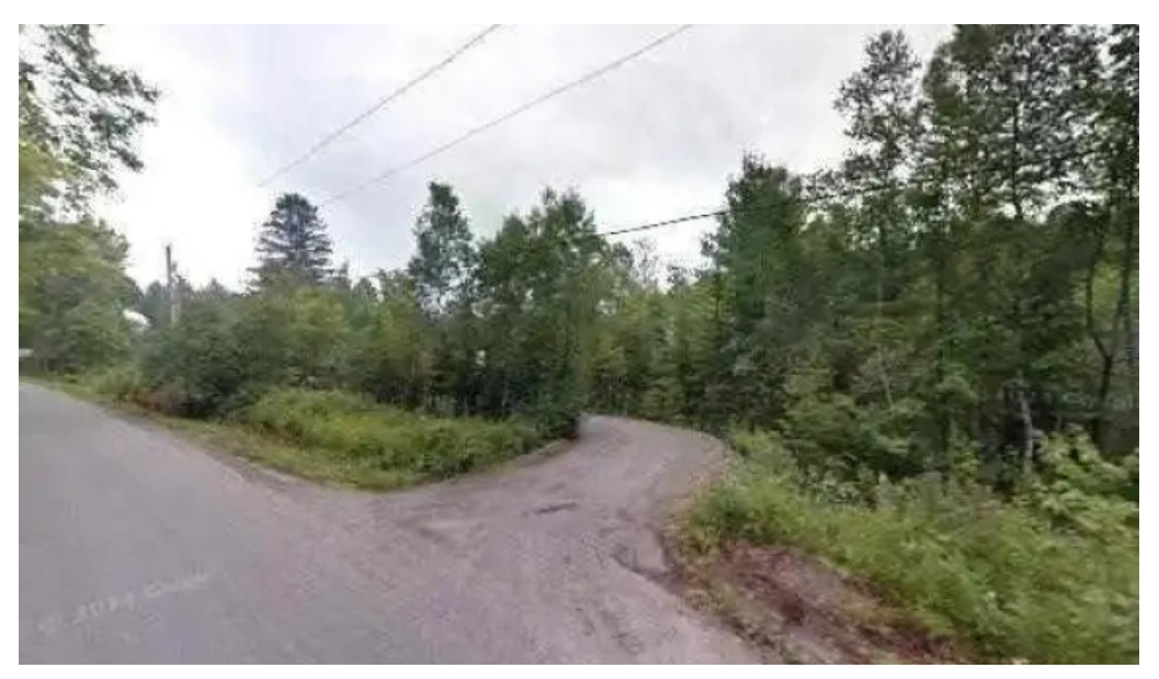
Inspire massage and healing arts Ilc street view 360deg