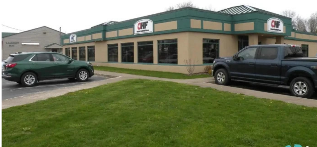
Ontario health fitness all