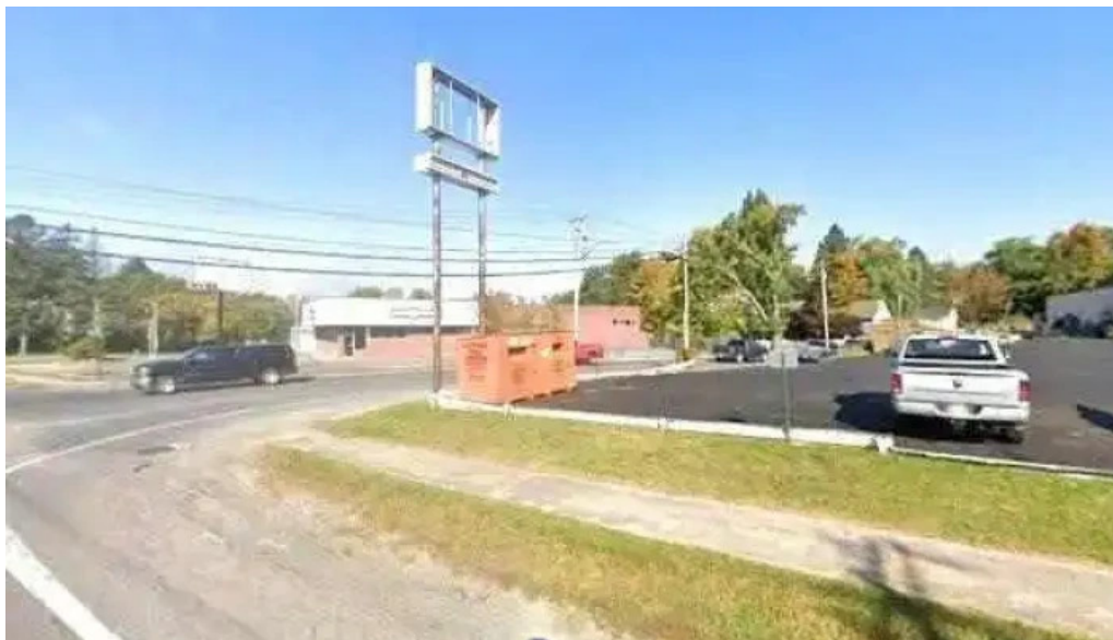
Ontario health fitness street view 360deg