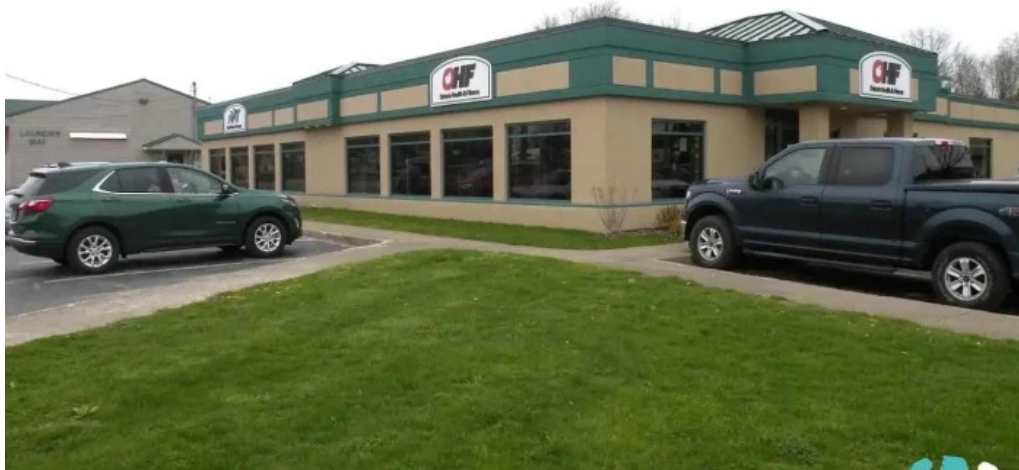
Ontario health fitness pulaski