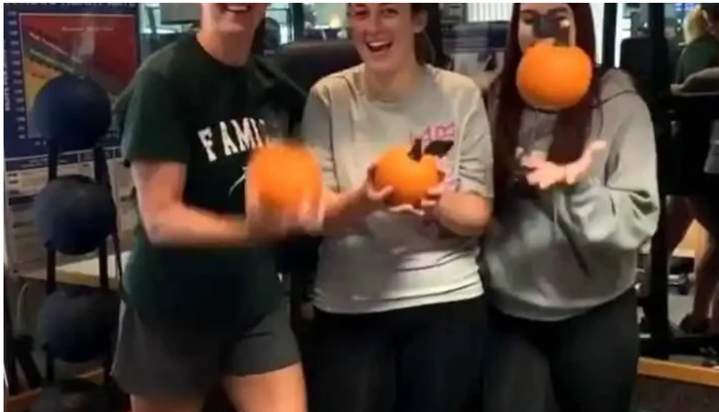
Ontario health fitness videos