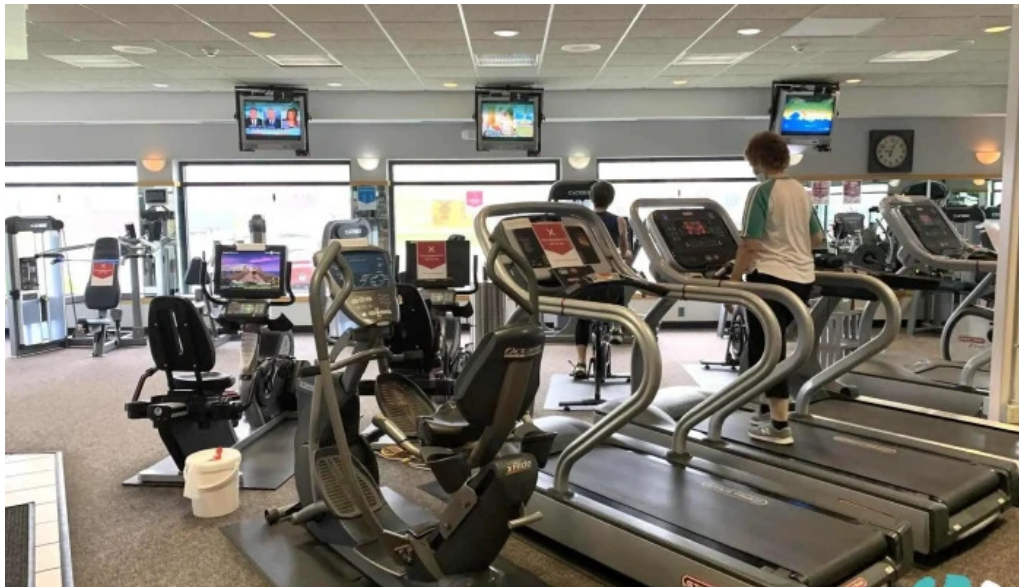
Ontario health fitness by owner