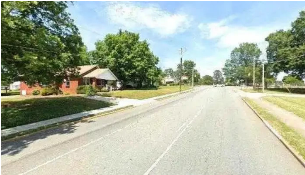
Alamance county community ymca street view 360deg