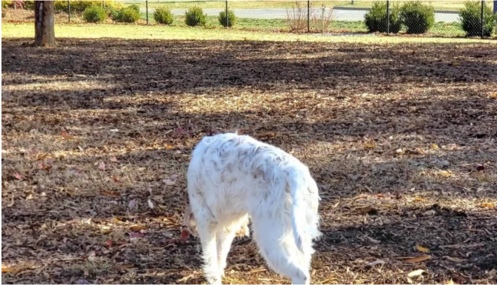
Alamance county community ymca non profit organization