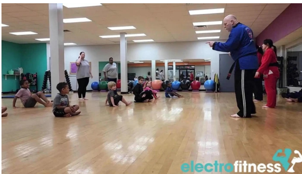
Alamance county community ymca all