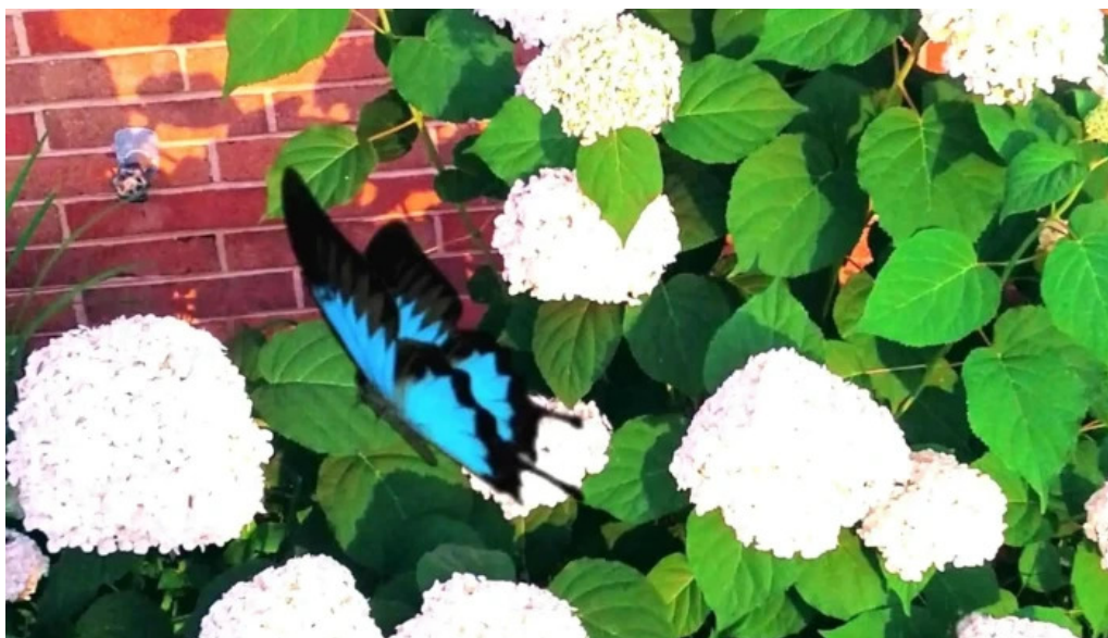
Alamance county community ymca burlington