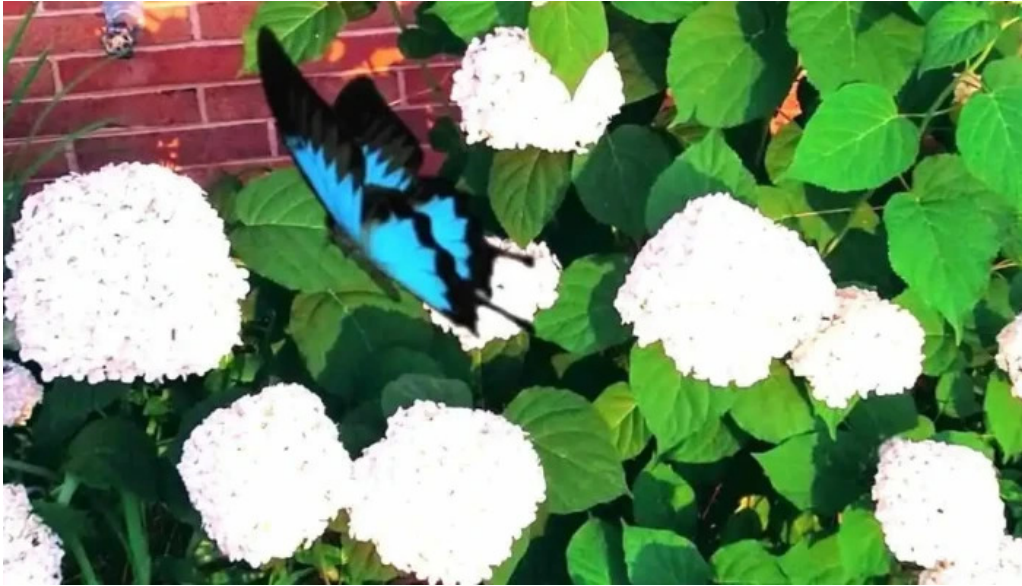
Alamance county community ymca videos