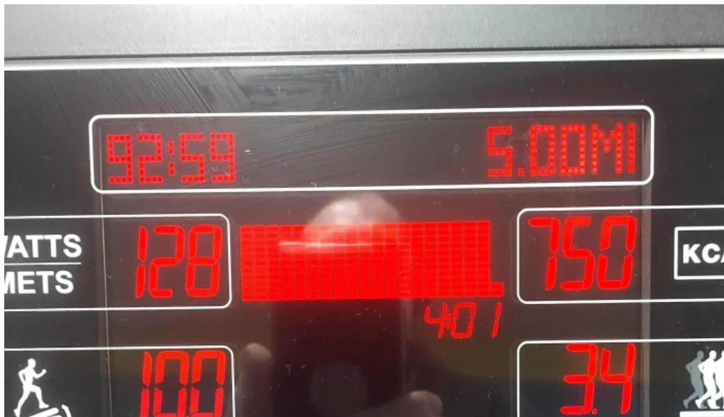
Ywca gettysburg adams county non profit organization