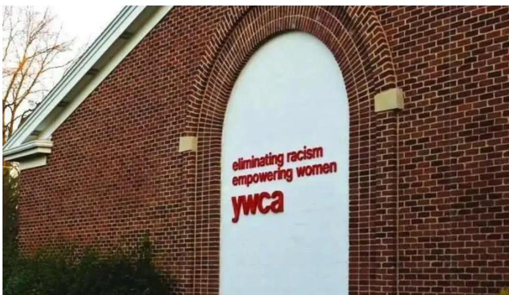
Ywca gettysburg adams county all