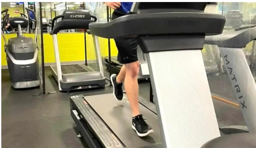
Ywca gettysburg adams county by owner