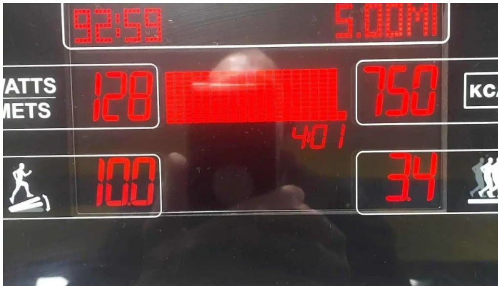
Ywca gettysburg adams county latest