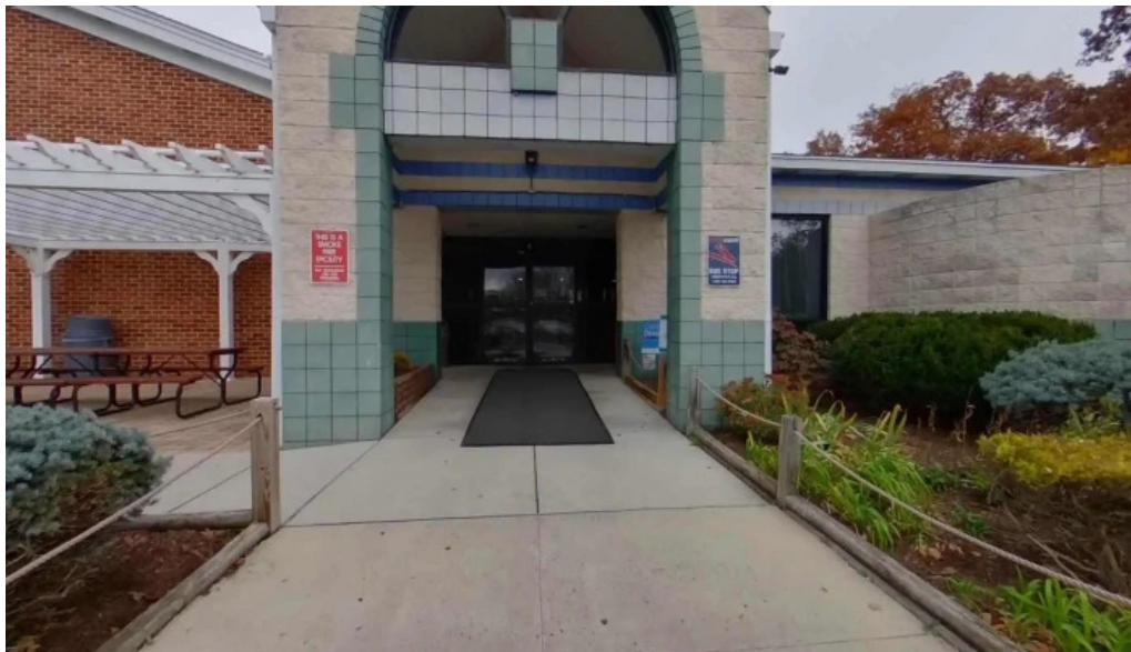
Ywca gettysburg adams county street view 360deg