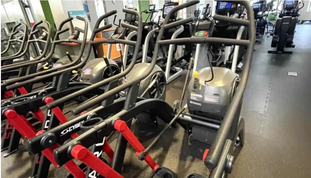
Anthony bowen branch ymca prices