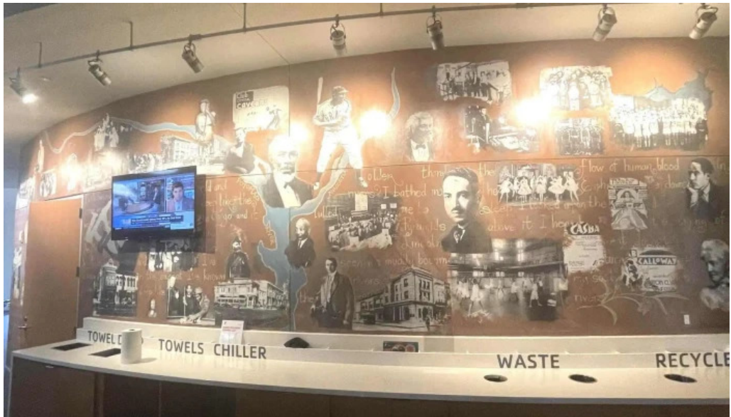
Anthony bowen branch ymca non profit organization