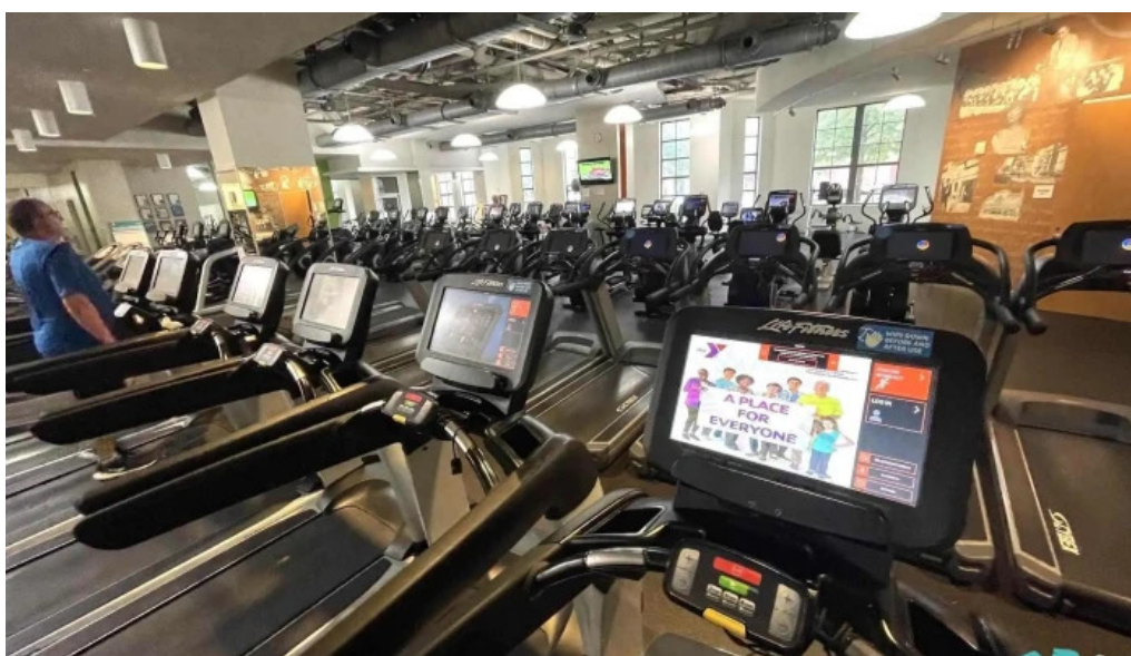
Anthony bowen branch ymca all