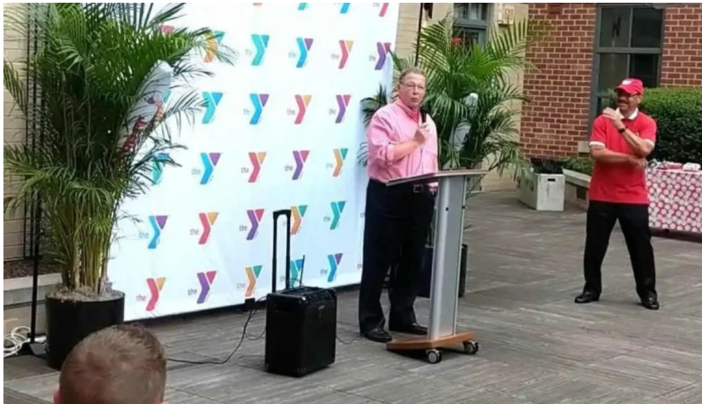
Anthony bowen branch ymca videos