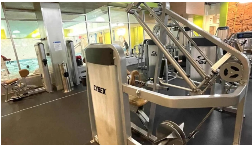
Anthony bowen branch ymca washington