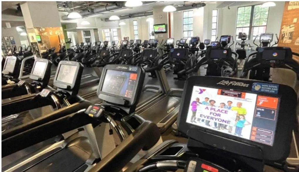
Anthony bowen branch ymca score