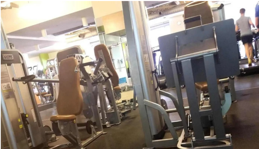
Anthony bowen branch ymca photos