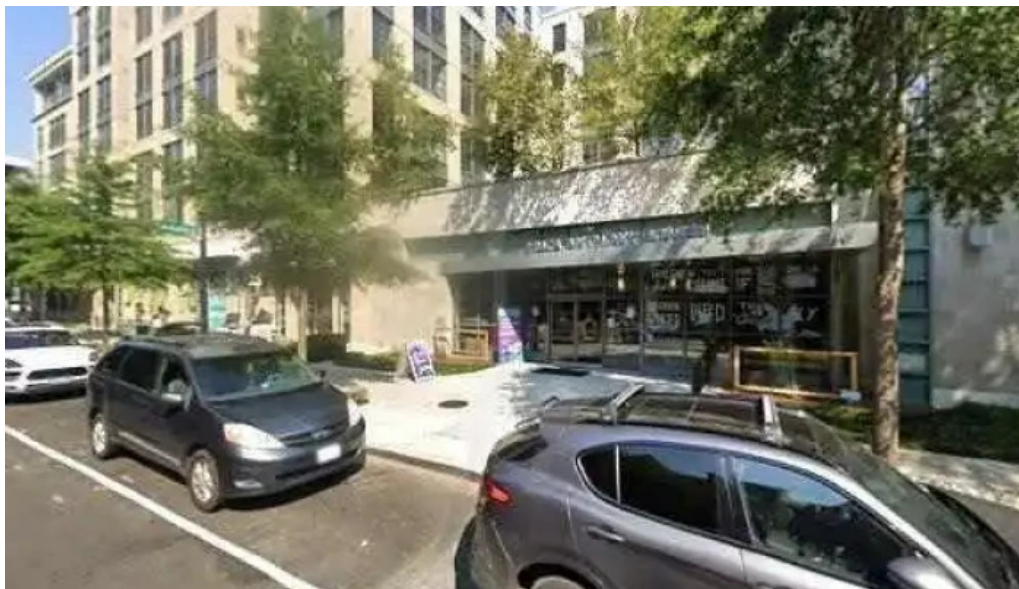
Anthony bowen branch ymca street view 360deg