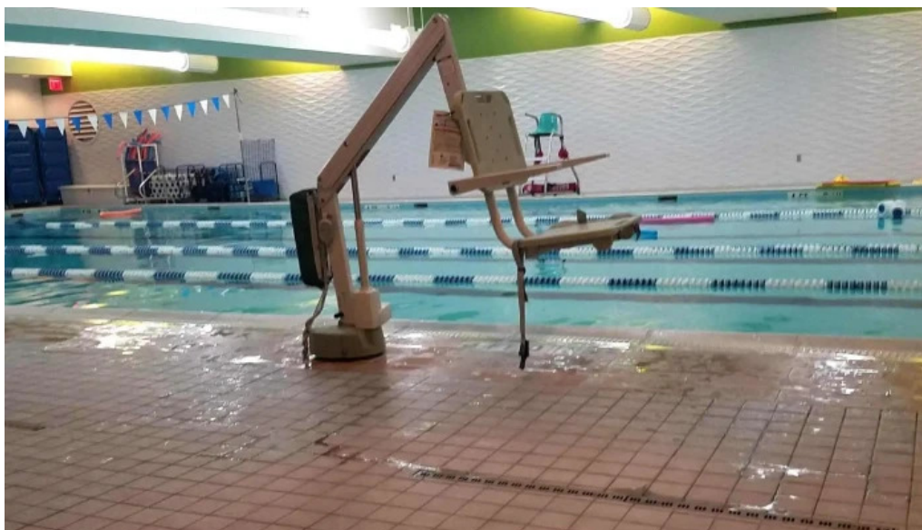
Anthony bowen branch ymca how to get there