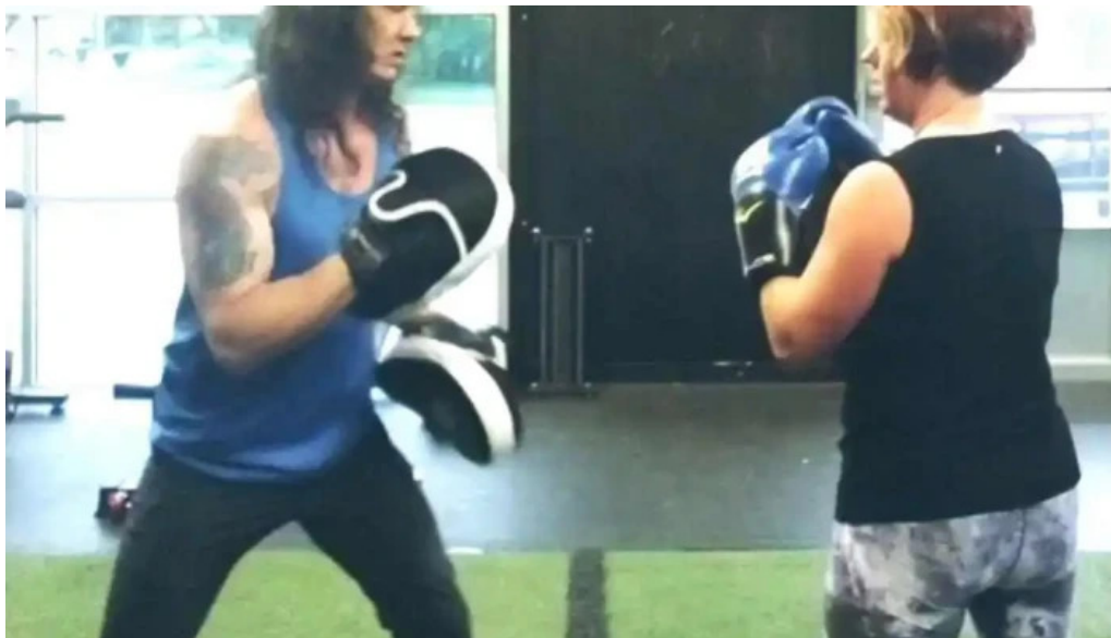
The fit body coach videos