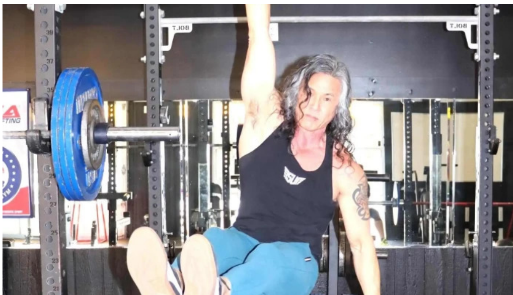
The fit body coach all