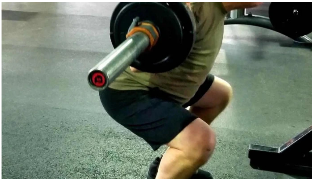
The fit body coach by owner