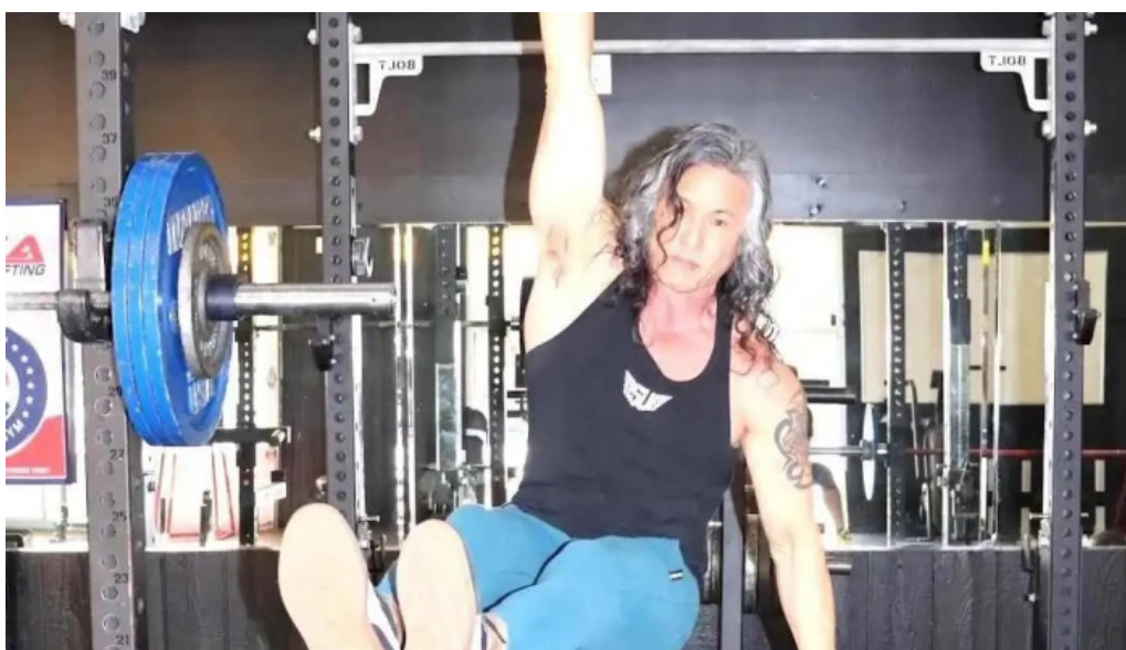
The fit body coach abilene