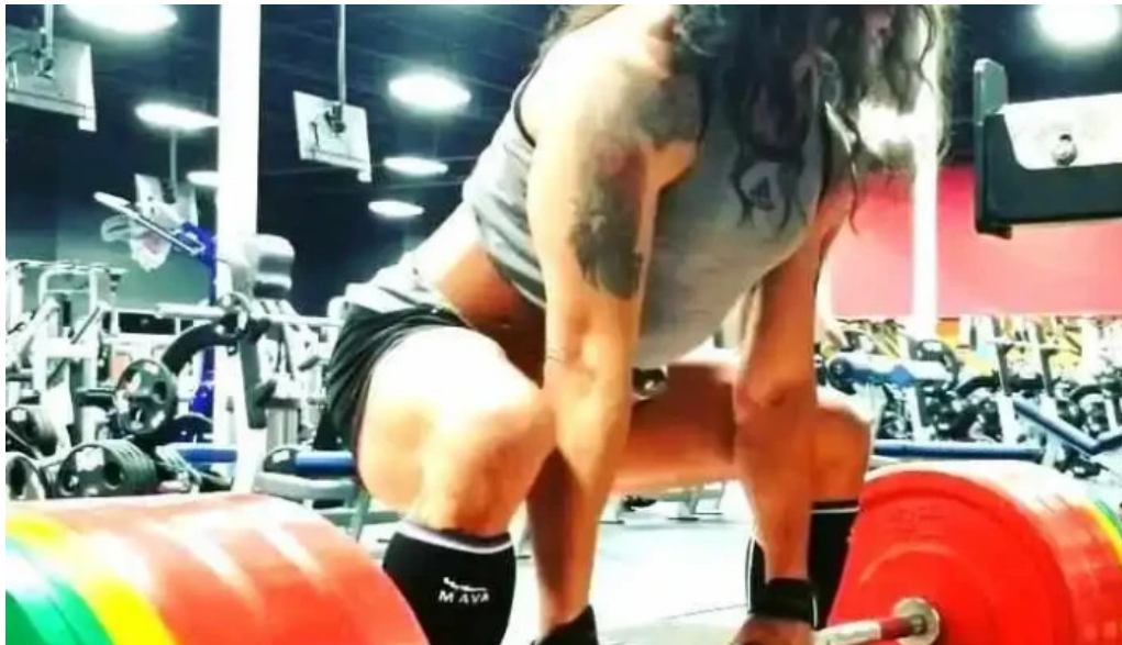
The fit body coach gym