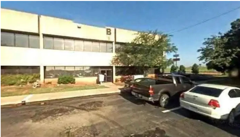
The fit body coach street view 360deg