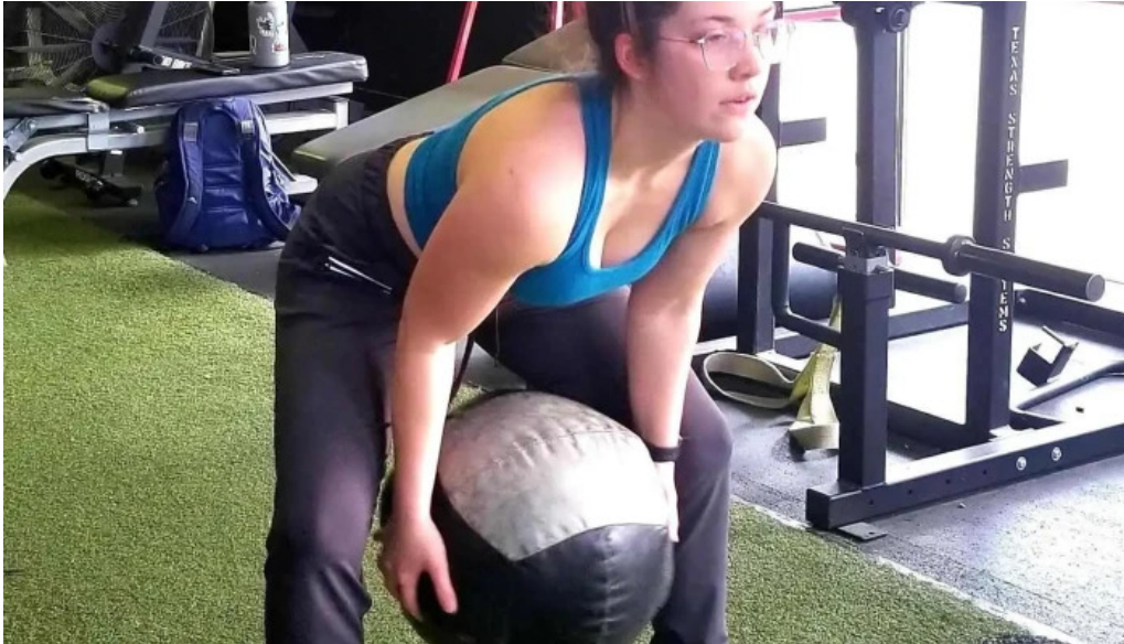
The fit body coach training