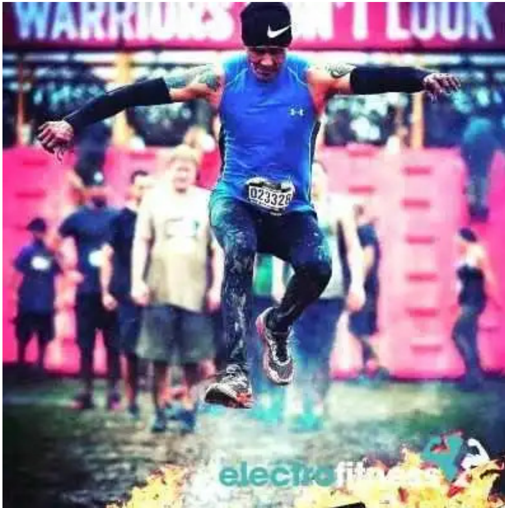
The fit body coach physical fitness