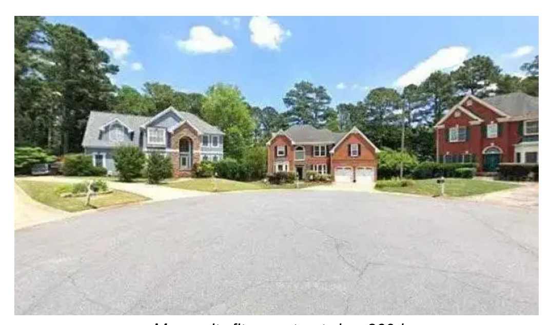
Maxgevity fitness street view 360deg