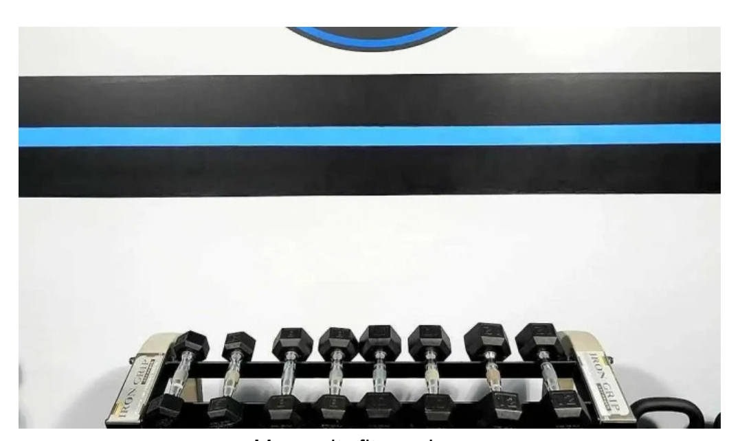
Maxgevity fitness by owner