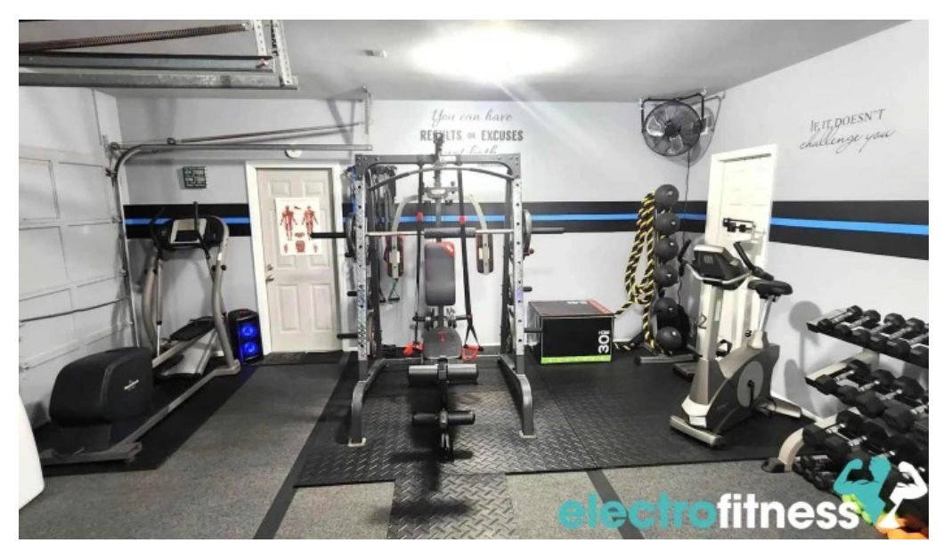
Maxgevity fitness all