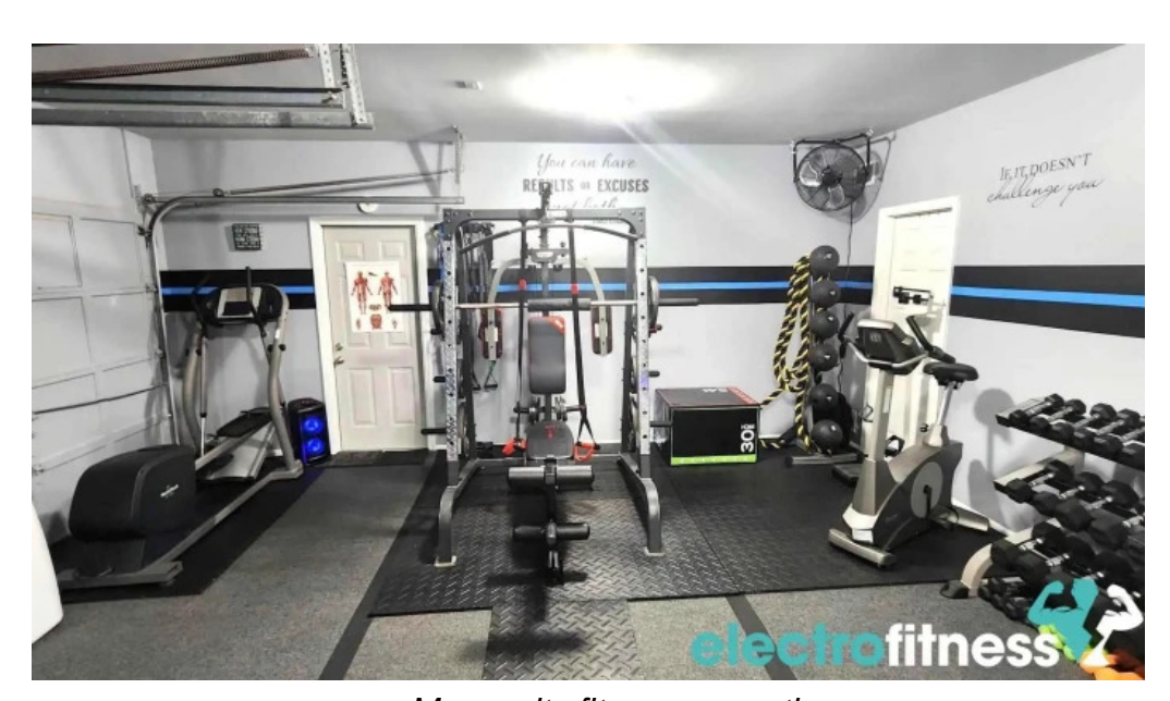
Maxgevity fitness acworth