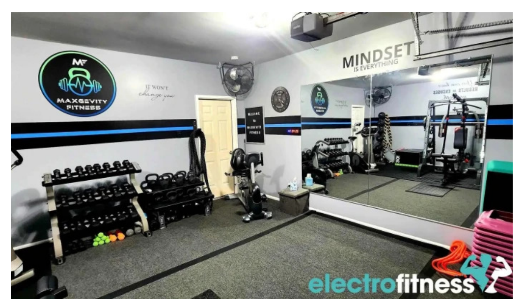
Maxgevity fitness gym