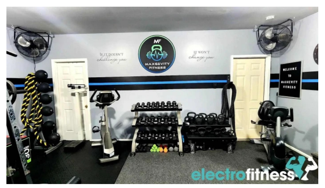
Maxgevity fitness physical fitness