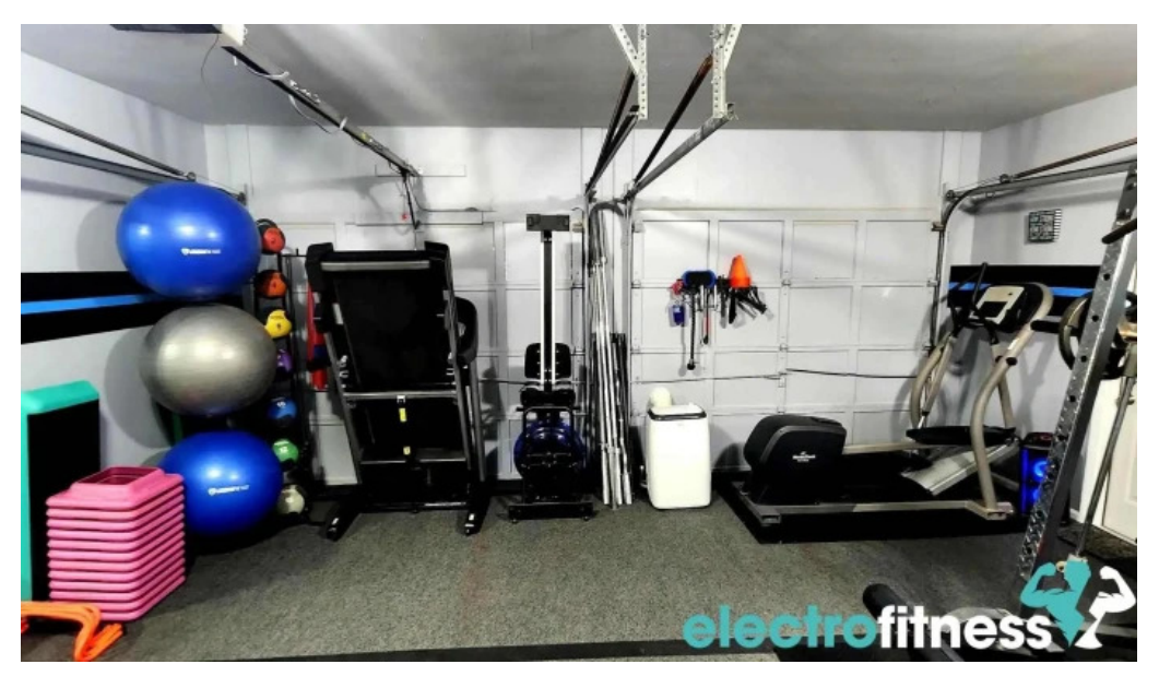
Maxgevity fitness training