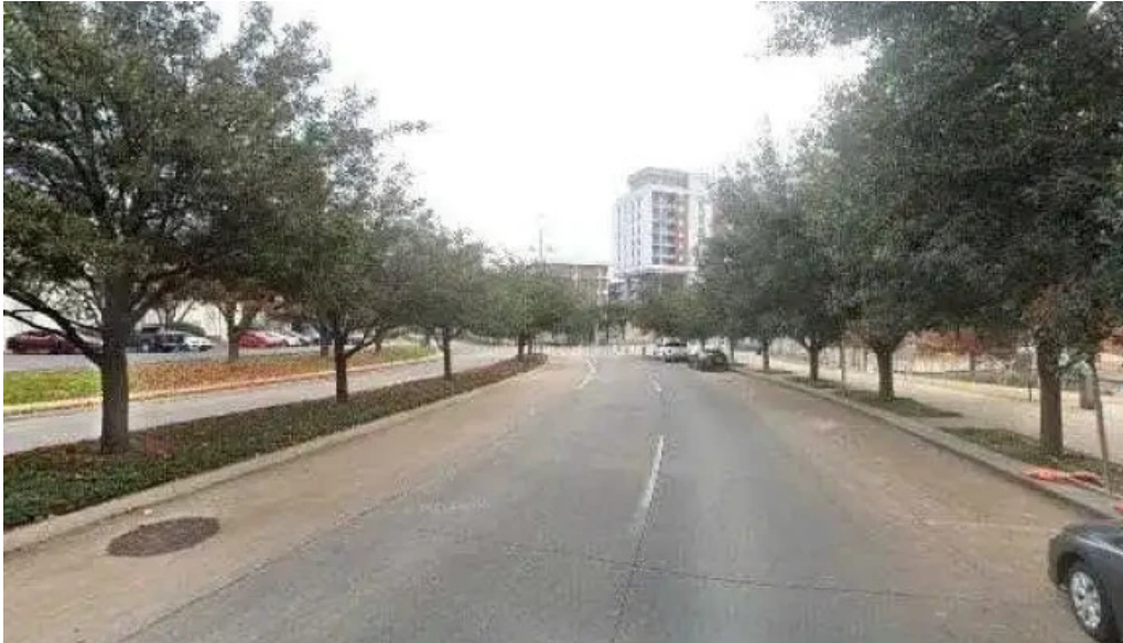
Triad fitness and wellness street view 360deg