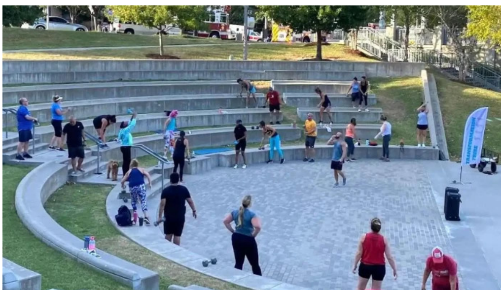
Triad fitness and wellness addison