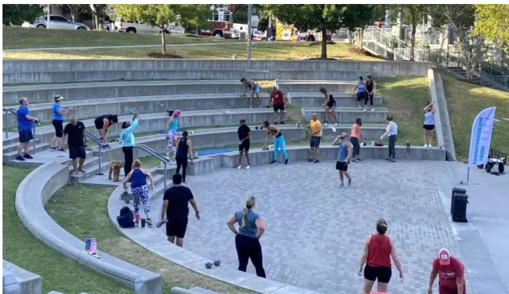
Triad fitness and wellness all