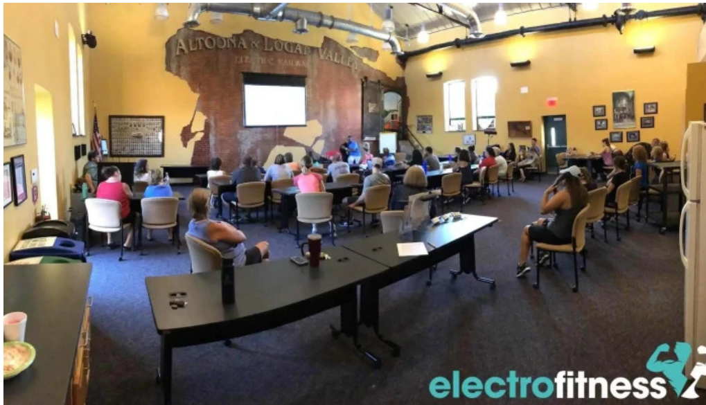
Revival fitness rehab by owner