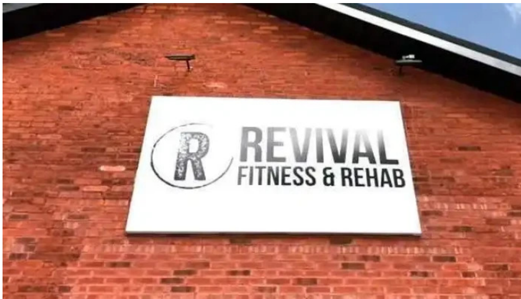
Revival fitness rehab altoona