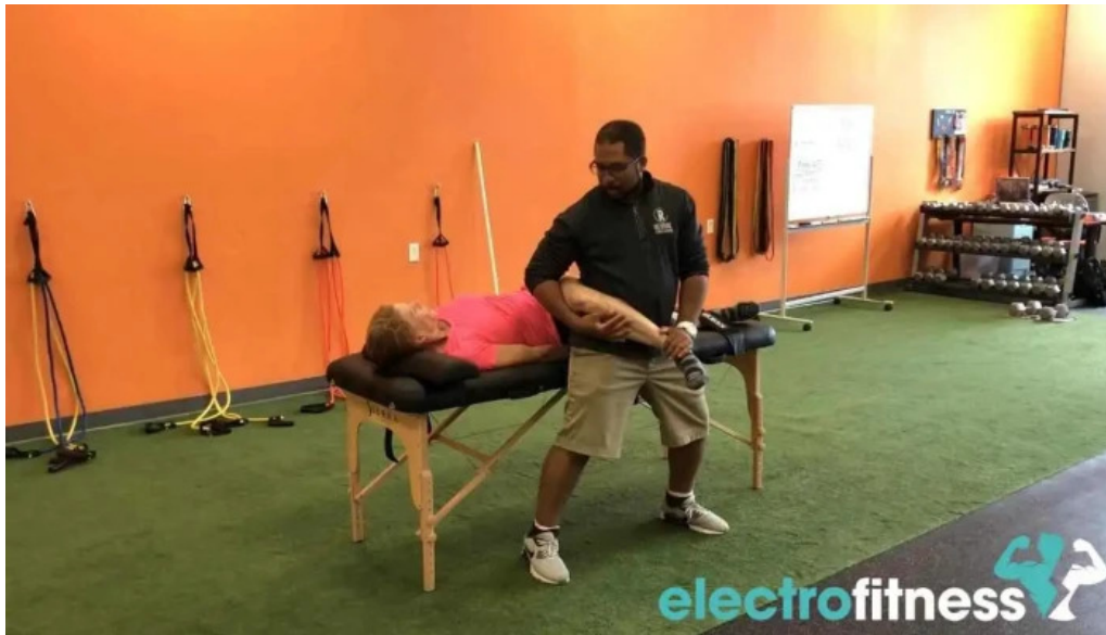
Revival fitness rehab training