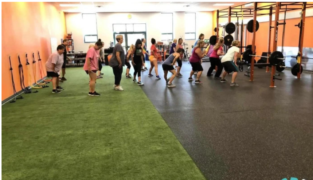
Revival fitness rehab physical fitness