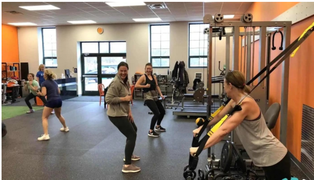
Revival fitness rehab gym