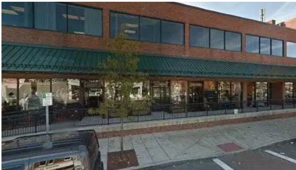
Training ground street view 360deg