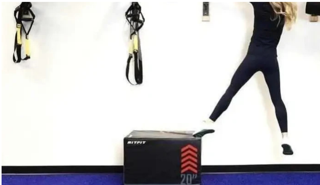
Training ground andover