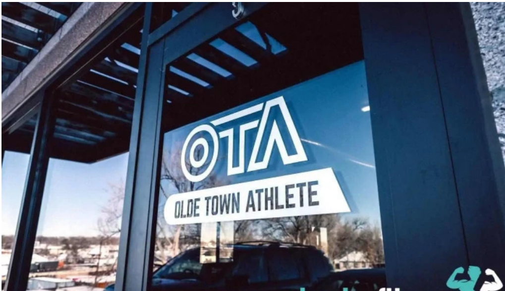
Olde town athlete arvada