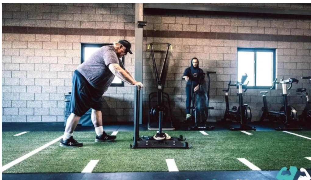
Olde town athlete gym