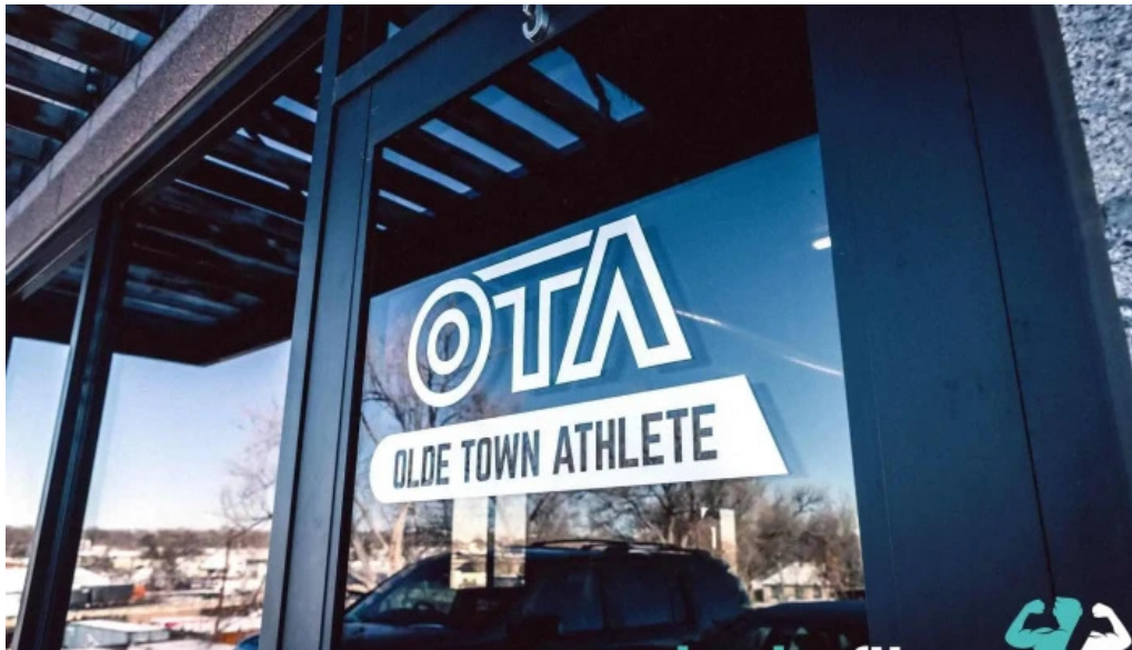
Olde town athlete all