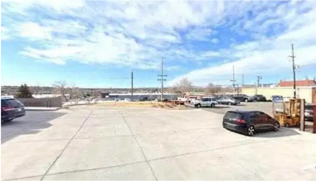
Olde town athlete street view 360deg