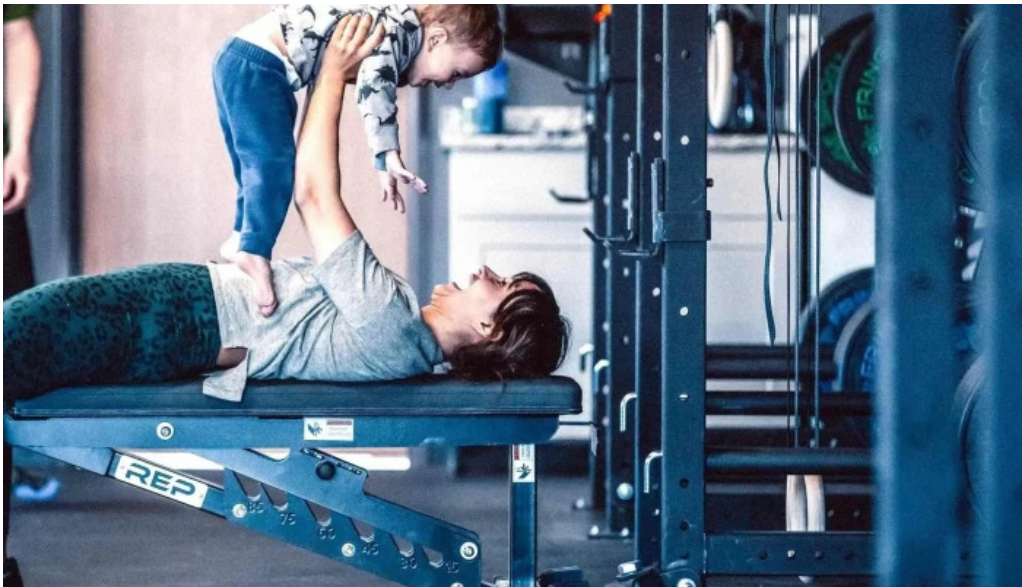
Olde town athlete personal trainer