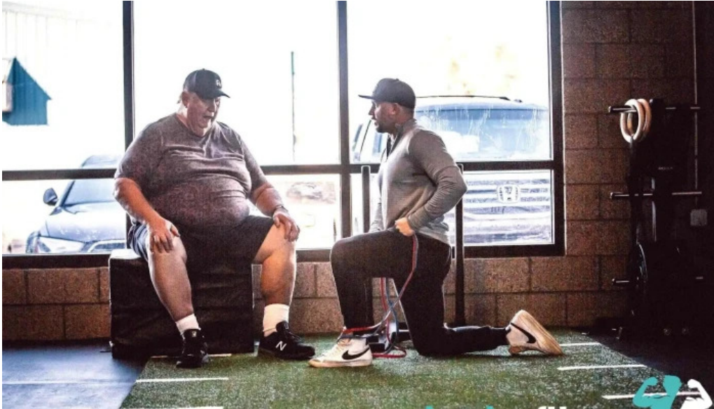
Olde town athlete by owner