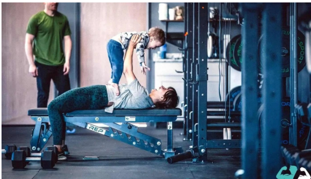
Olde town athlete training