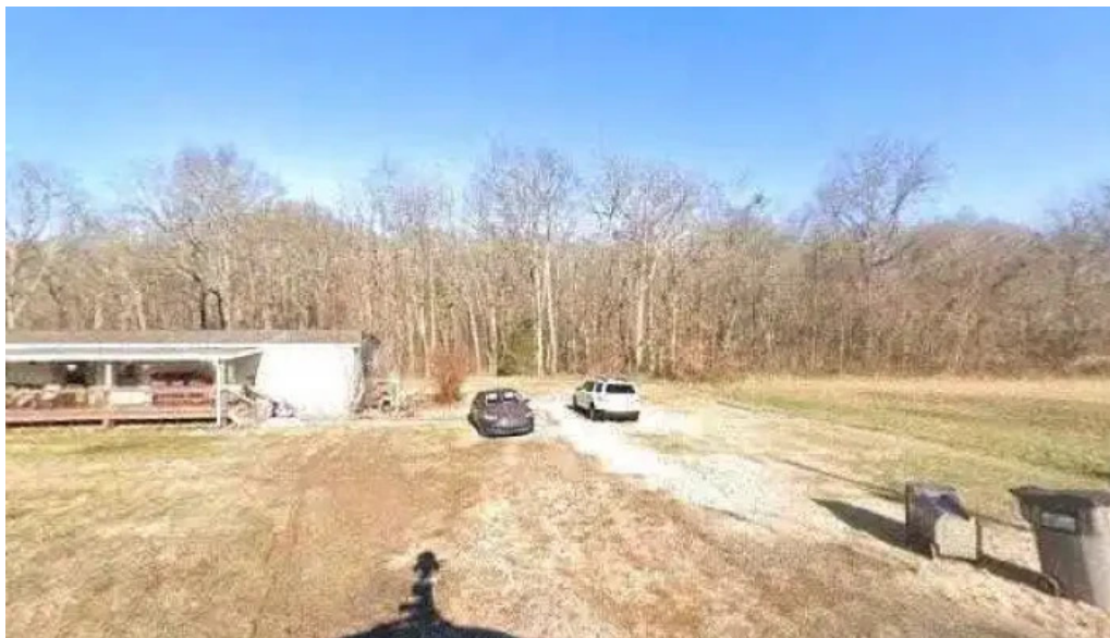
On the verge health and fitness coaching street view 360deg