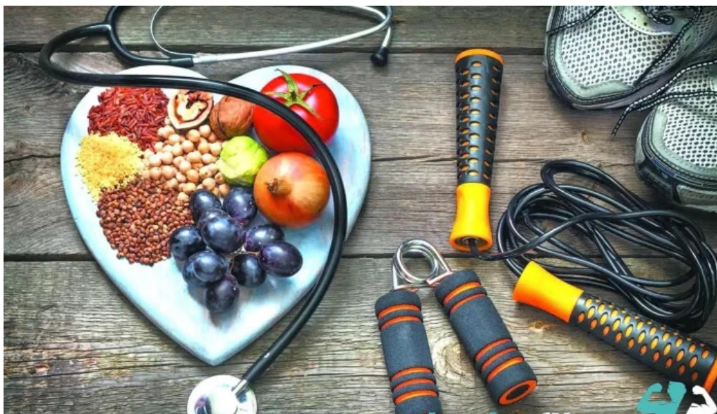
On the verge health and fitness coaching bethpage