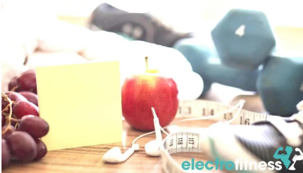
On the verge health and fitness coaching videos