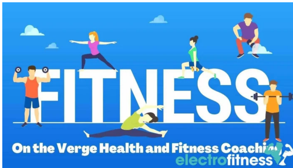
On the verge health and fitness coaching physical fitness