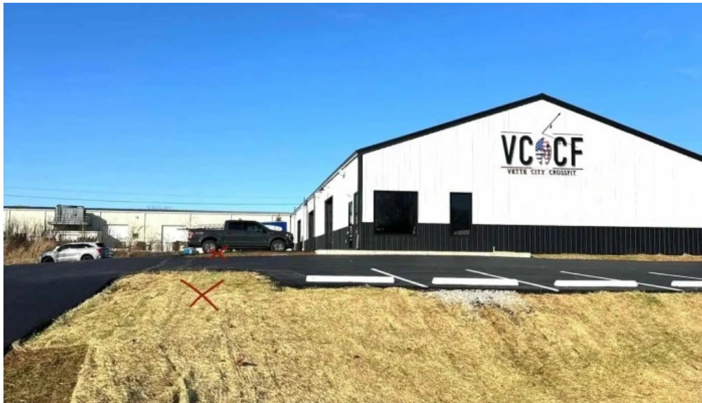
Vette city crossfit all