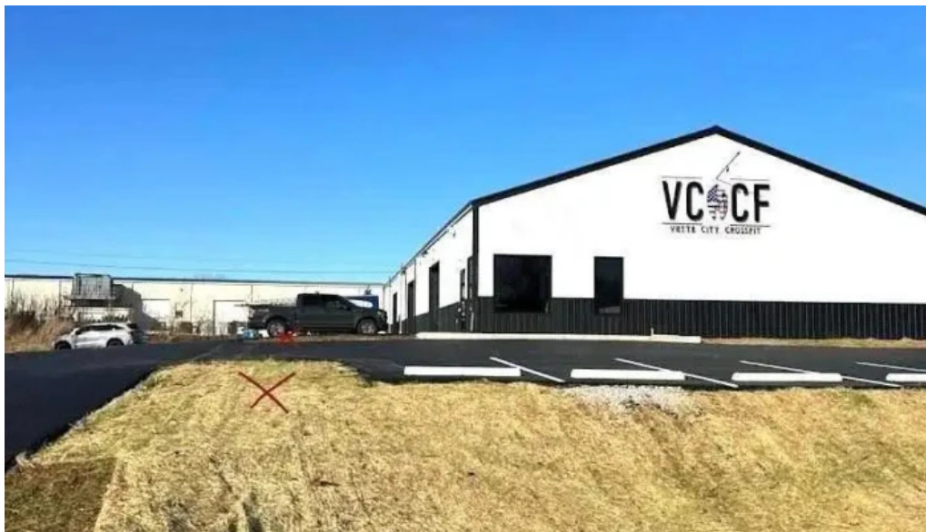
Vette city crossfit bowling green