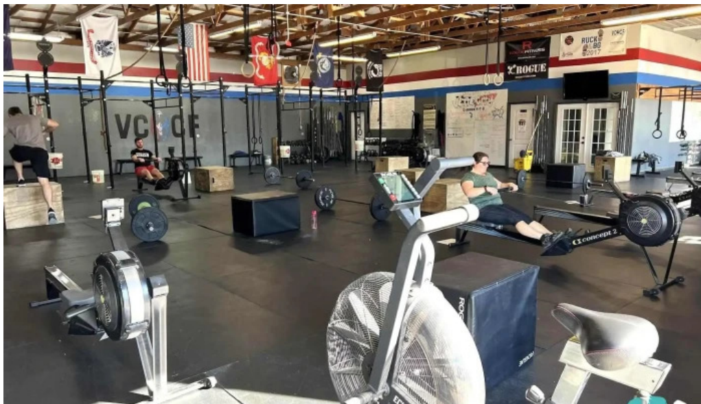
Vette city crossfit gym