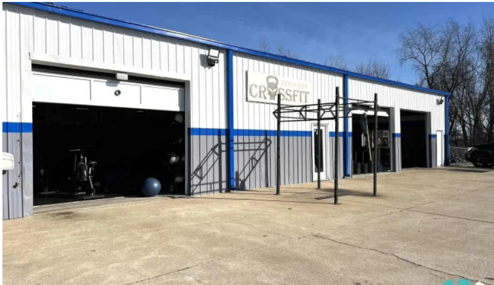
Vette city crossfit by owner