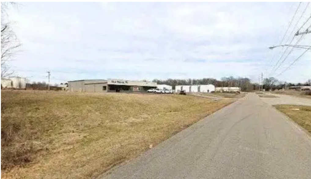
Vette city crossfit street view 360deg