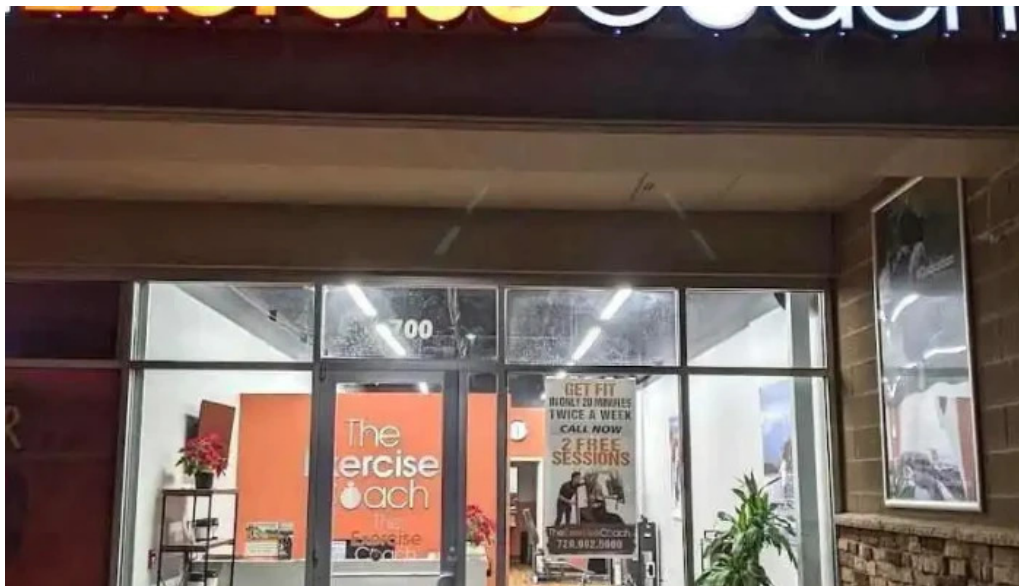
The exercise coach broomfield co broomfield