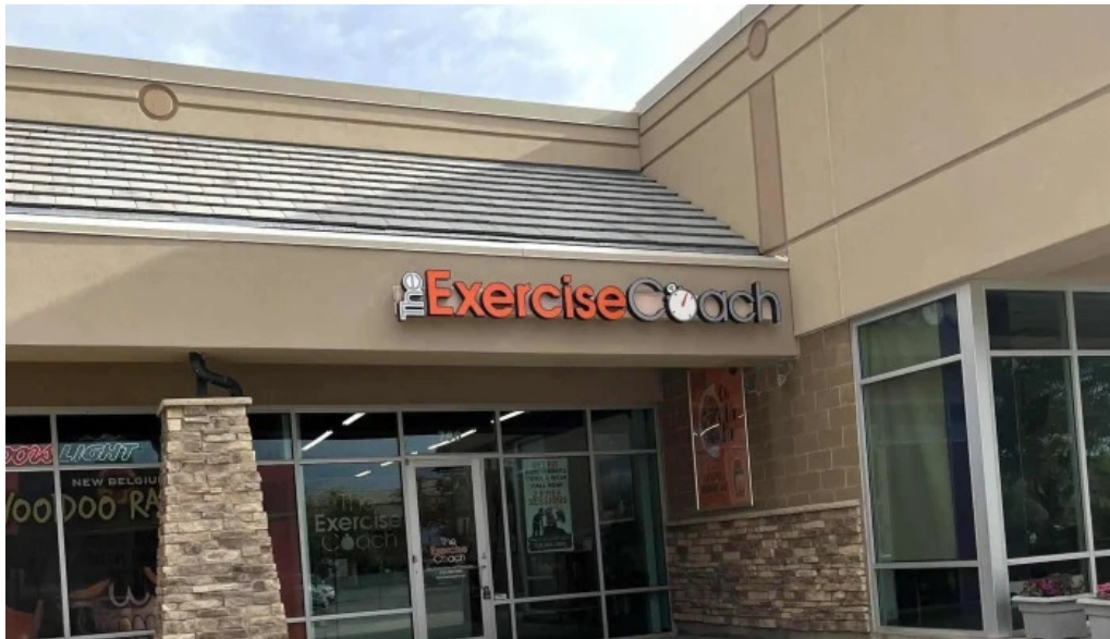
The exercise coach broomfield co personal trainer