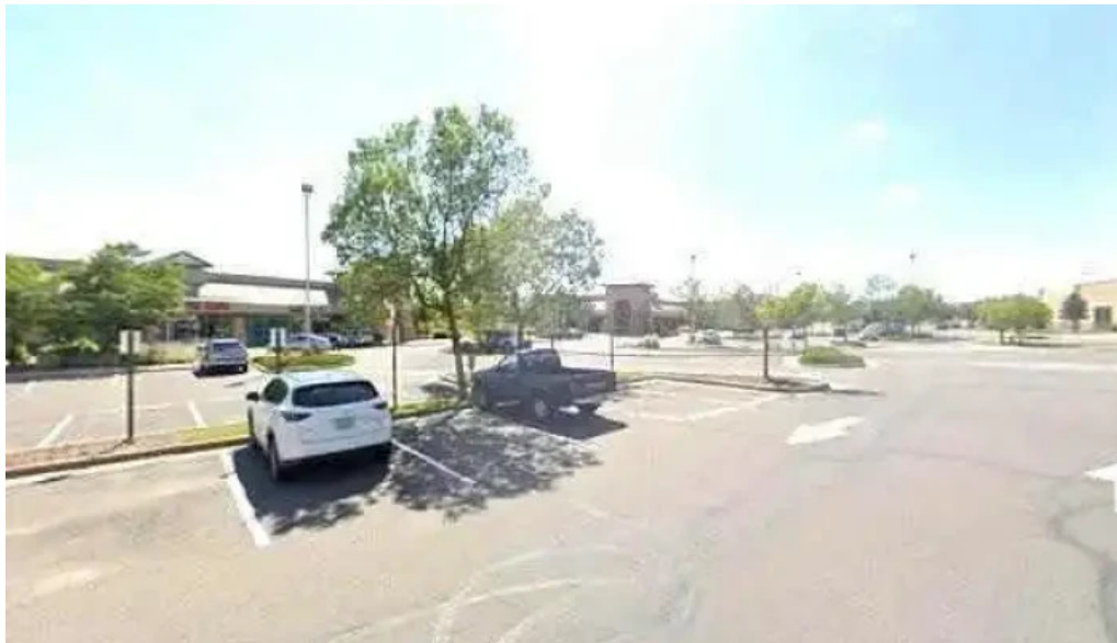
The exercise coach broomfield co street view 360deg