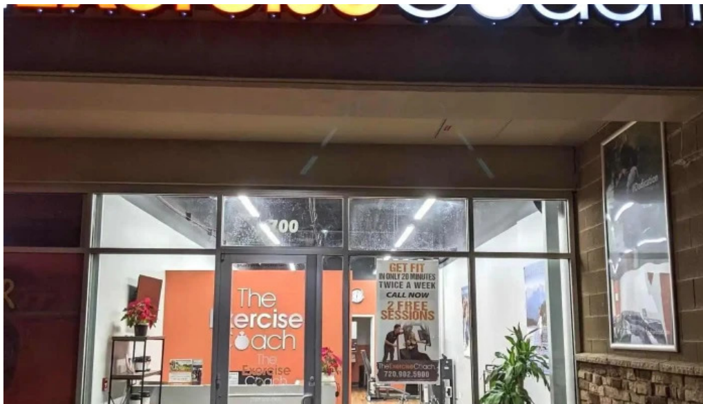
The exercise coach broomfield co all