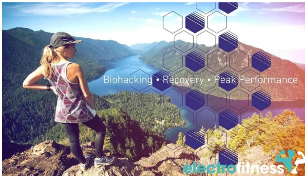
Future fit burlington