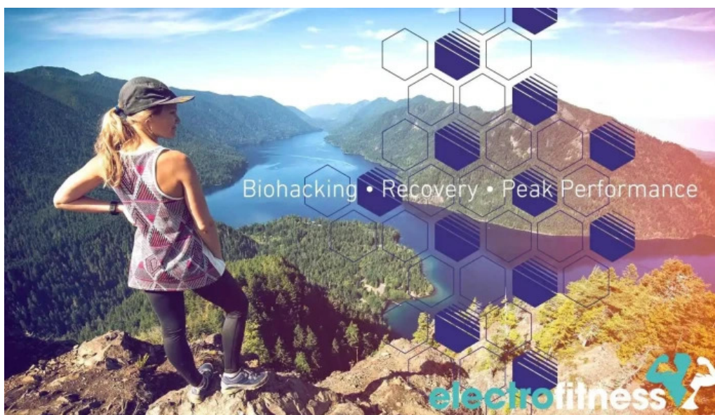
Future fit all