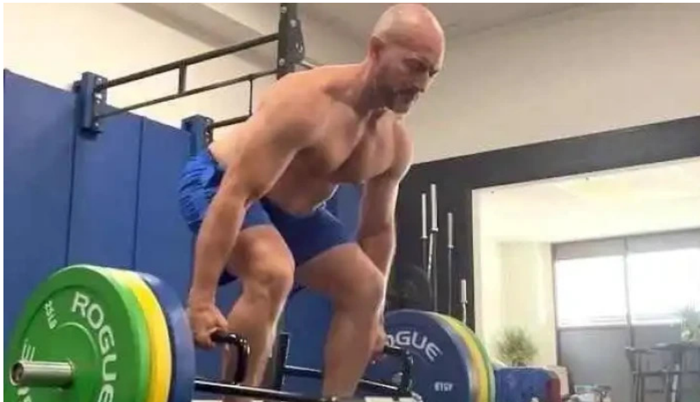
Feel better training creston