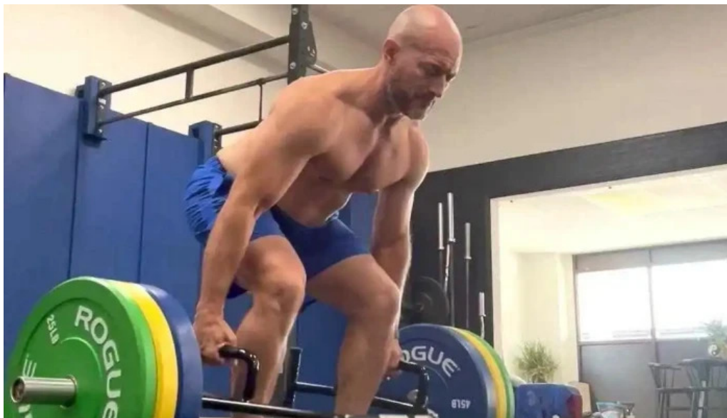
Feel better training all