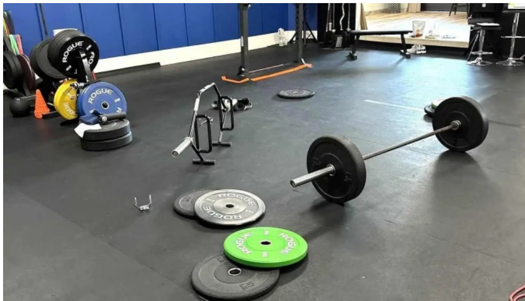
Feel better training training