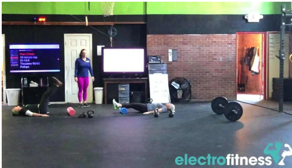
Feel better training videos