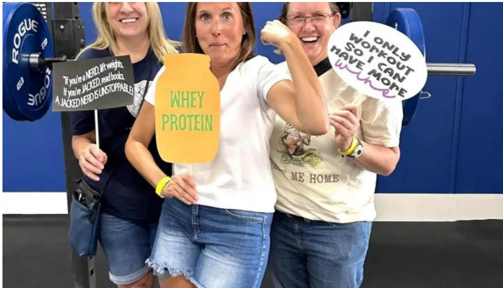
Feel better training by owner