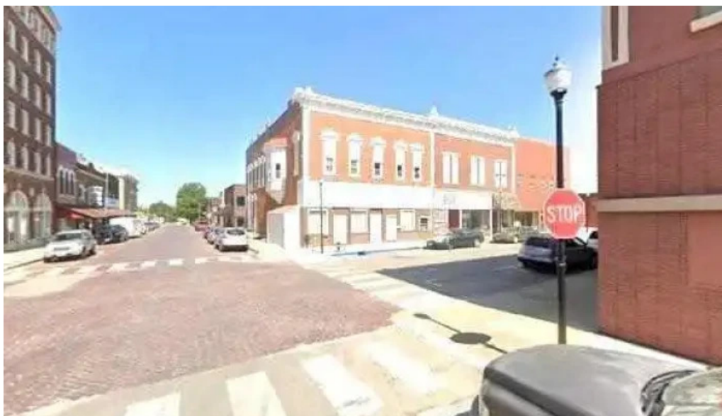
Feel better training street view 360deg