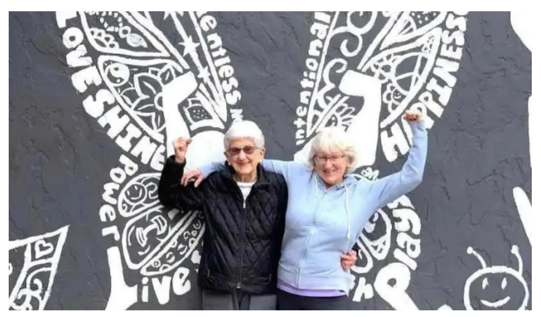
The worxout fort wayne