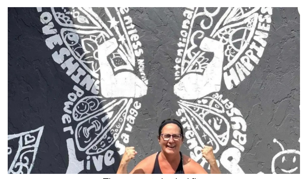
The worxout physical fitness