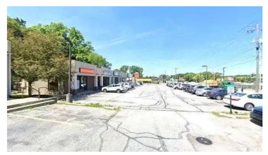
The worxout street view 360deg