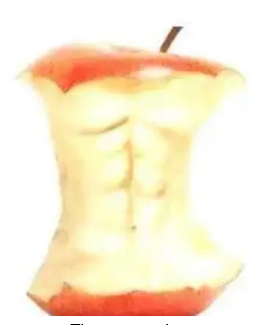
The worxout by owner