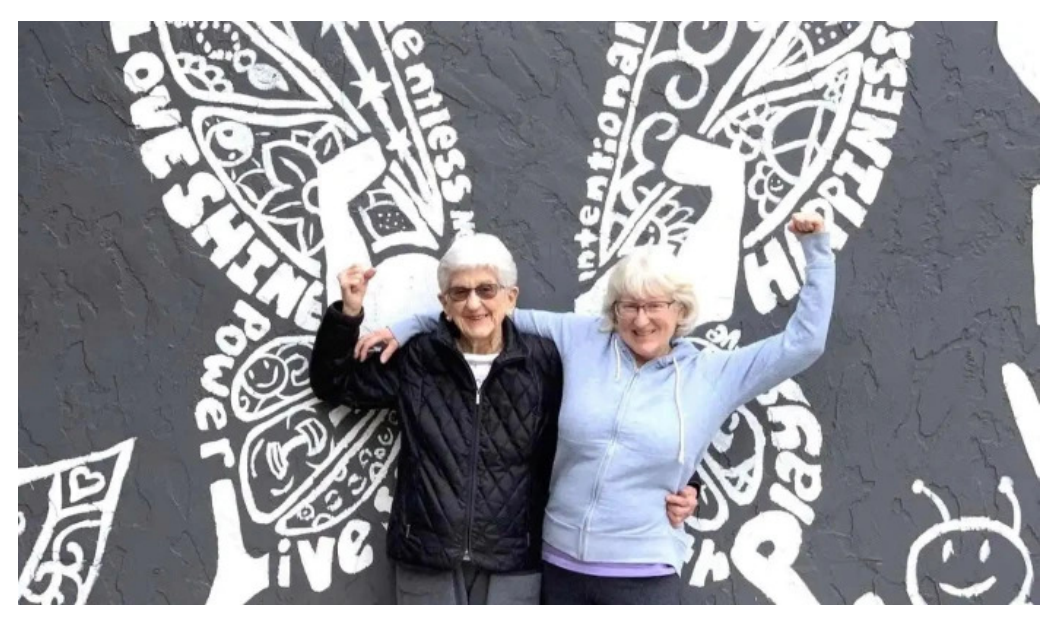
The worxout all