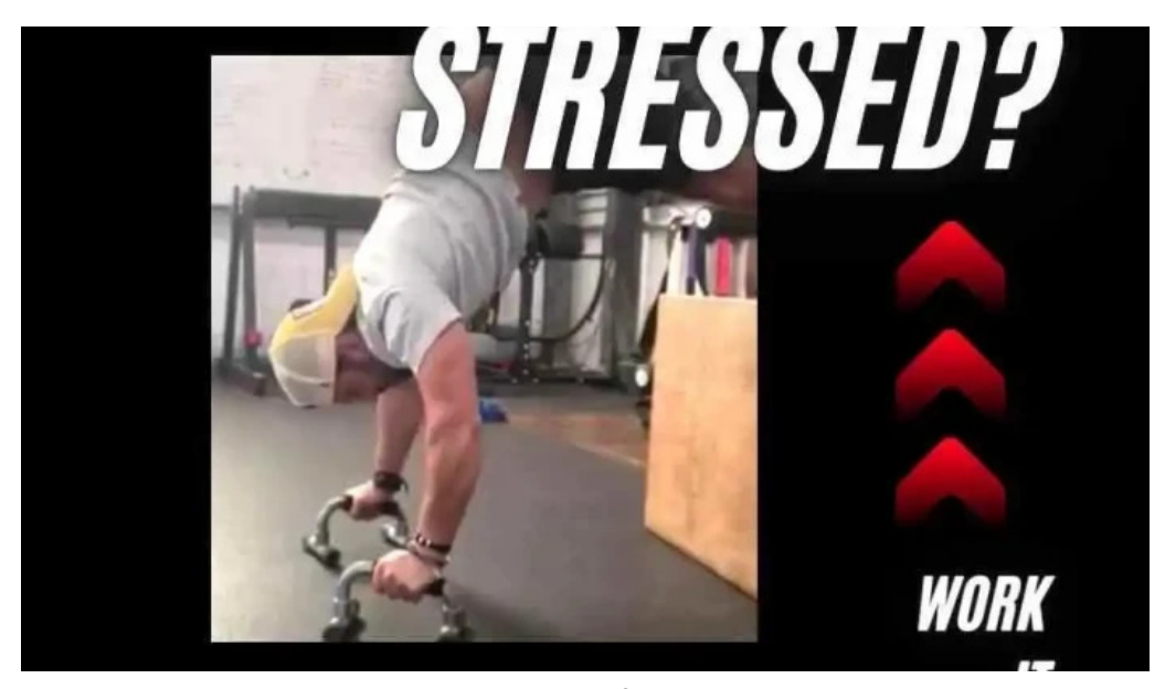
Four horsman fitness videos