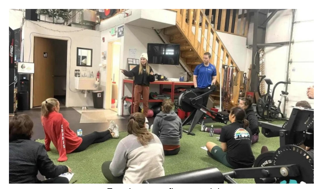
Four horsman fitness training