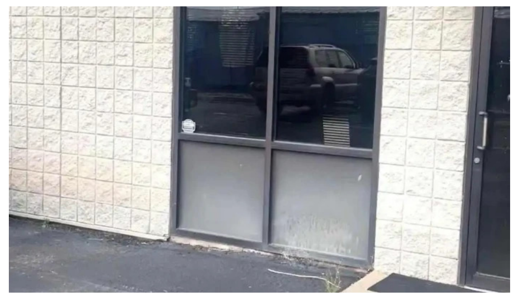
Four horsman fitness by owner