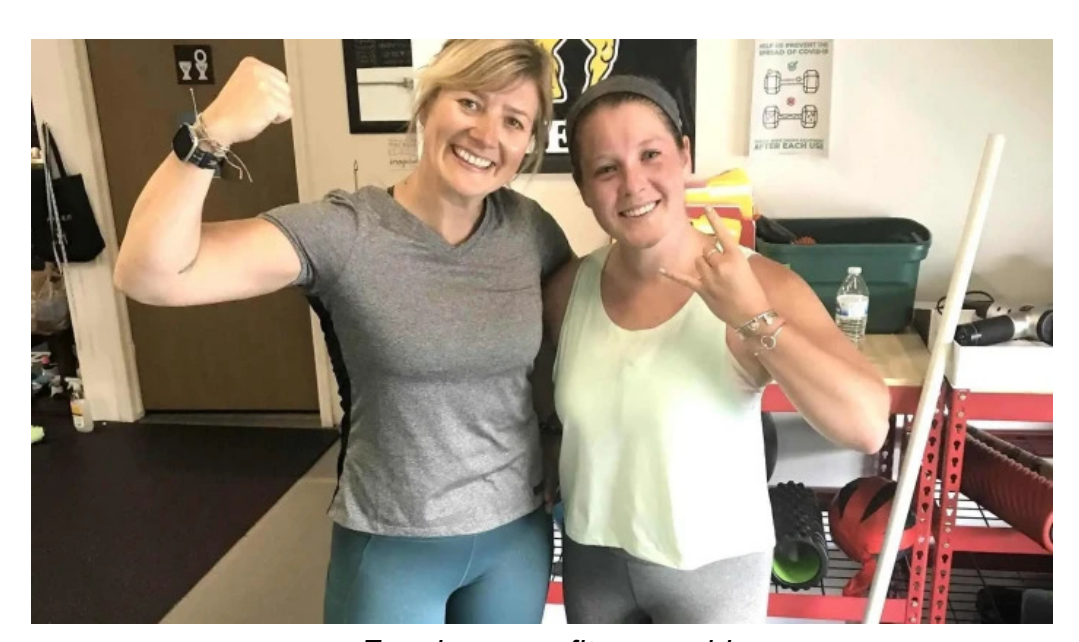
Four horsman fitness golden