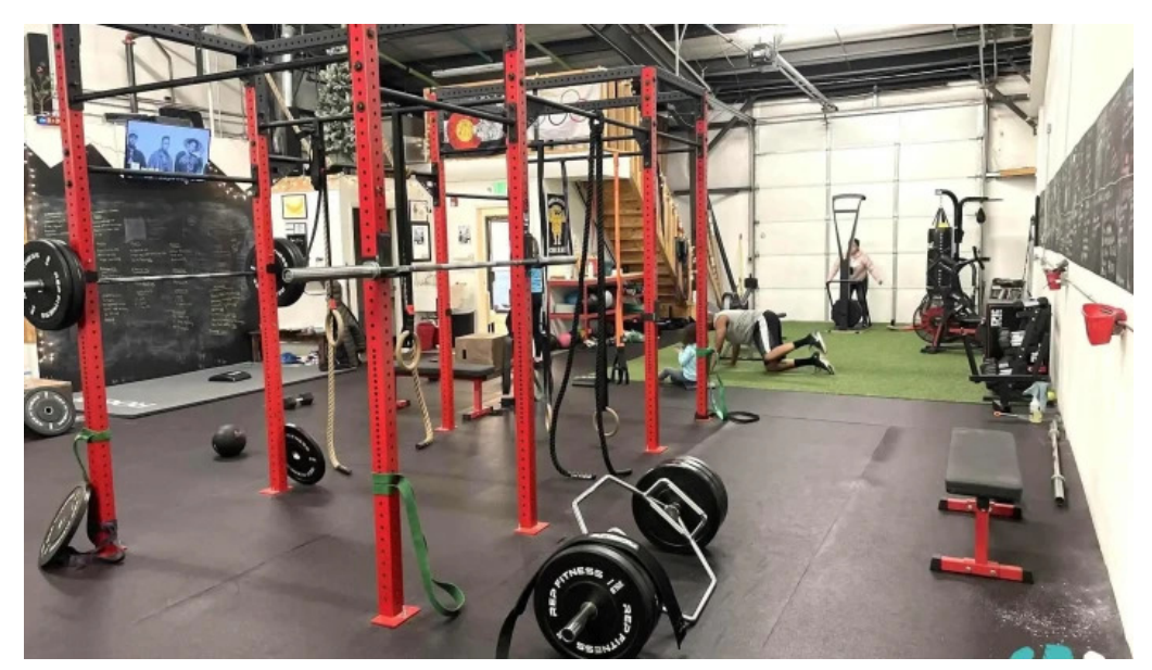
Four horsman fitness all