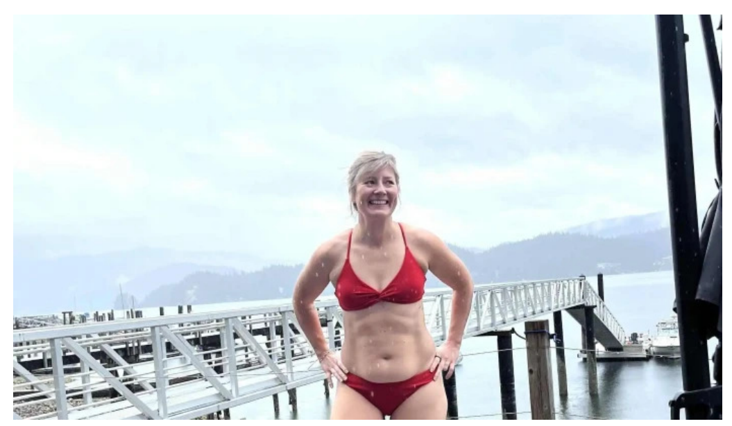
Four horsman fitness personal trainer