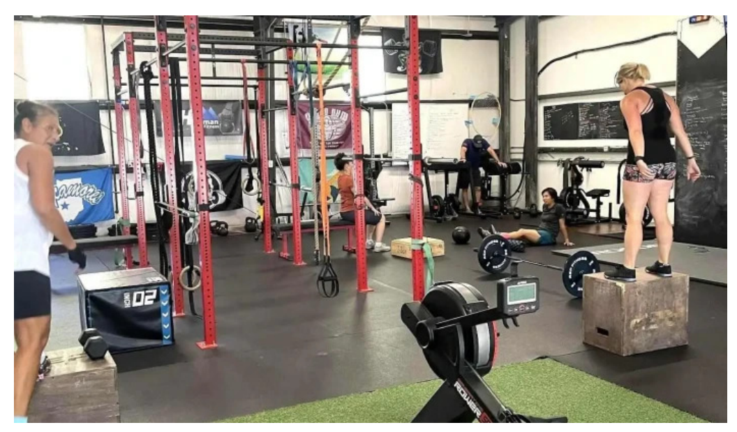
Four horsman fitness physical fitness