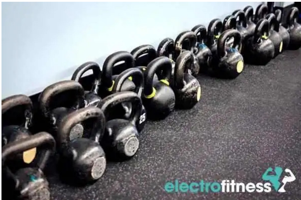
Ascension fitness training by owner