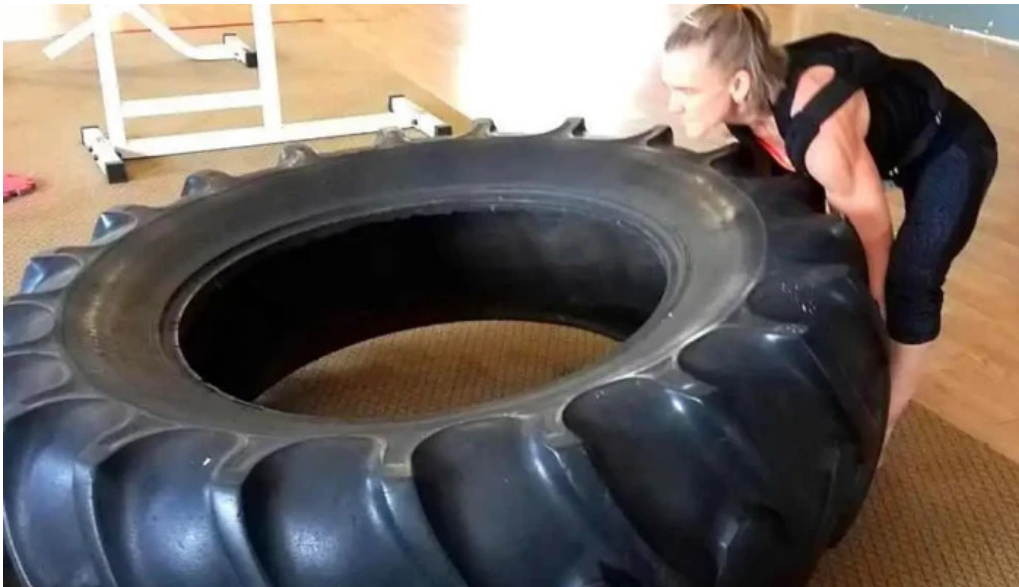
Ascension fitness training physical fitness