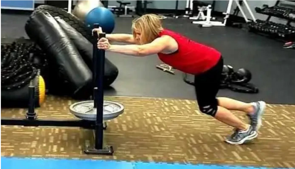
Ascension fitness training training