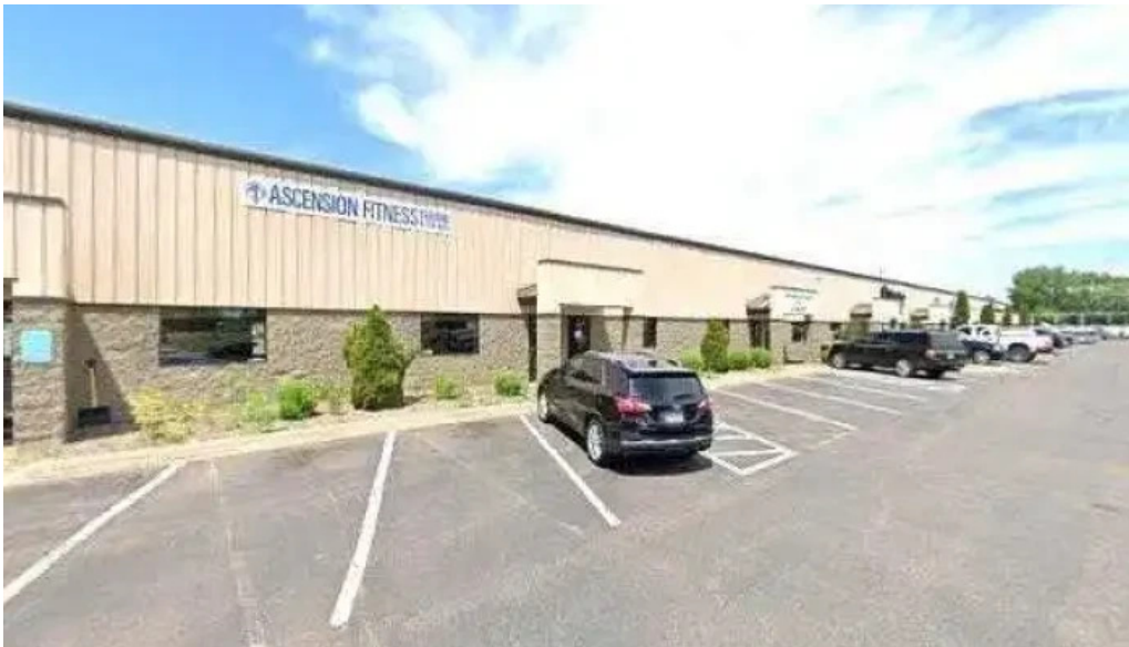
Ascension fitness training street view 360deg