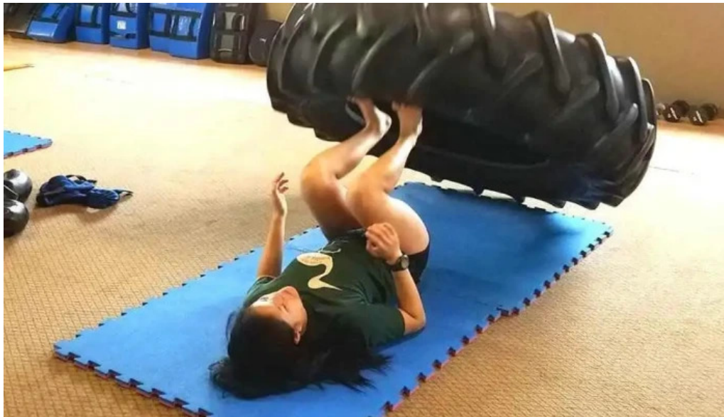
Ascension fitness training ham lake