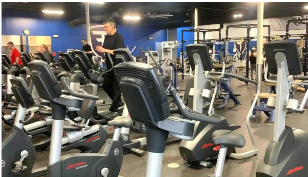
Performance fitness training hanover training