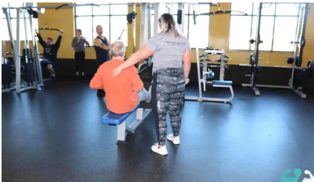
Performance fitness training hanover all