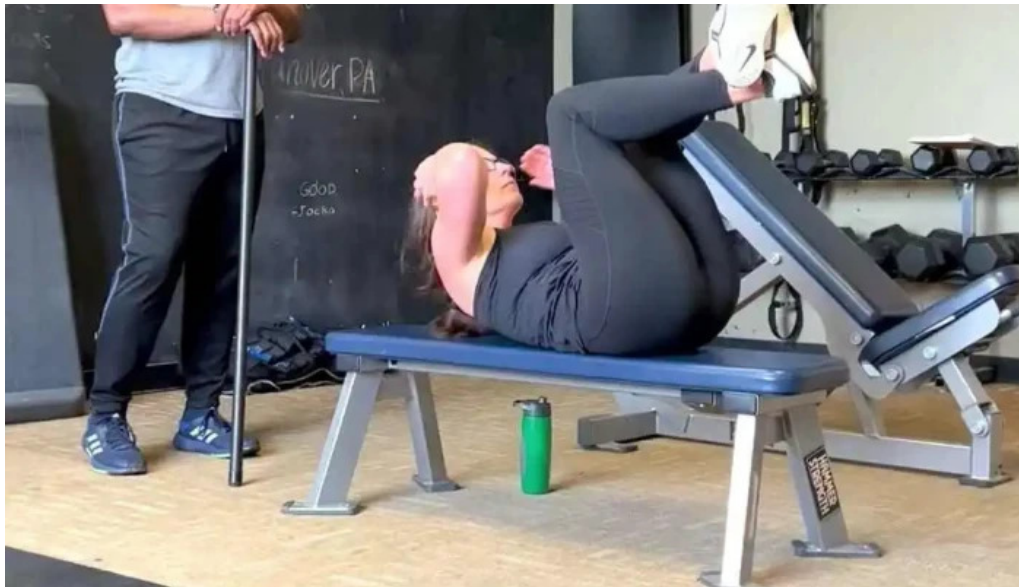
Performance fitness training hanover physical fitness