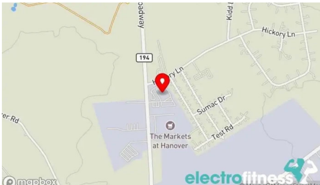
Performance fitness training hanover map