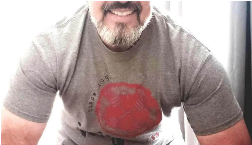
Aka fitness personal trainer