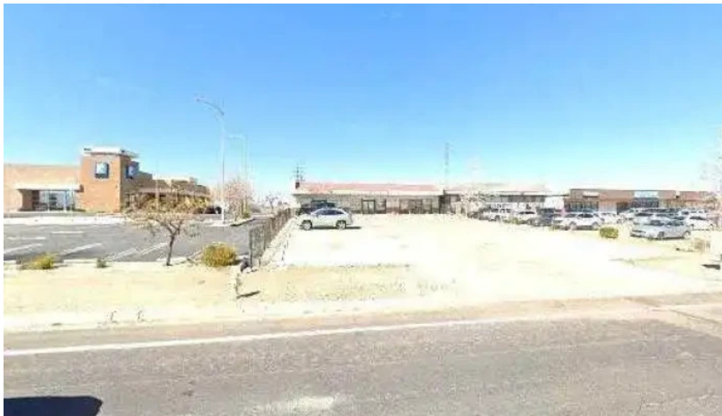
Aka fitness street view 360deg