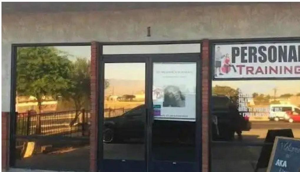
A k a fitness hesperia