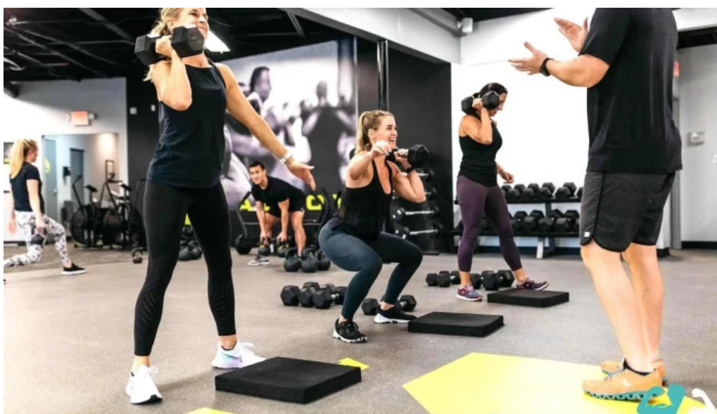
Alloy personal training highland all