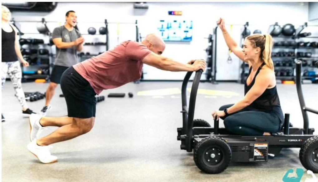
Alloy personal training highland training