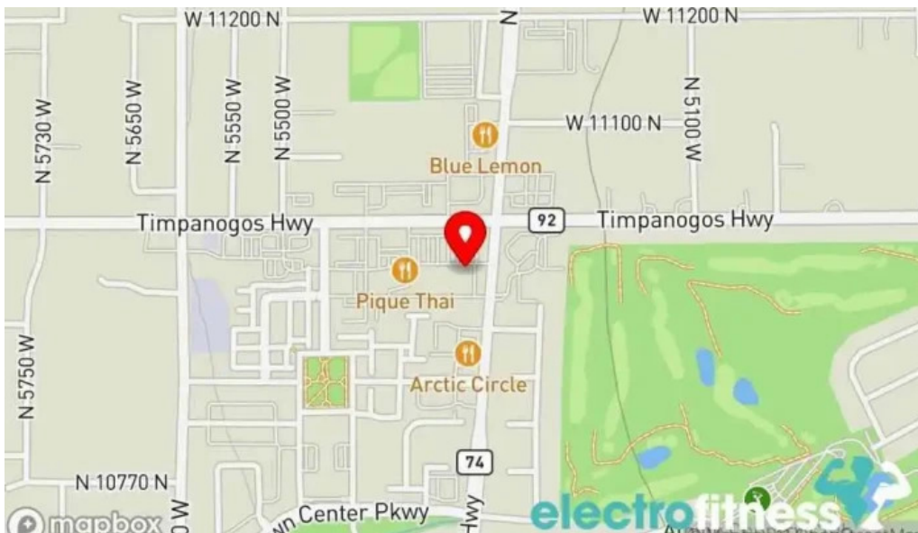
Alloy personal training highland map