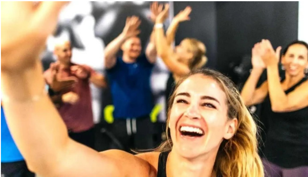
Alloy personal training highland physical fitness