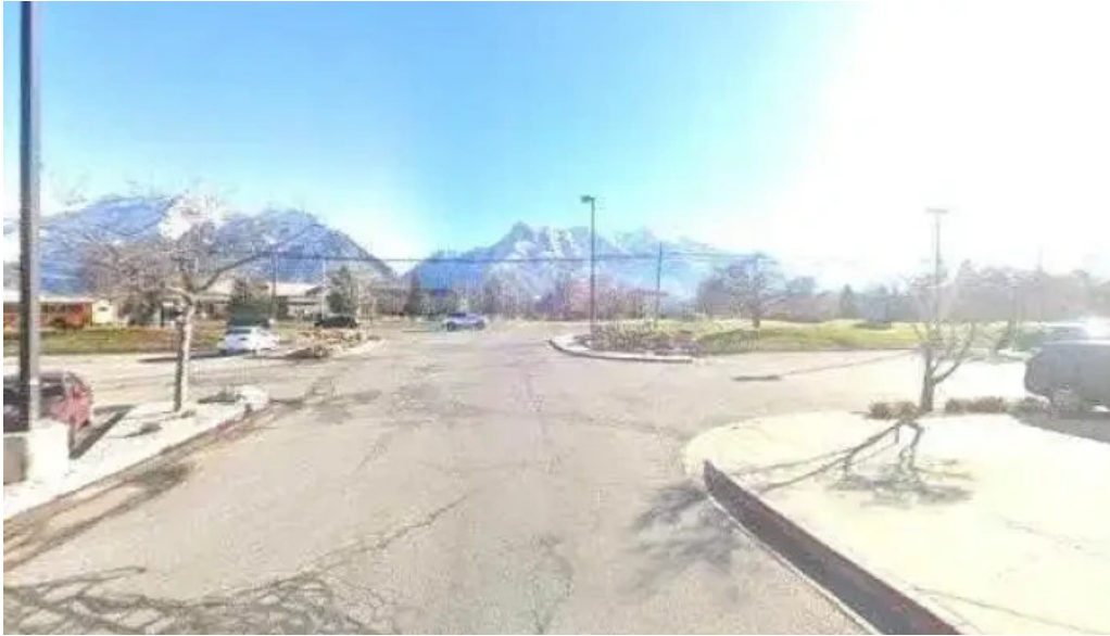
Alloy personal training highland street view 360deg