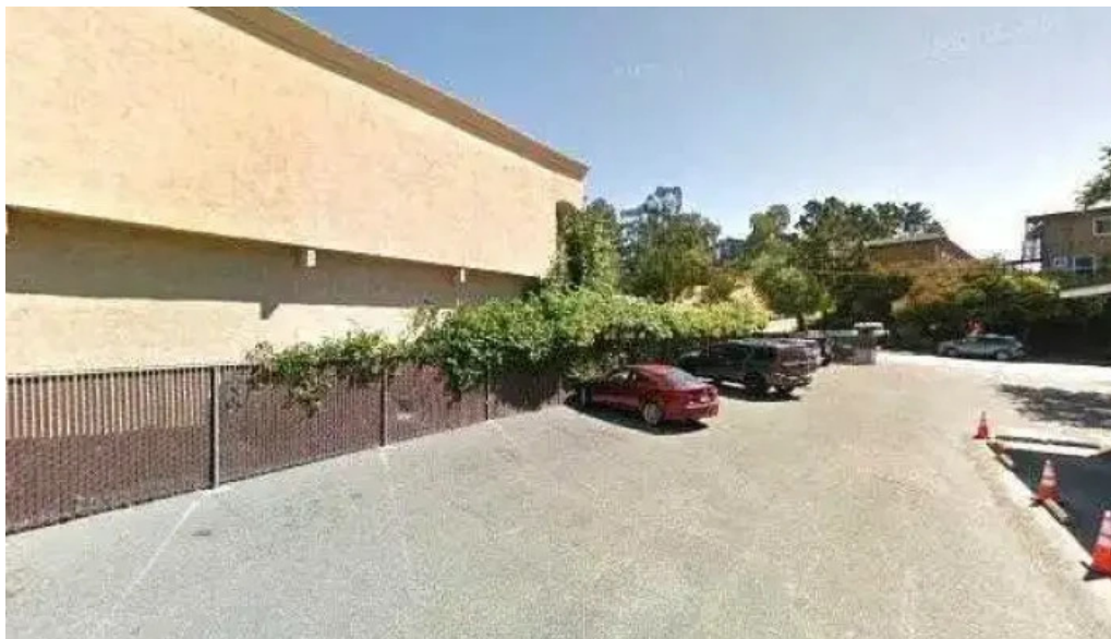
Willpower fitness all