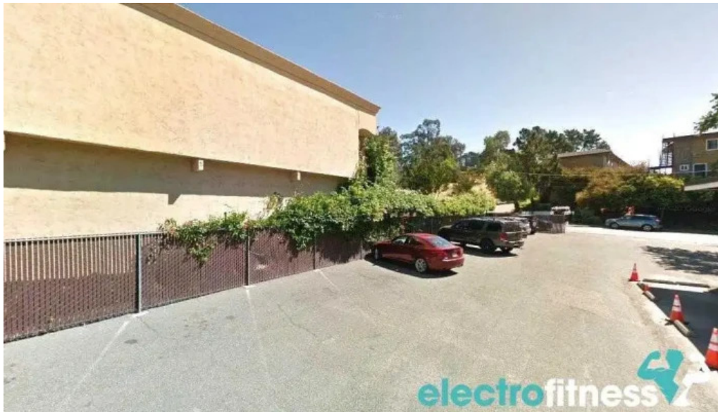
Willpower fitness lafayette