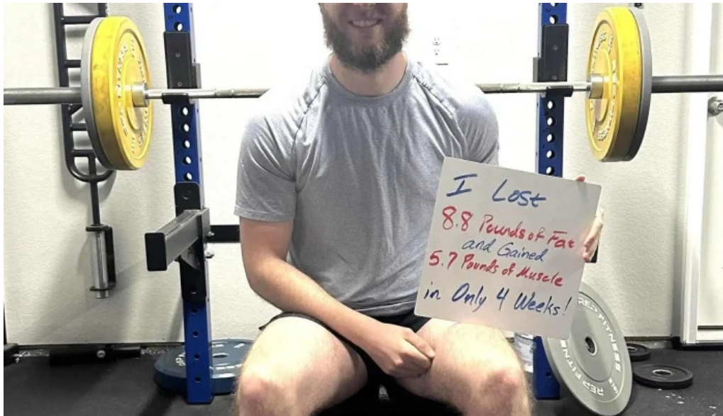
Fitness legacy coaching and personal training physical fitness