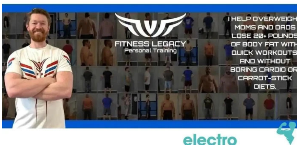
Fitness legacy coaching and personal training all