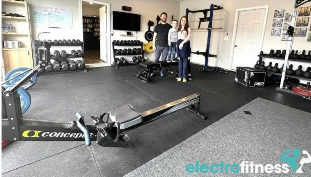
Fitness legacy coaching and personal training training