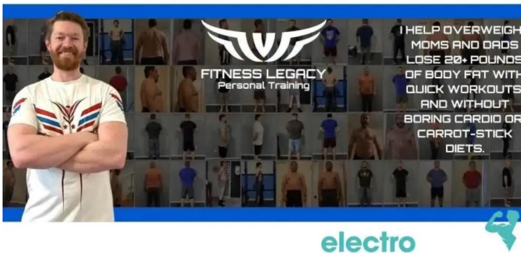
Fitness legacy coaching and personal training oak ridge