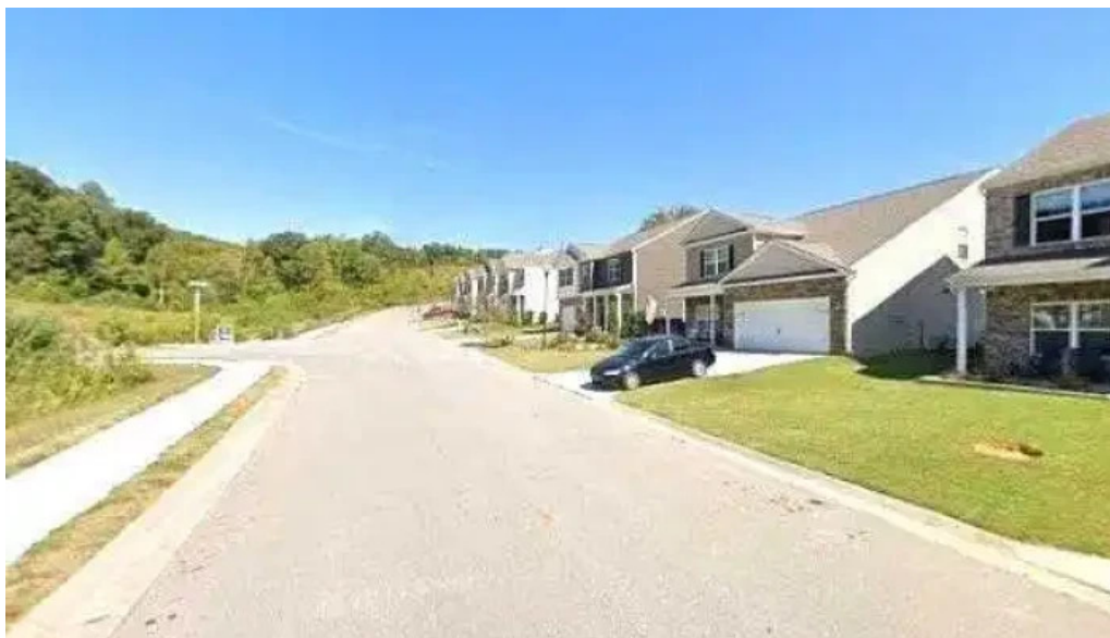
Fitness legacy coaching and personal training street view 360deg