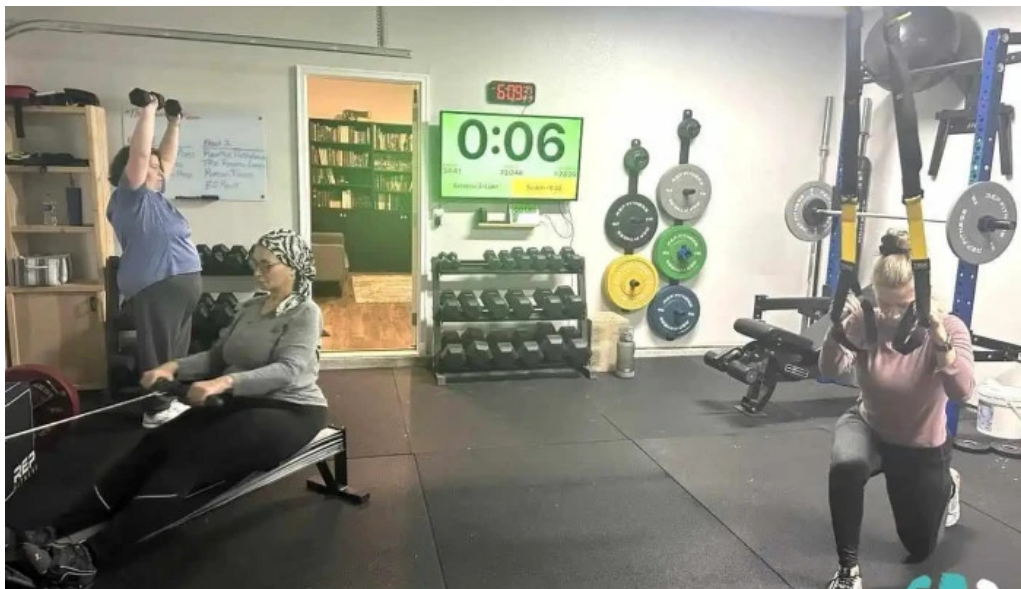
Fitness legacy coaching and personal training gym