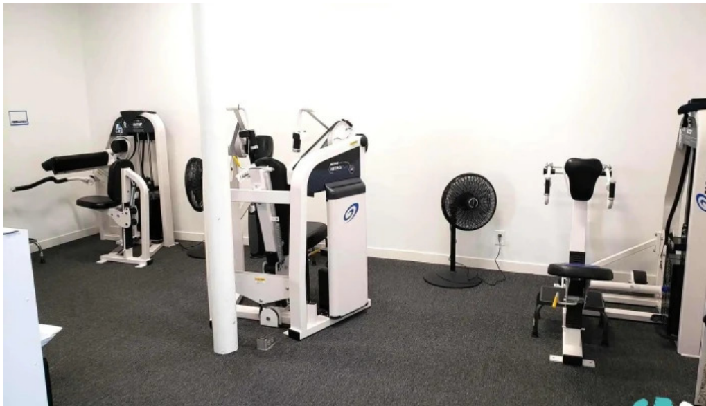
The perfect workout physical fitness