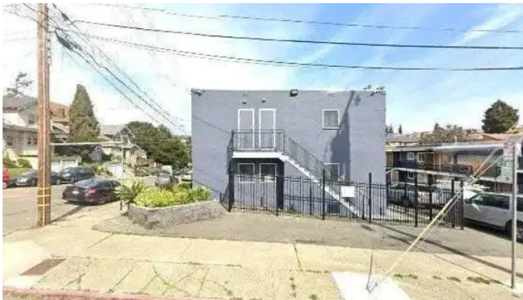
The perfect workout street view 360deg