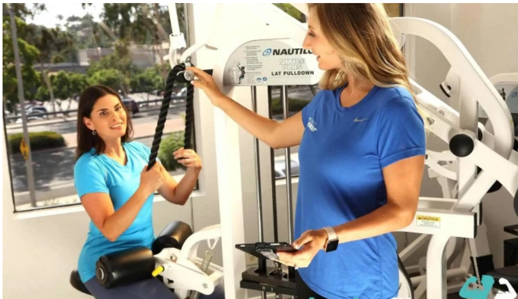
The perfect workout by owner