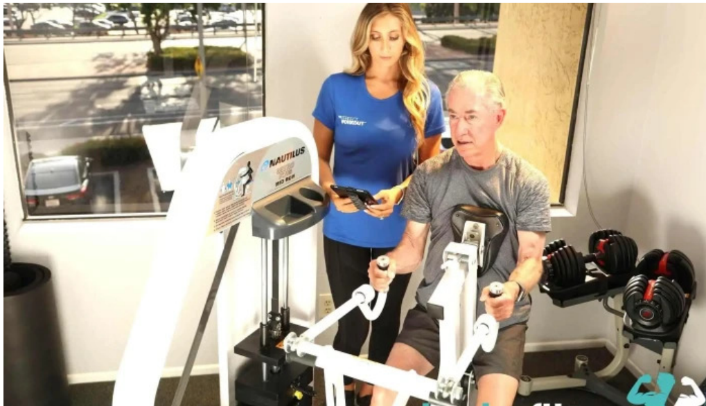
The perfect workout training