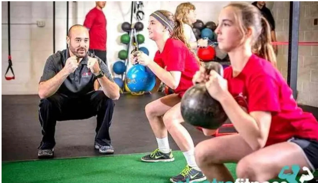
Krave fitness gym