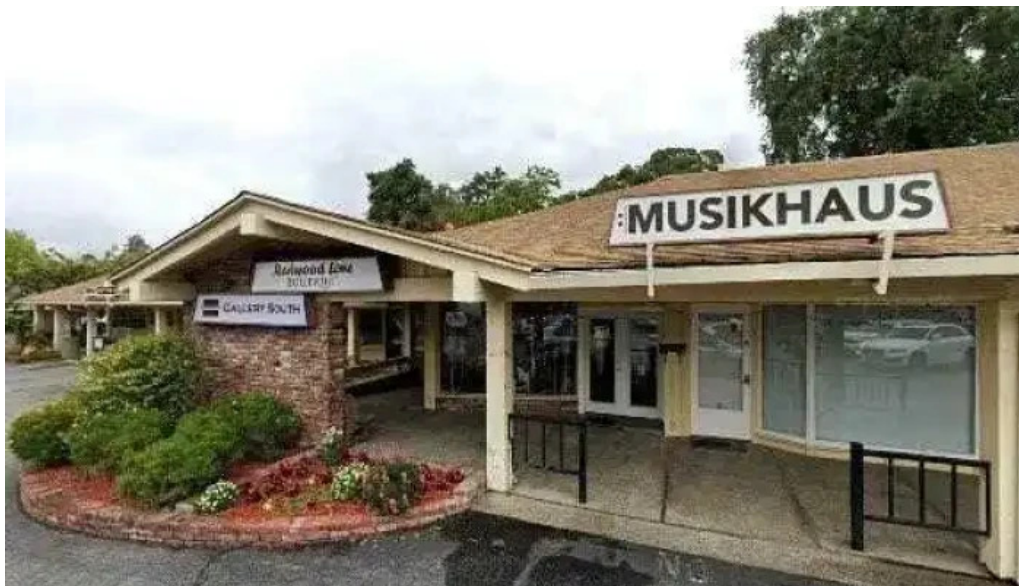
Krave fitness street view 360deg