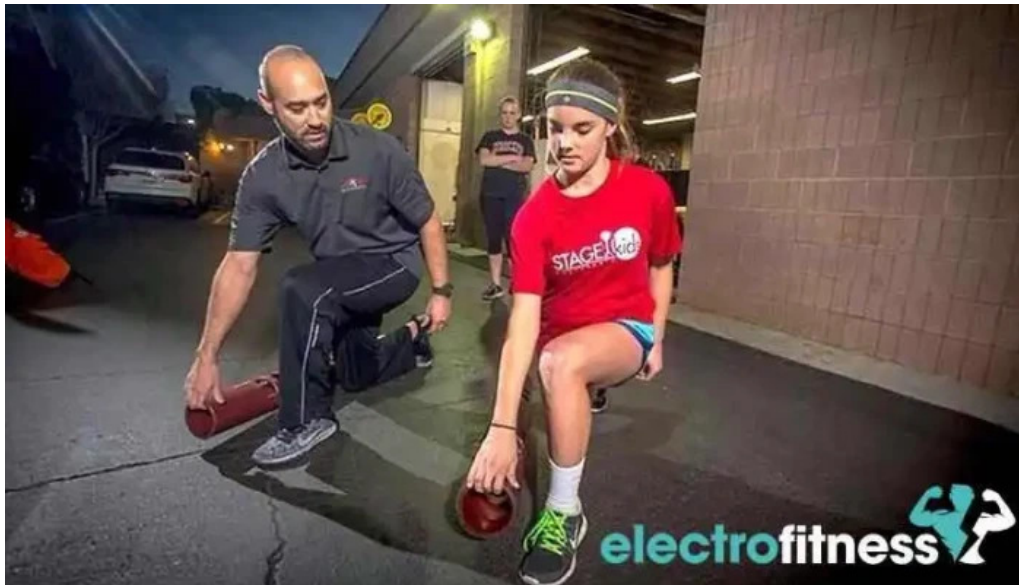
Krave fitness saratoga