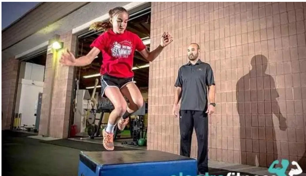
Krave fitness physical fitness