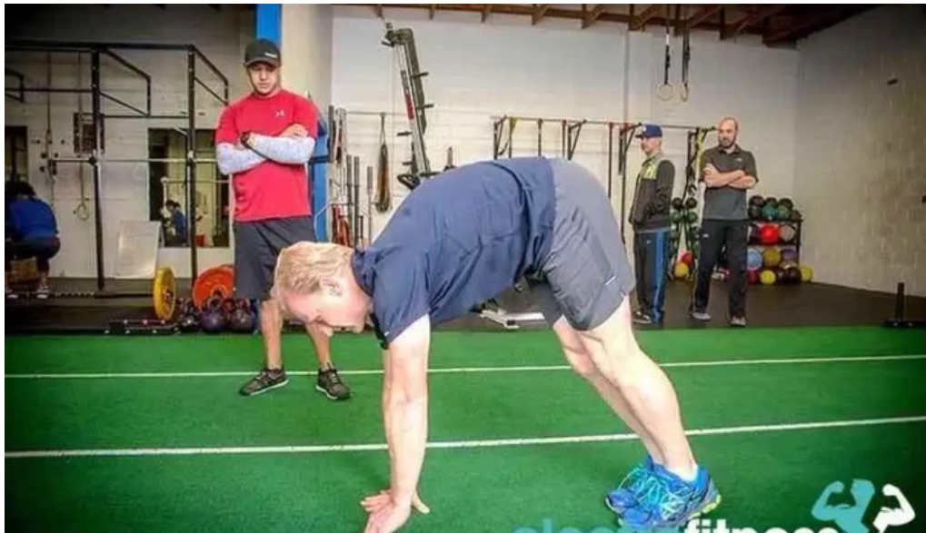
Krave fitness training