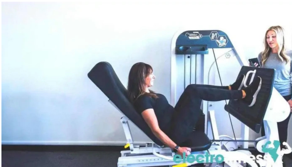
The perfect workout sunnyvale