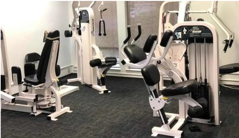
The perfect workout physical fitness