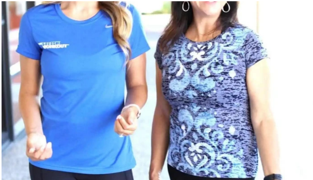
The perfect workout by owner