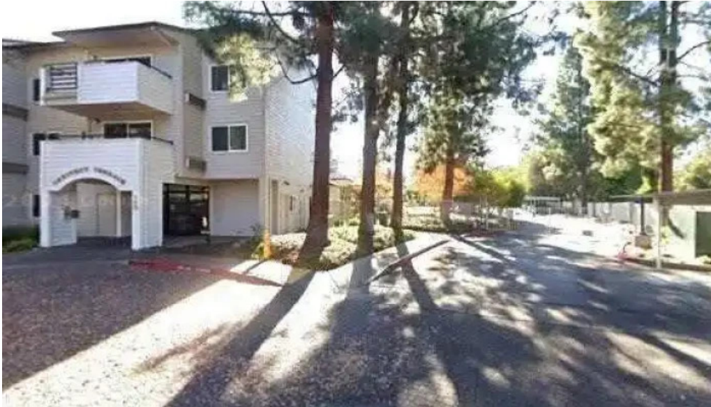
The perfect workout street view 360deg