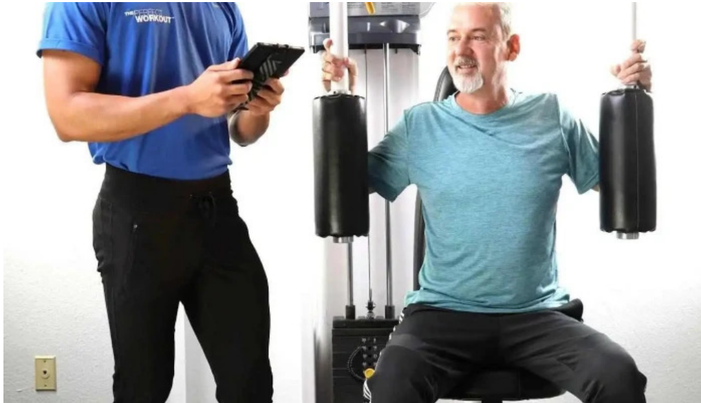
The perfect workout training