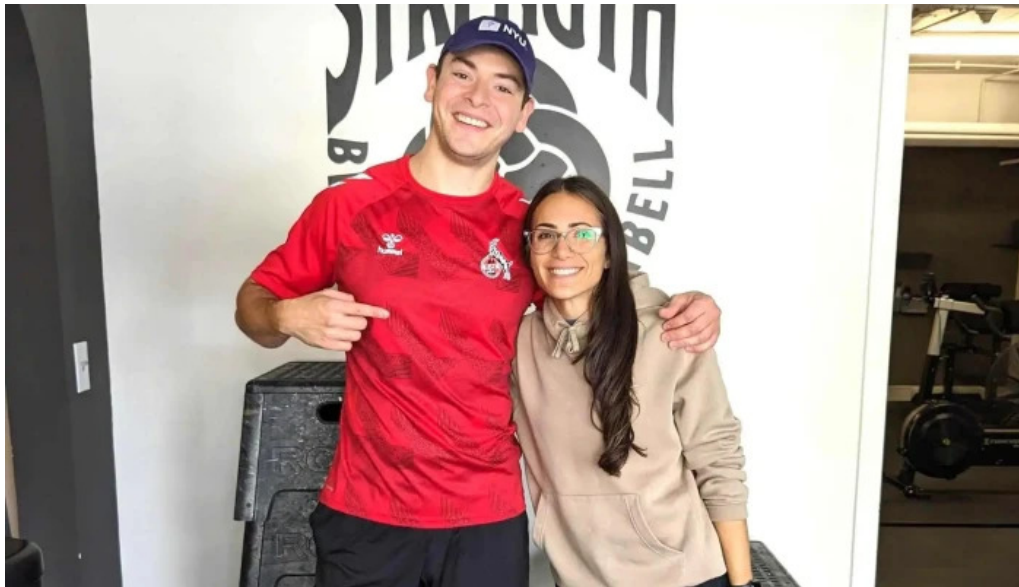
Strength beyond the barbell personal trainer