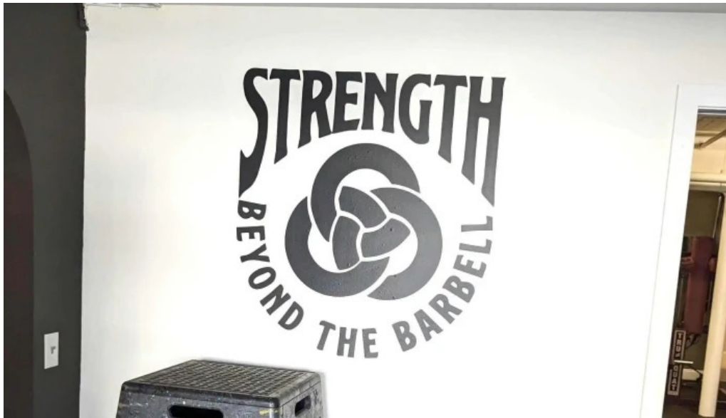
Strength beyond the barbell tuckahoe