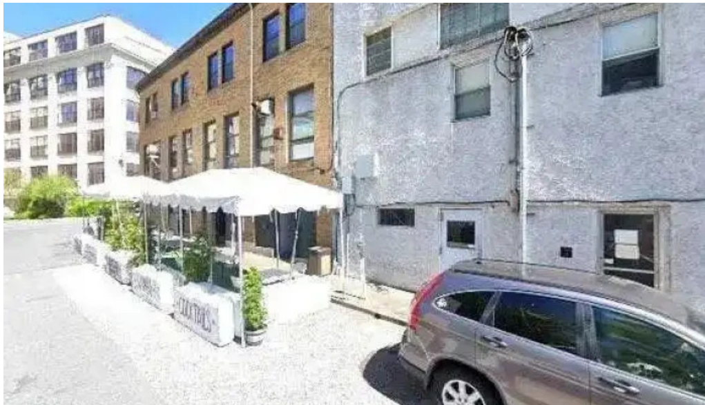
Strength beyond the barbell street view 360deg