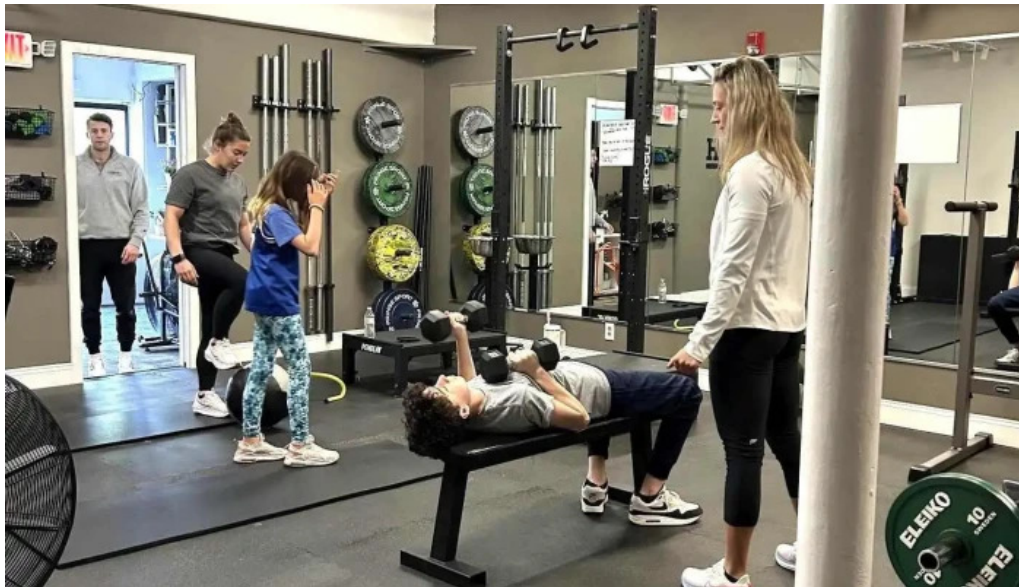
Strength beyond the barbell gym