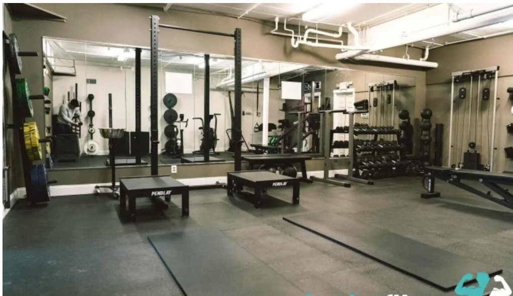
Strength beyond the barbell physical fitness