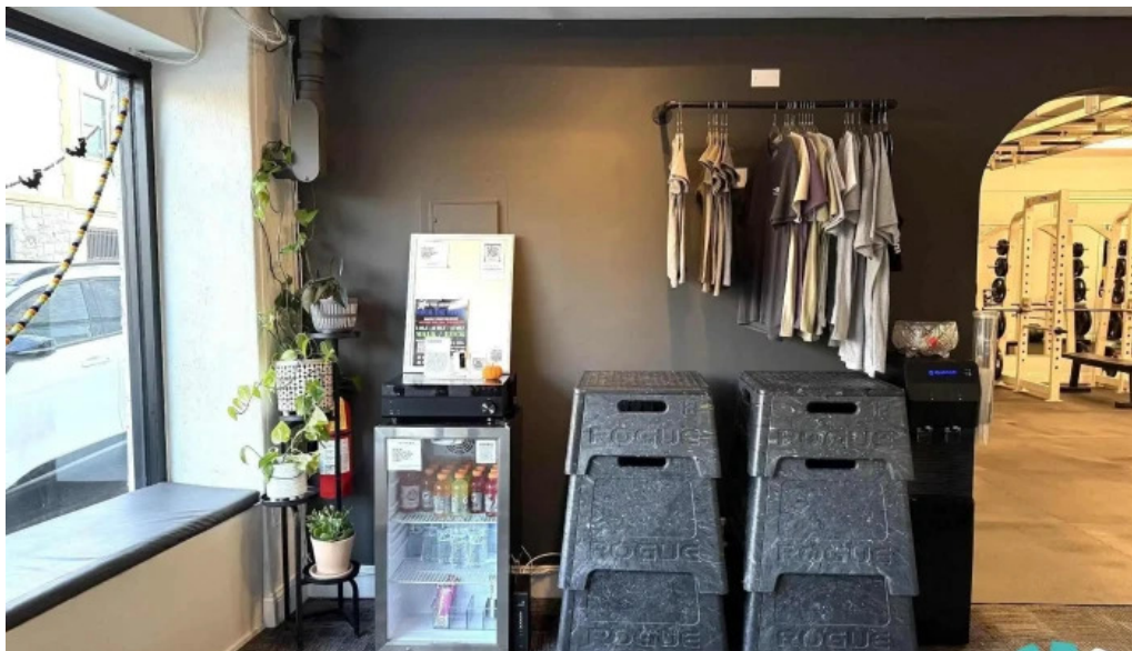
Strength beyond the barbell by owner