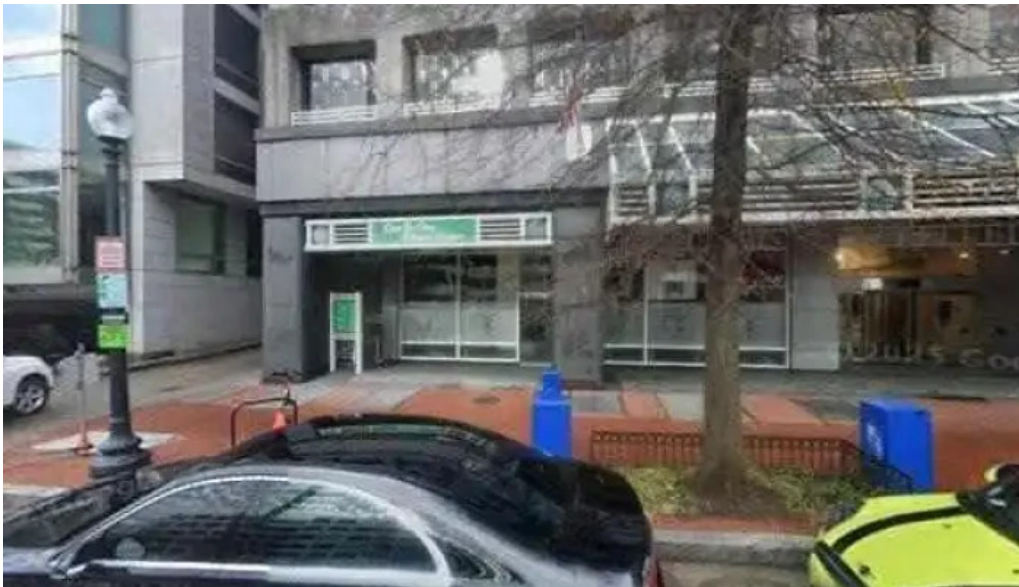
1to1 fitness k street nw street view 360deg