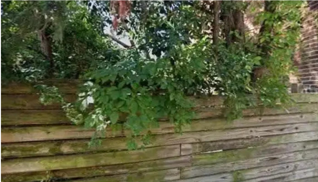
Dc strength nutrition street view 360deg