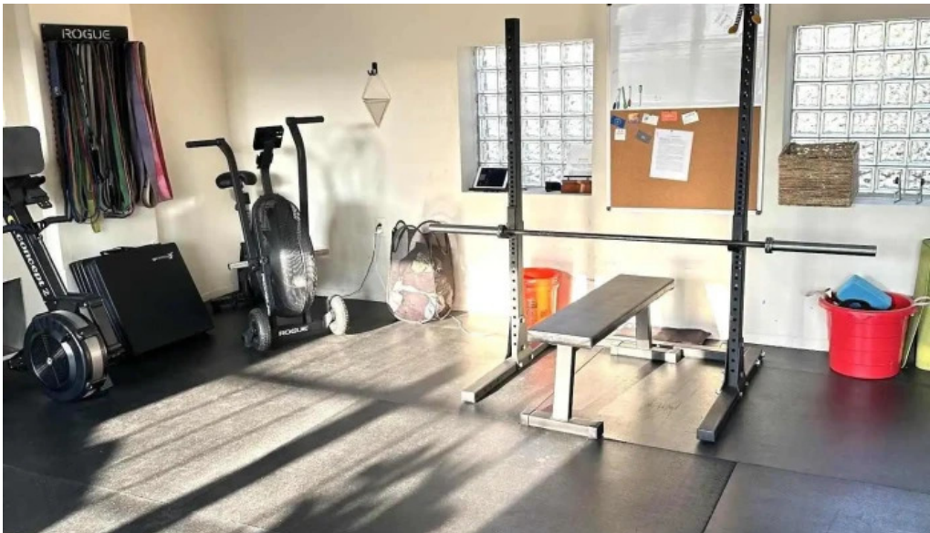
Dc strength nutrition physical fitness