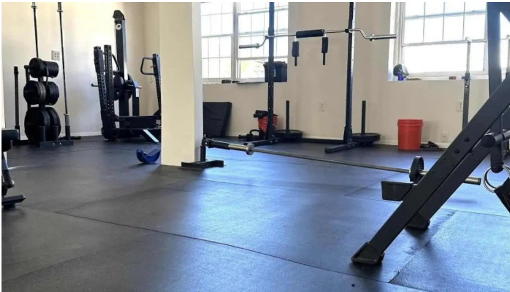
Dc strength nutrition training