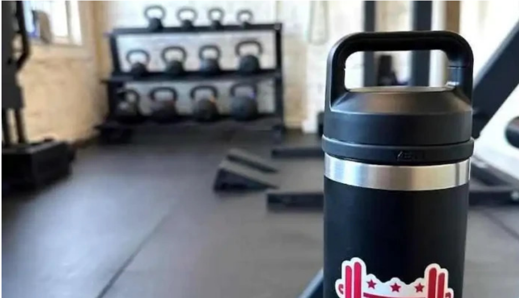
Dc strength nutrition washington