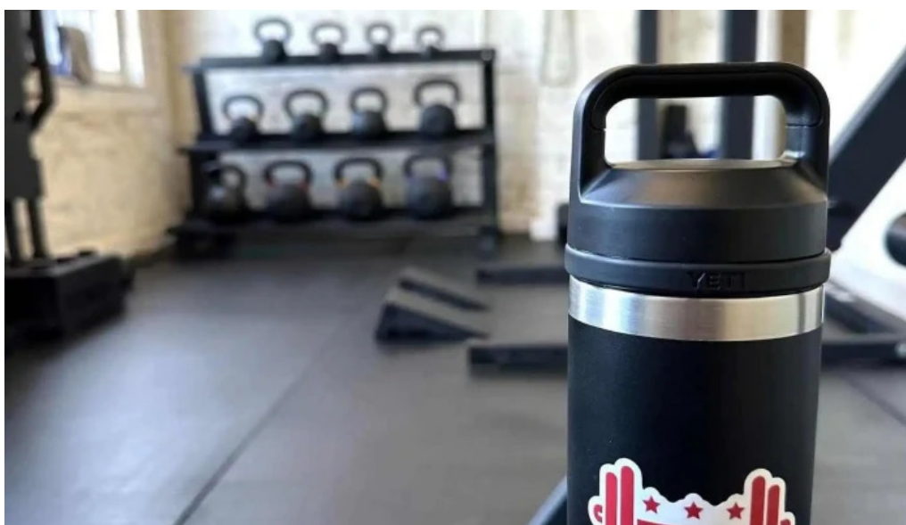
Dc strength nutrition all