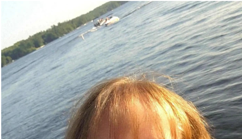
Dc strength nutrition personal trainer