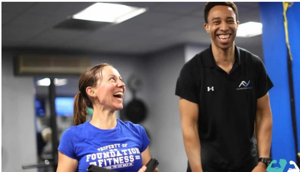
Foundation fitness of the palisades all