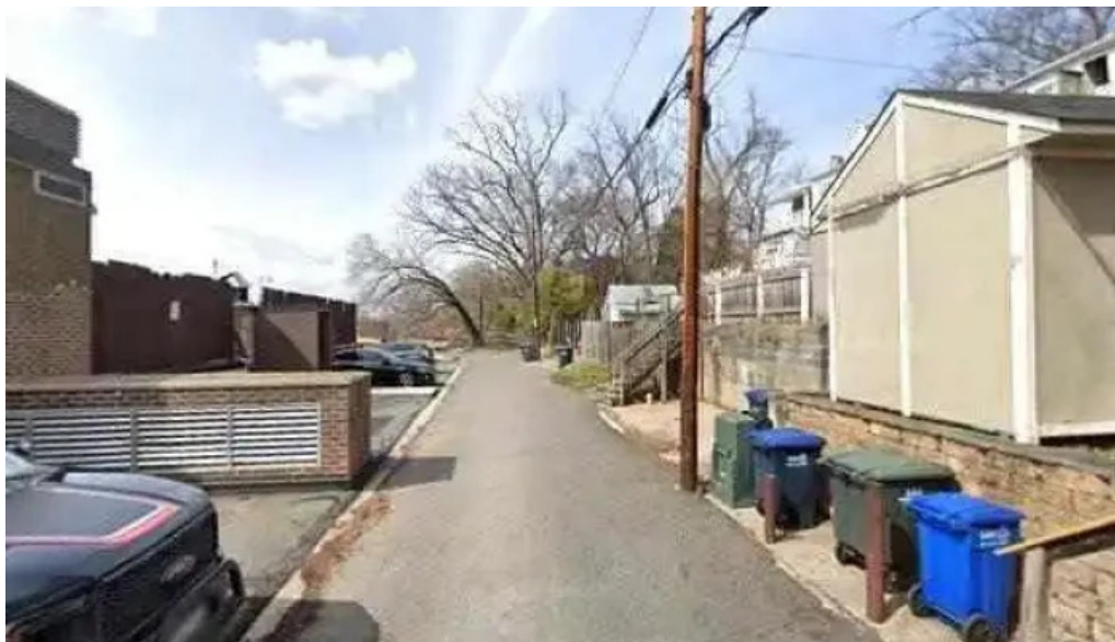
Foundation fitness of the palisades street view 360deg