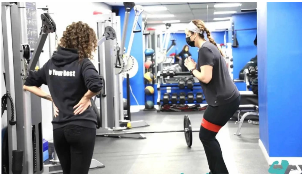
Foundation fitness of the palisades training