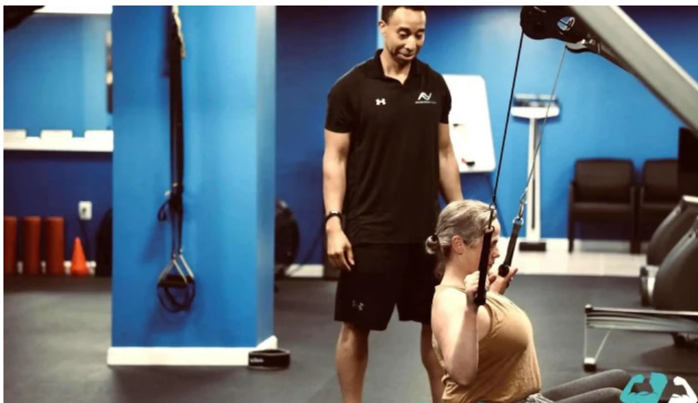
Foundation fitness of the palisades physical fitness