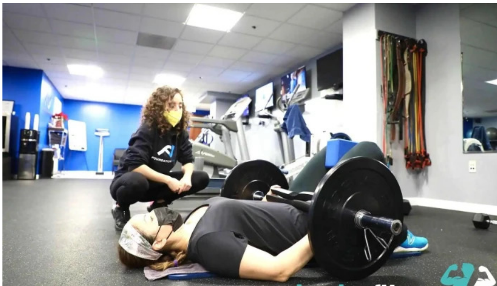
Foundation fitness of the palisades gym