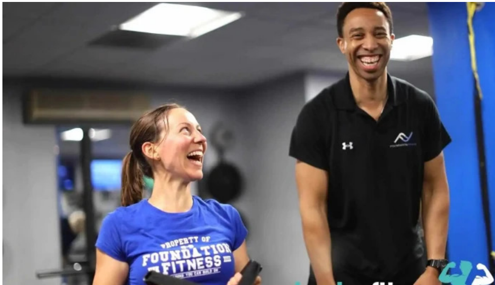
Foundation fitness of the palisades washington