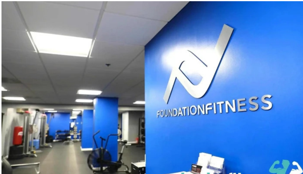
Foundation fitness of the palisades by owner