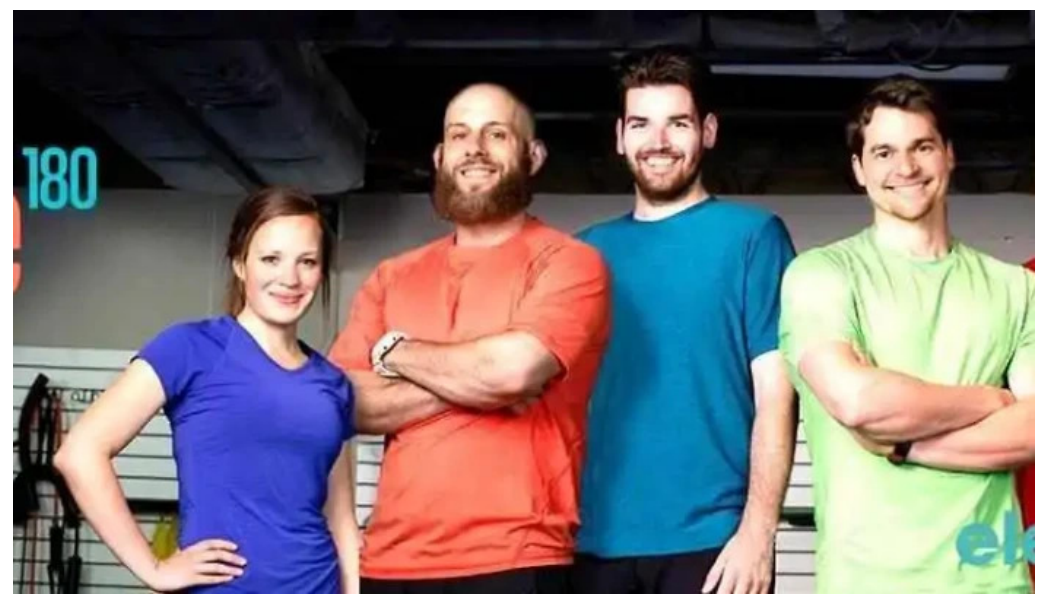
True 180 fitness washington