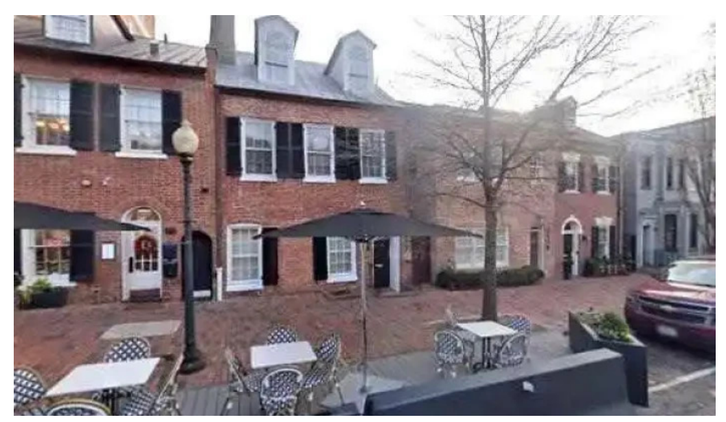
True 180 fitness street view 360deg