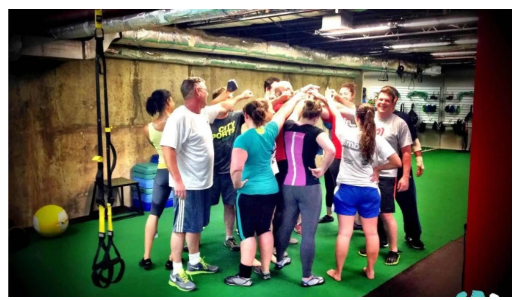
True 180 fitness by owner