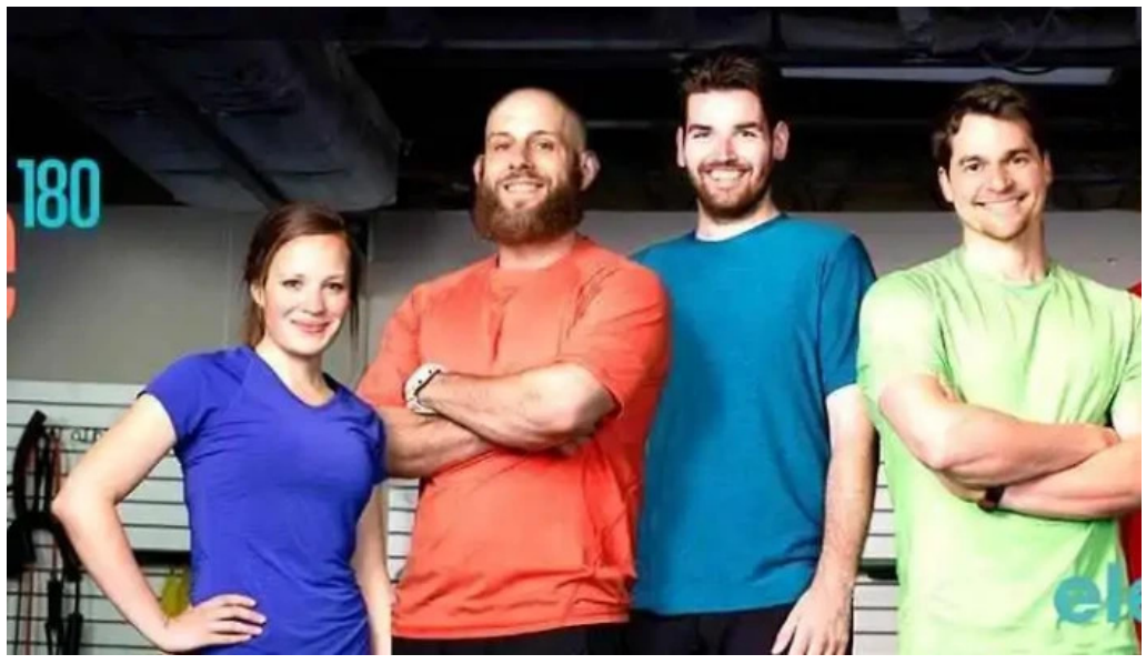
True 180 fitness all