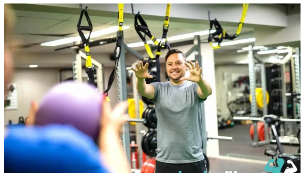
True 180 fitness training