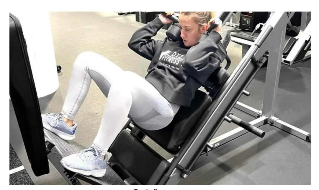
Dx2 fitness gym