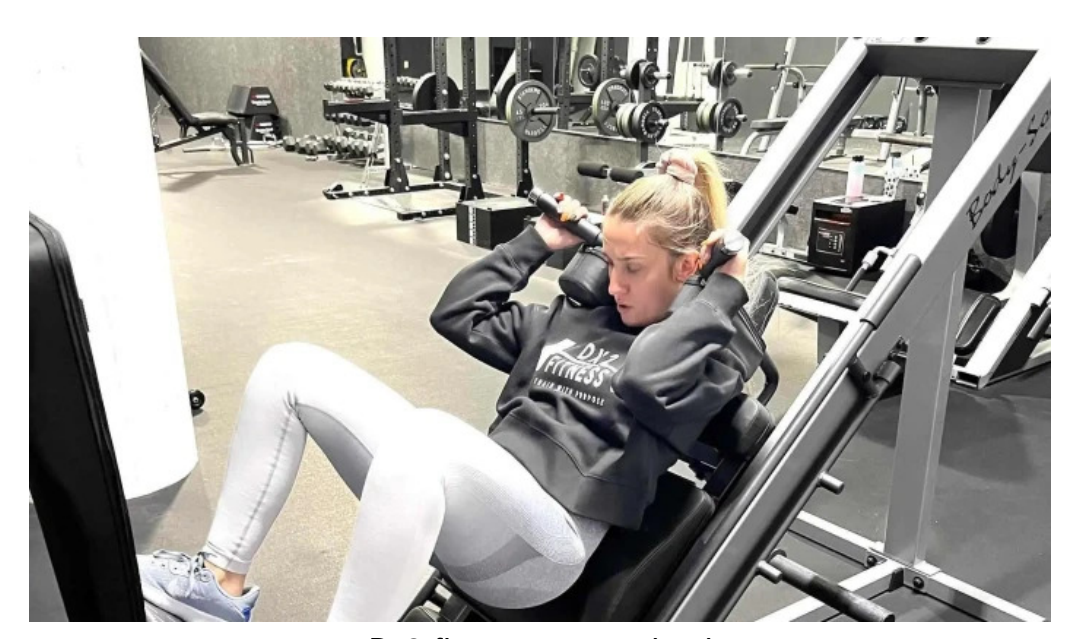
Dx2 fitness personal trainer