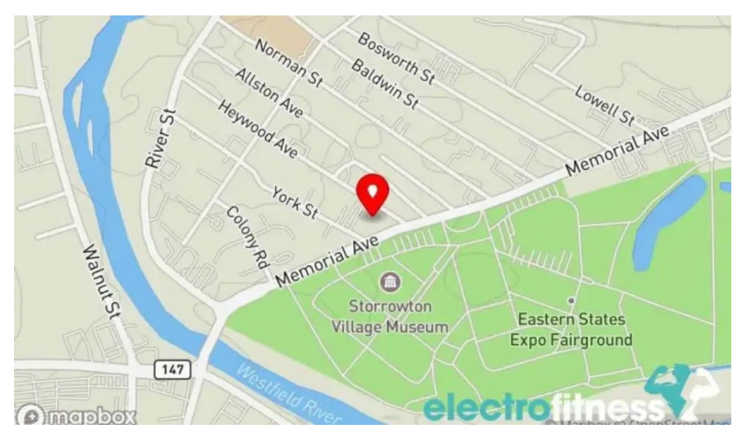
Dx2 fitness map