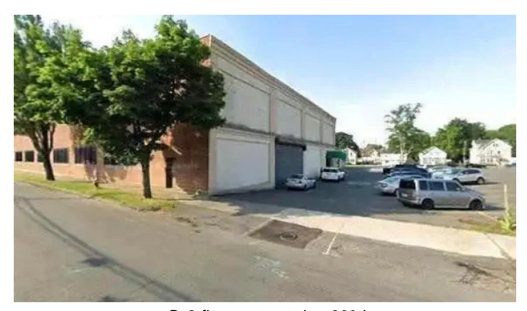
Dx2 fitness street view 360deg