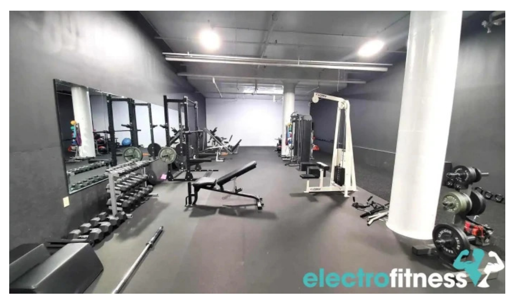
Dx2 fitness west springfield