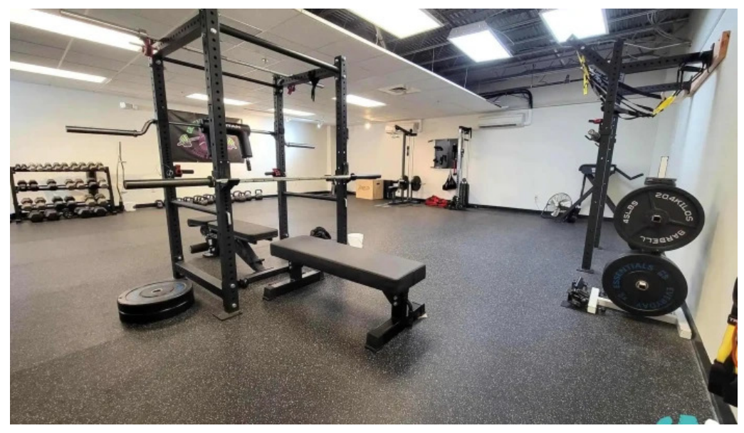
Green mountain iron fitness all