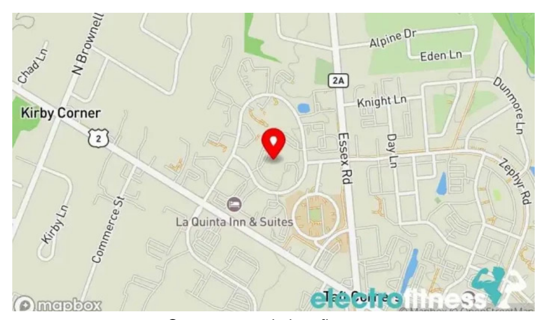
Green mountain iron fitness map