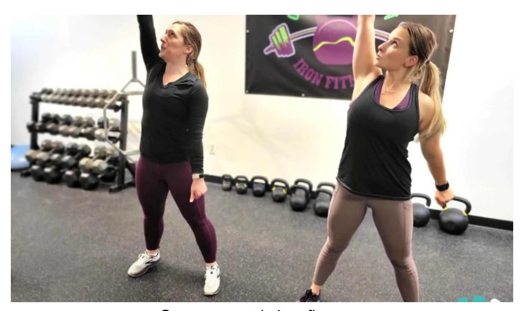
Green mountain iron fitness gym