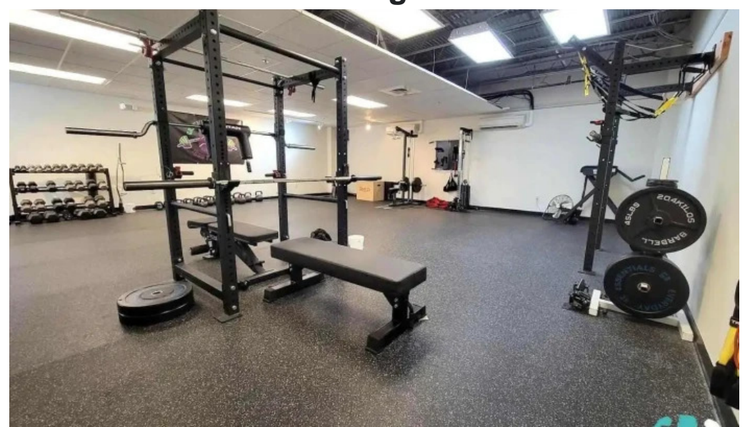
Green mountain iron fitness williston