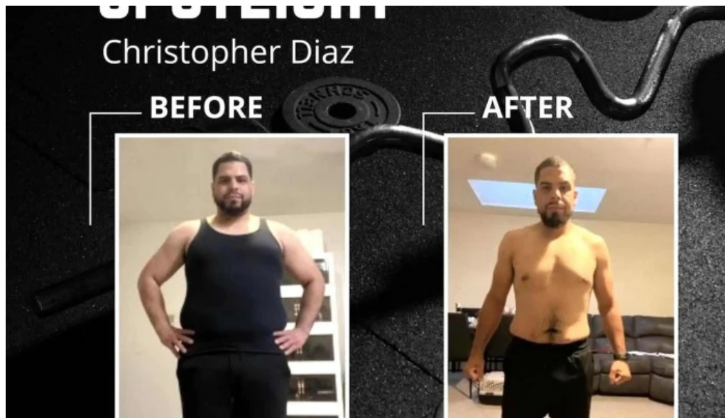
Elevated limits physical fitness program