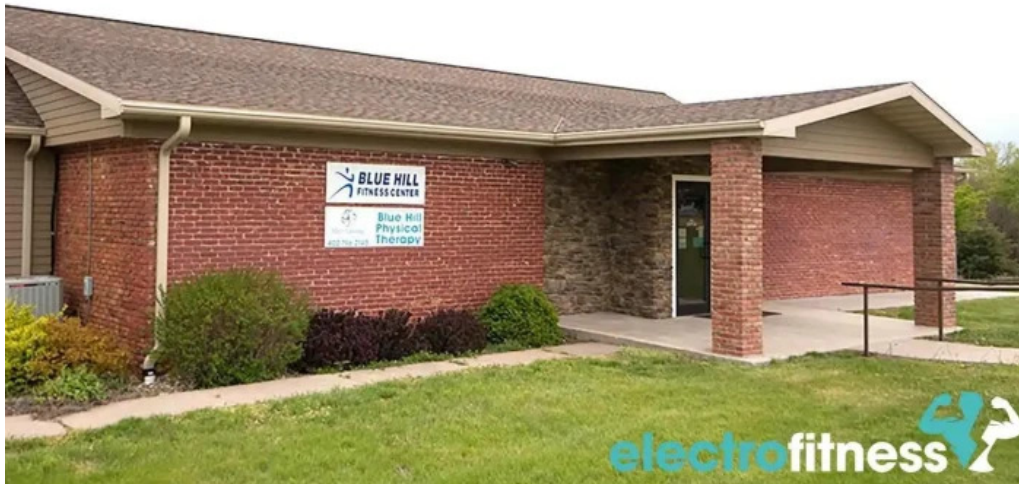
Blue hill fitness center all