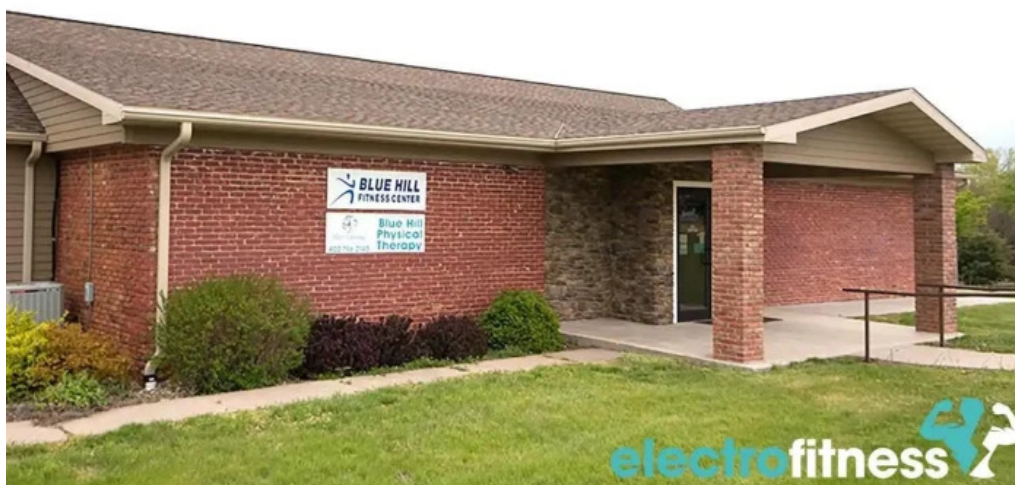
Blue hill fitness center blue hill