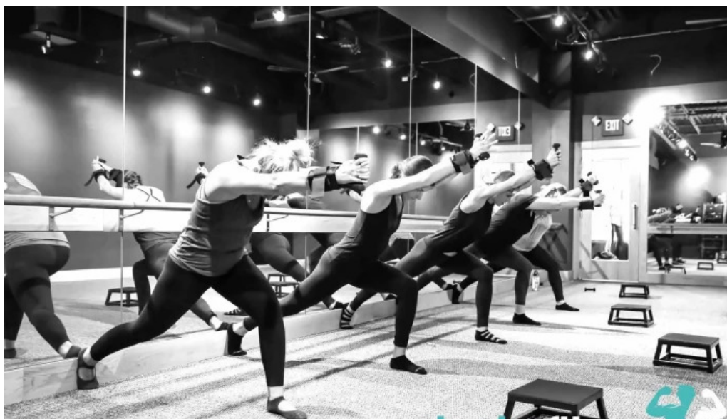
Pure barre by owner