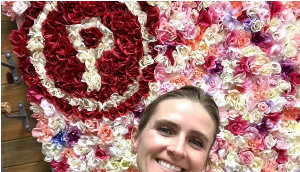
Pure barre physical fitness program