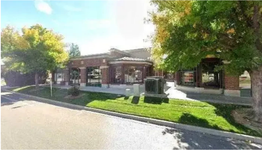
Pure barre street view 360deg