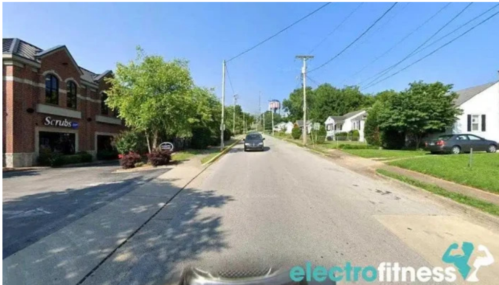
Barre co bowling green